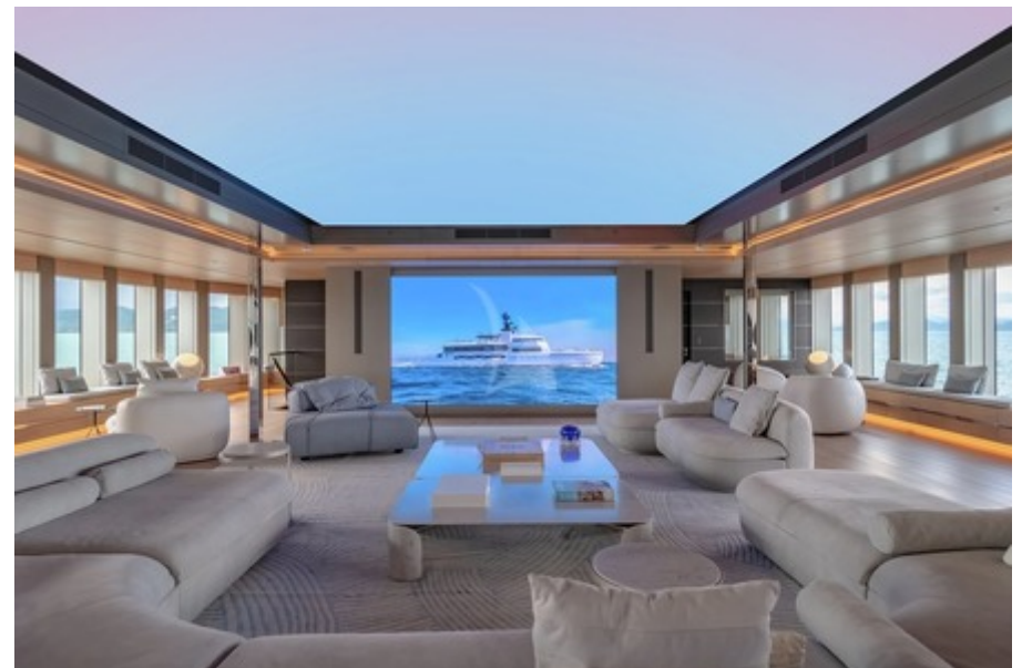
Loft - cinema set up