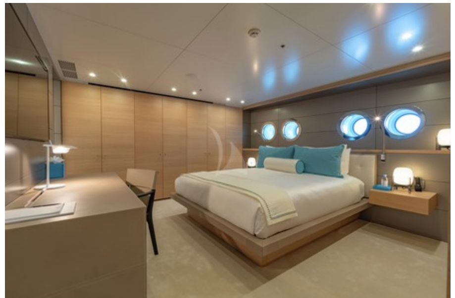
Main deck VIP cabin