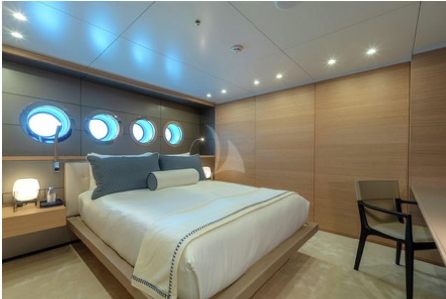
Main deck VIP cabin