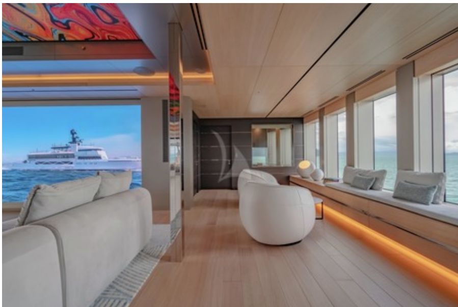
Owner's deck - Loft details