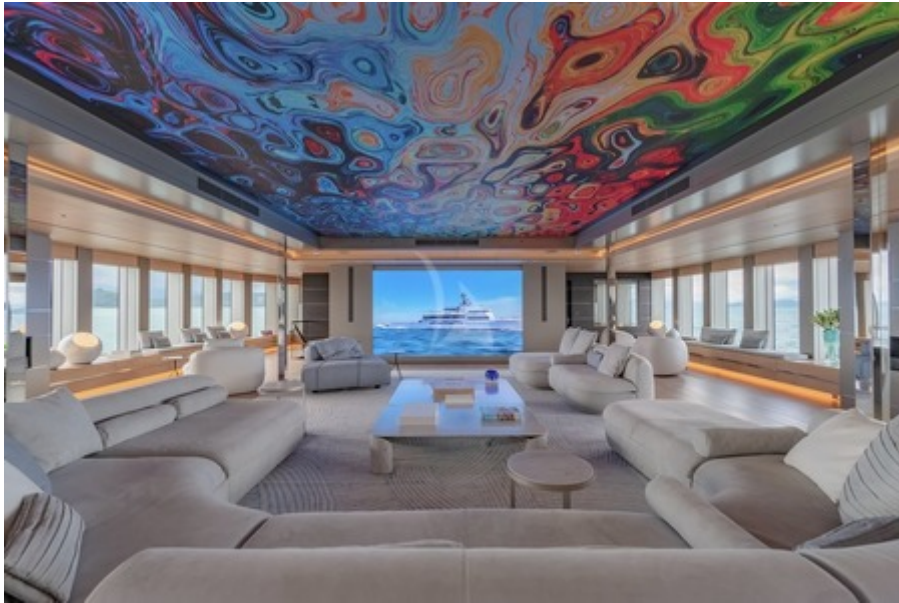
Loft - interactive ceiling