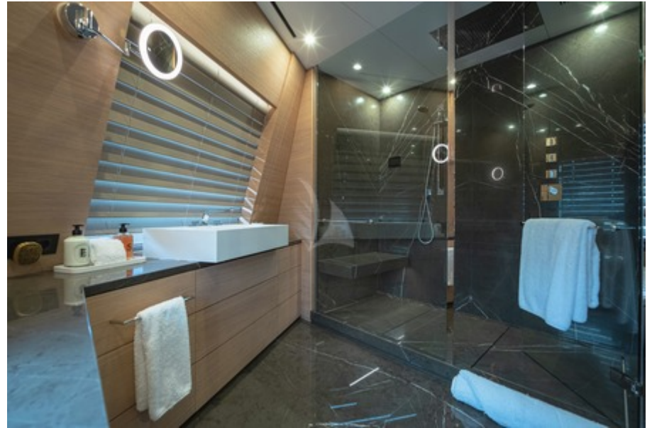
His en suite shower room