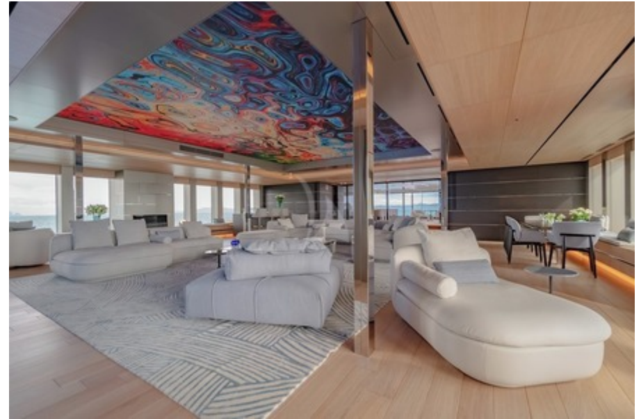
Owner's deck - Loft area