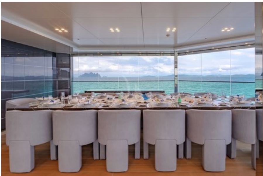
Winter garden dining