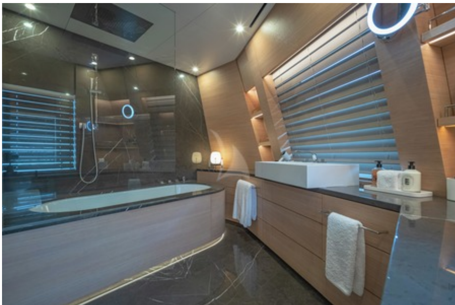
Hers en suite bathroom