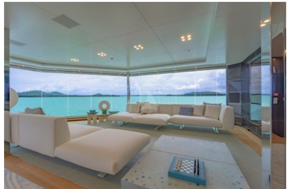
Winter garden lounge