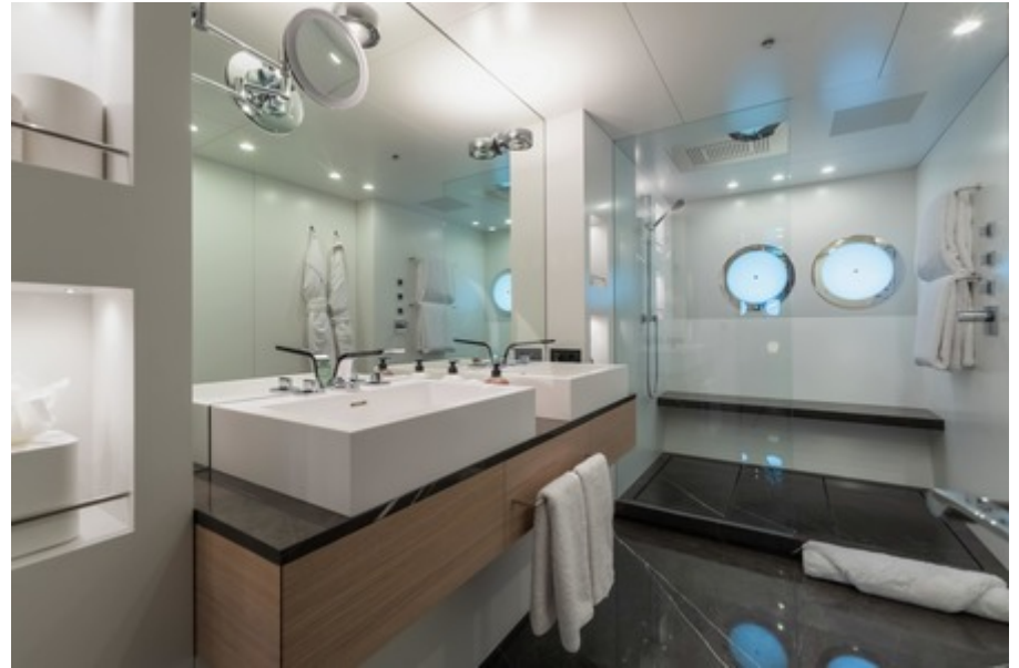
VIP cabin en suite shower room