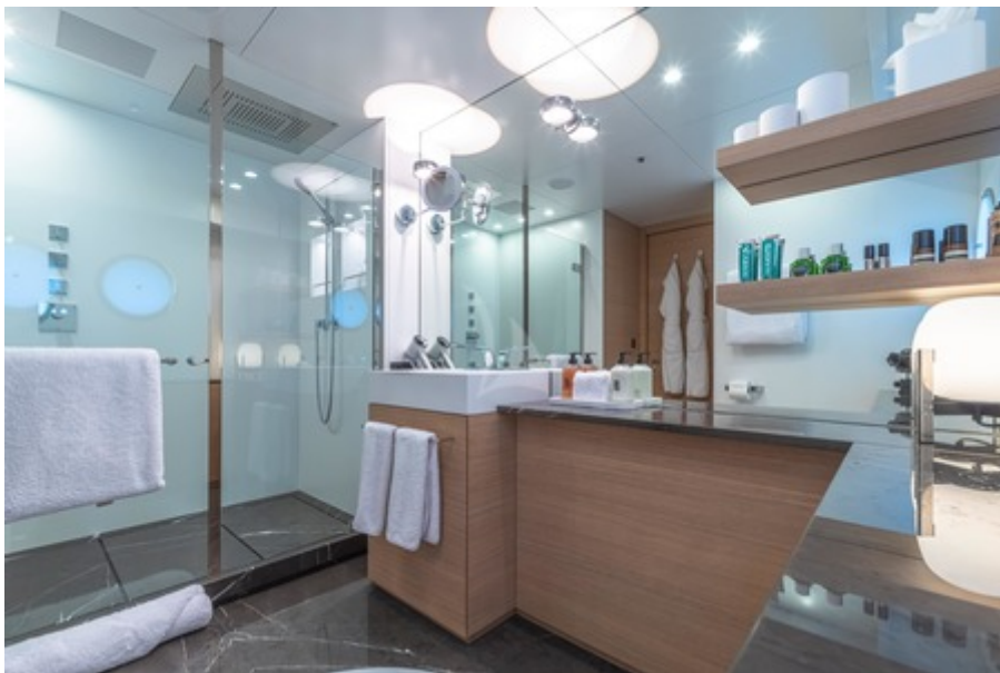
VIP cabin en suite shower room