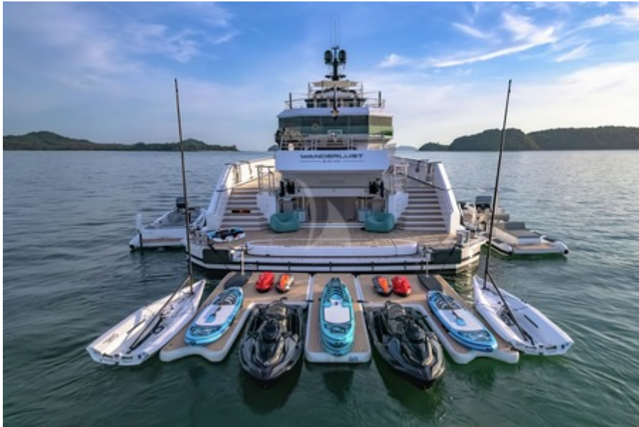
Watersports & tenders