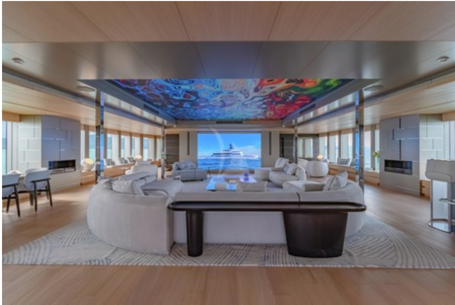
Owner's deck - Loft area