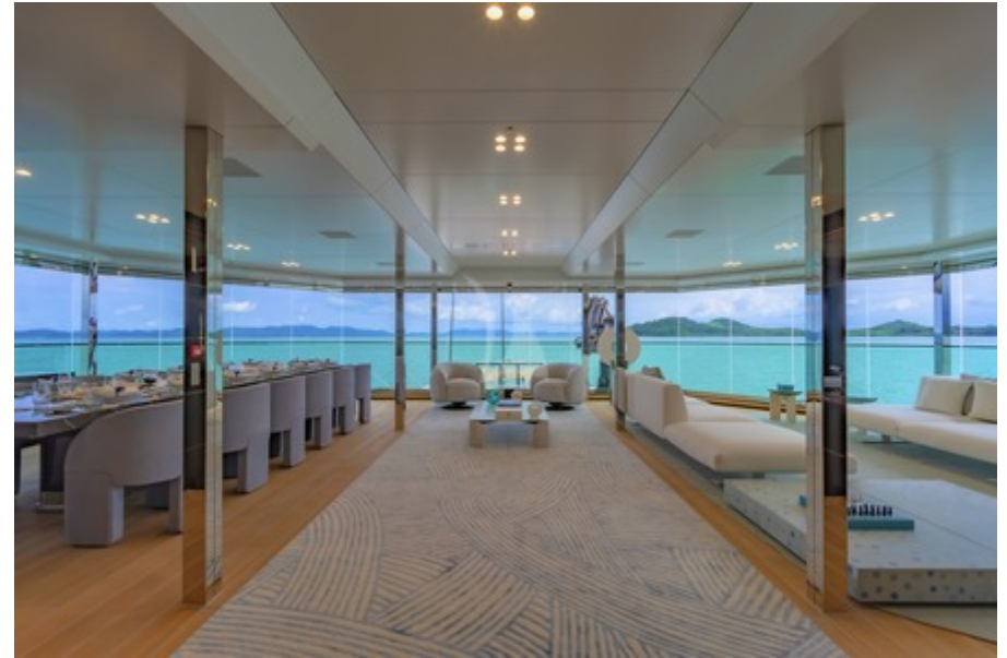
Owner's deck - Winter garden dining and lounge area