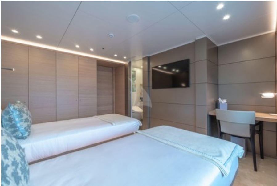
Main deck double cabin (convertible into twin)