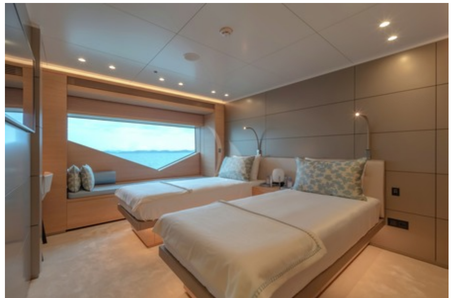
Main deck double cabin (convertible into twin)