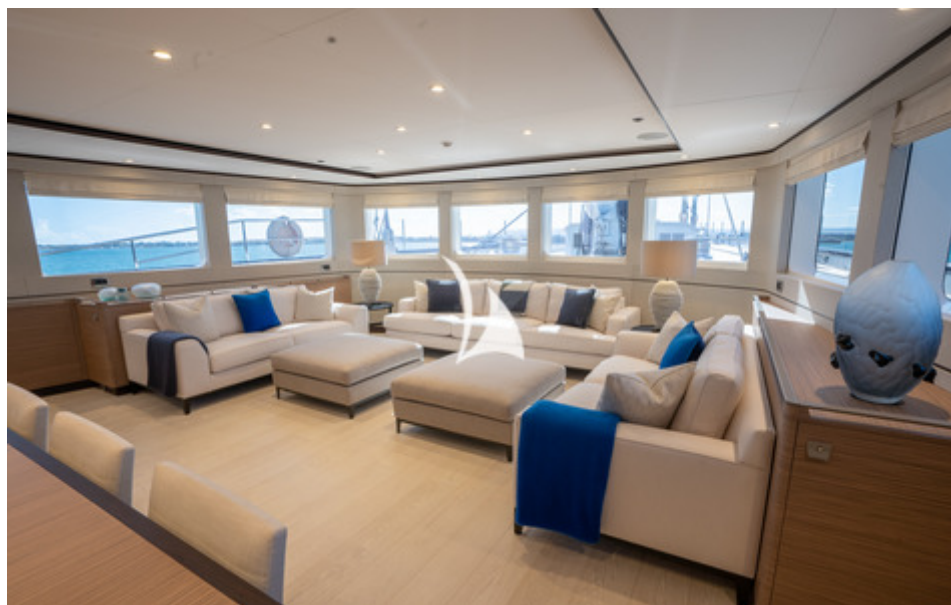
Main deck forward saloon