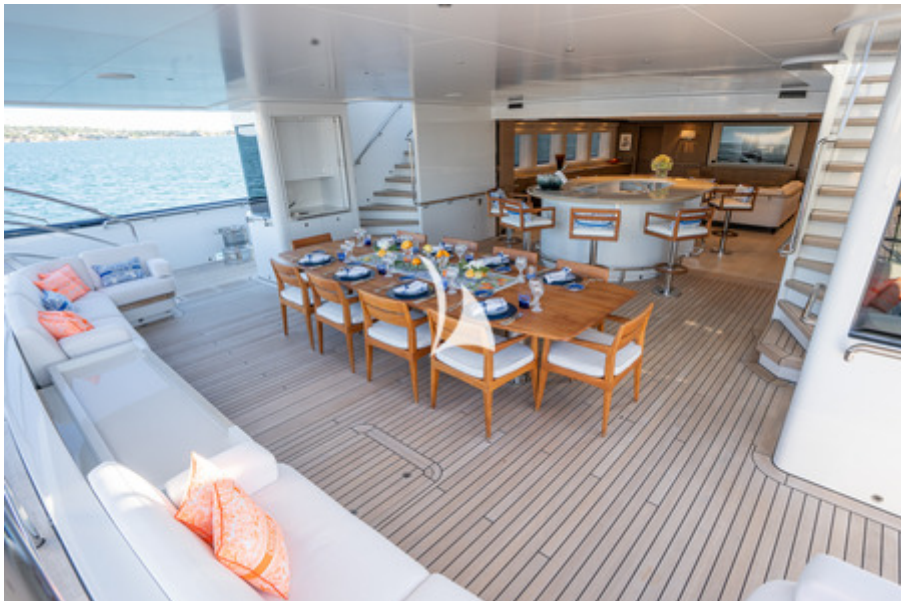
Main deck aft dining opening onto the bar and the aft interior saloon