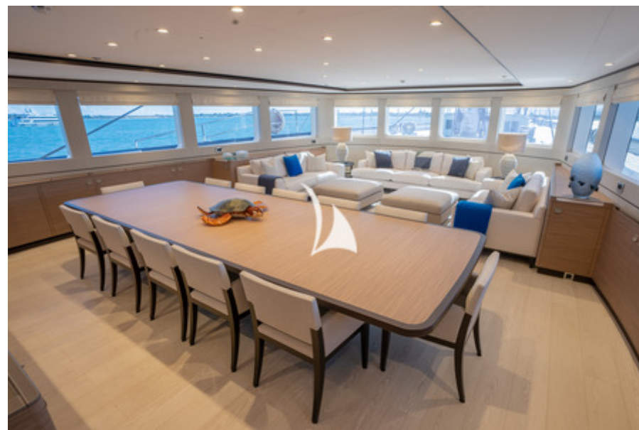
Main deck forward saloon and interior dining