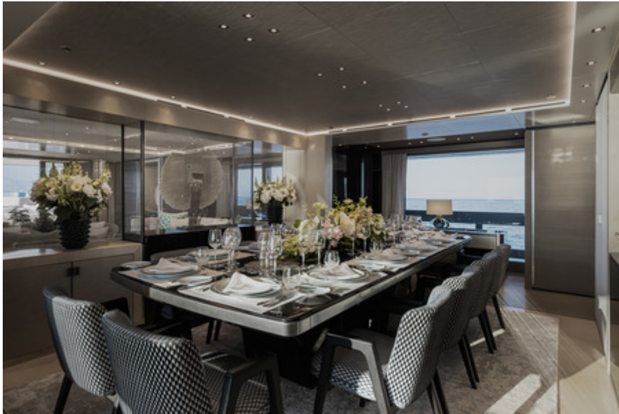
Main deck interior dining