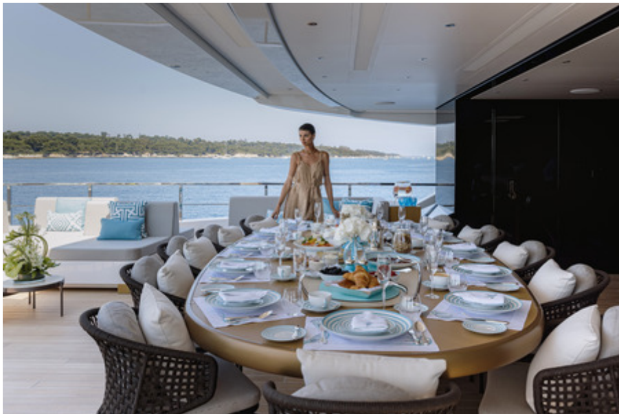
Owners Deck dining