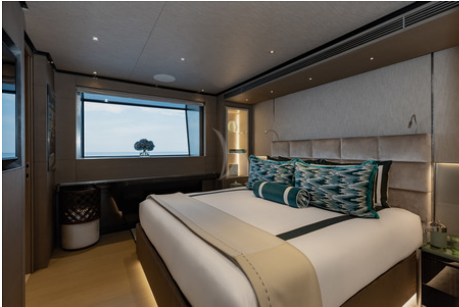
Port Double Guest Cabin