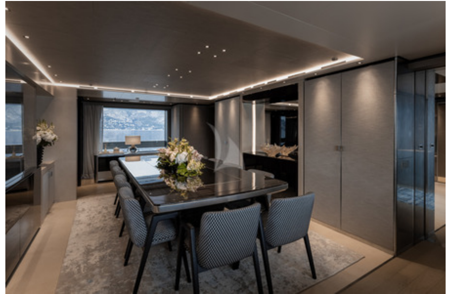
Main deck interior dining