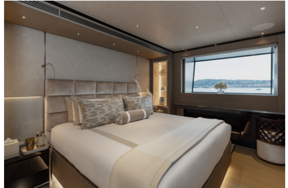
Starboard Double Guest Cabin