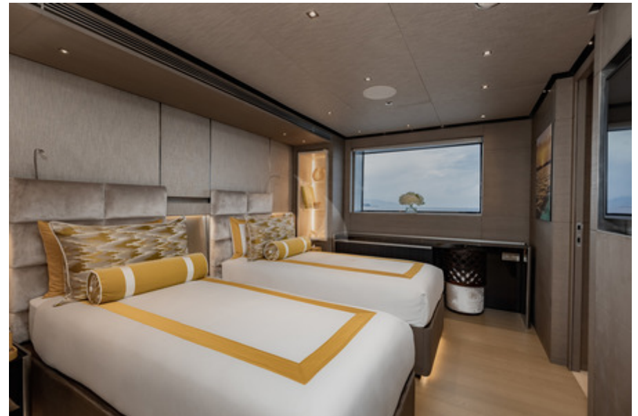
Port Convertible Guest Cabin