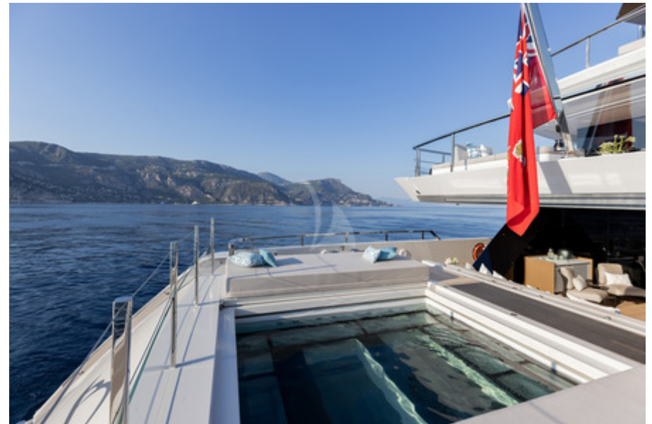
Aft Deck Swimming Pool