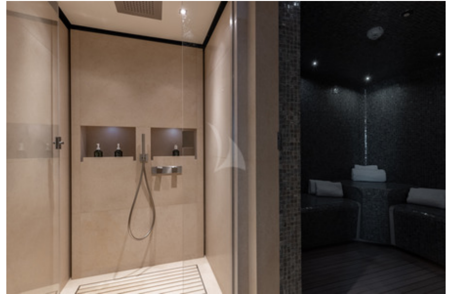
Sauna / Steam Shower