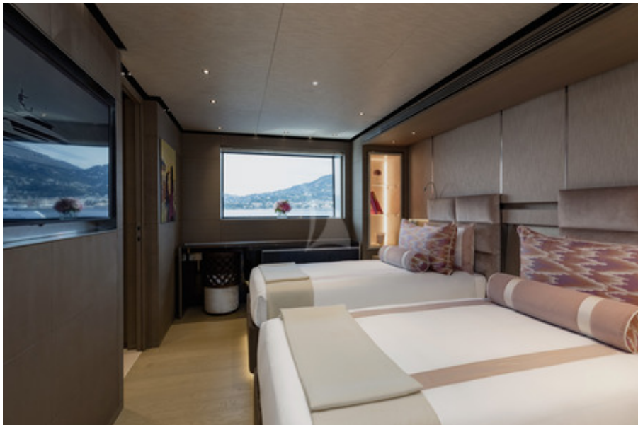
Starboard Convertible Guest Cabin