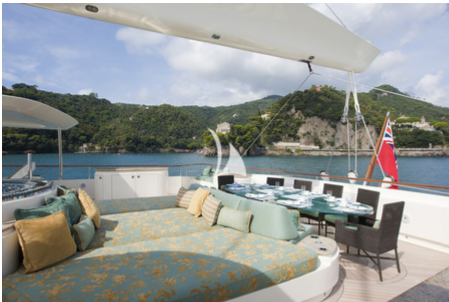
Sun pads on bridge deck