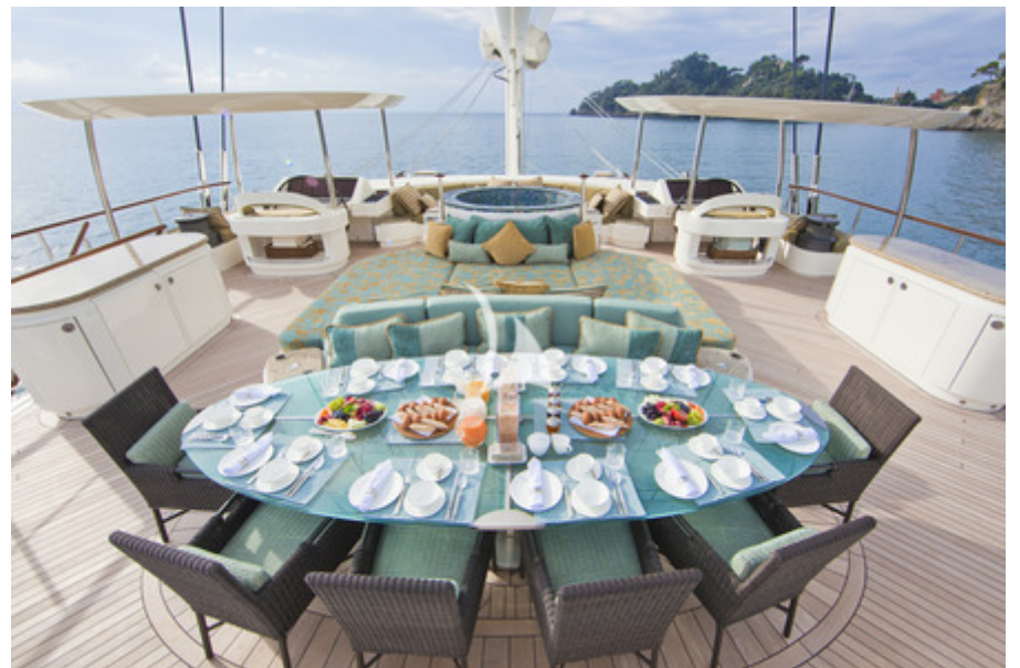
Bridge Deck dining