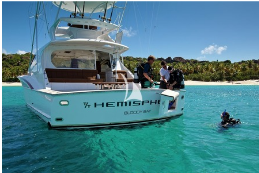
T/T HEMISPHERE 16.4m (54ft)F&S Custom sports fishing boat