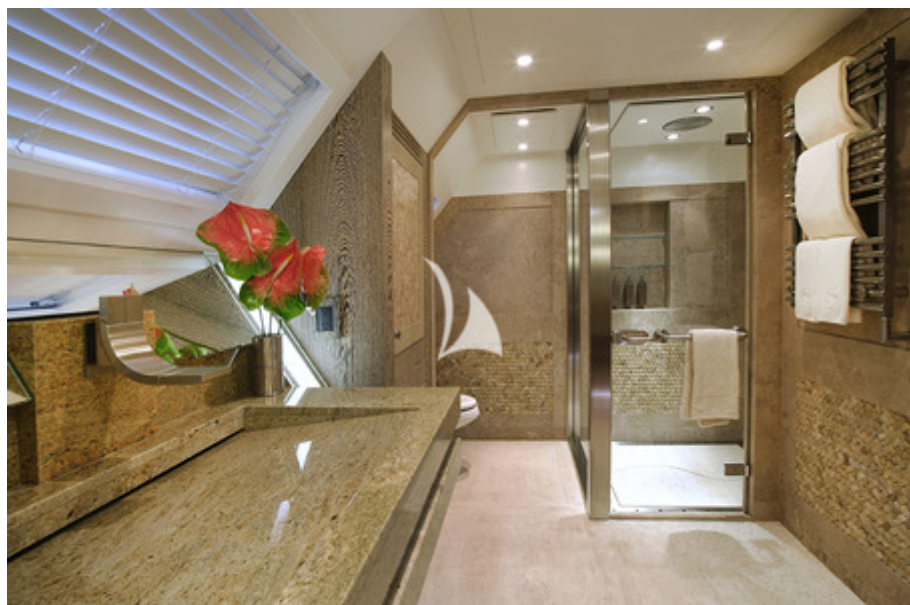
Main cabin shower ensuite