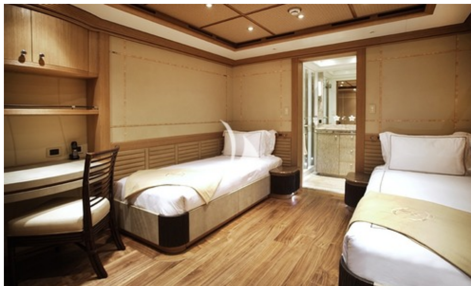
Twin cabin with 2 pullman and shower ensuite