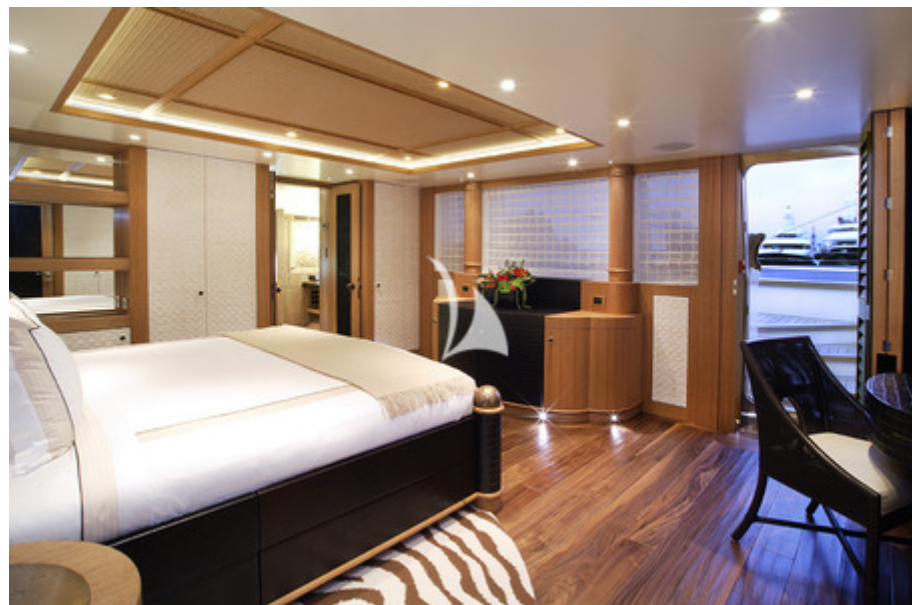
Identical Master/VIP cabin 2