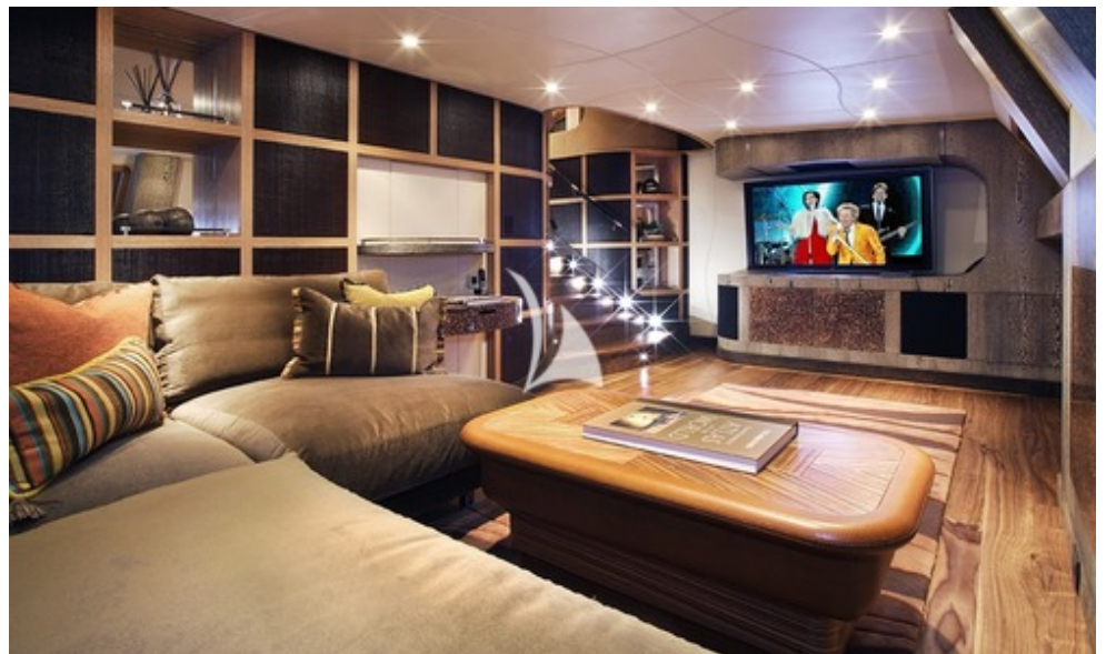
Games and TV room on main deck