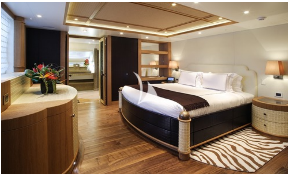
Identical Master/VIP cabin