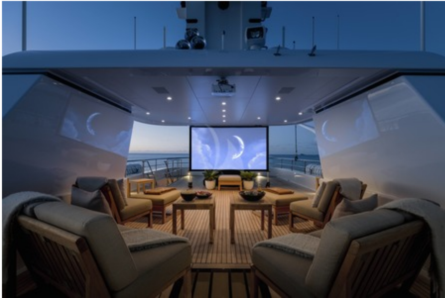
Sun deck cinema set up