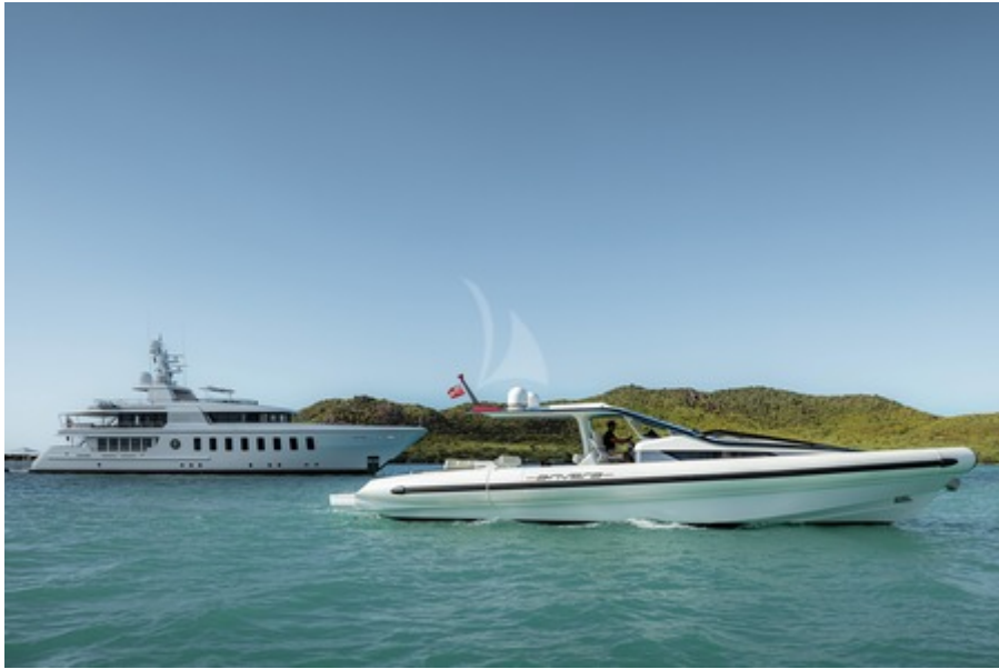
14.6m (46ft) Anvera chase tender