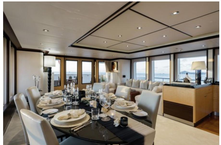
Main lounge dining