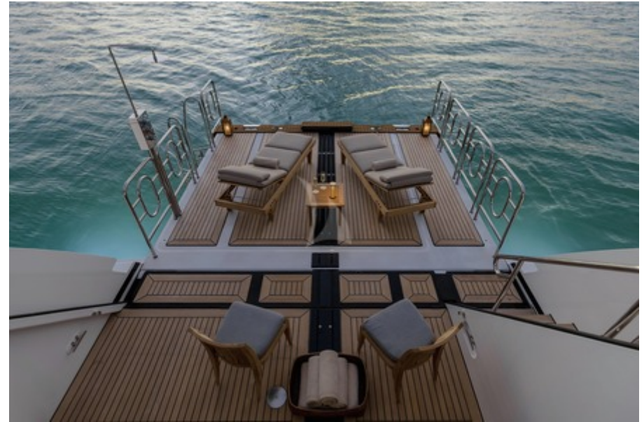
Lower deck beach club - hydraulic swim platform