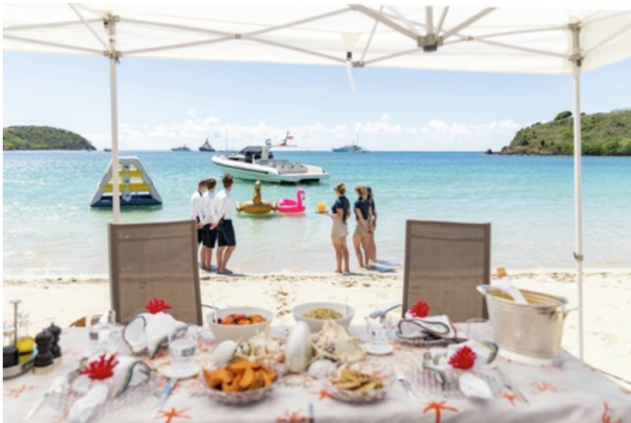
Beach club set up