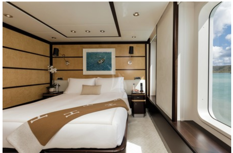
Four convertible double/twin cabins - main deck