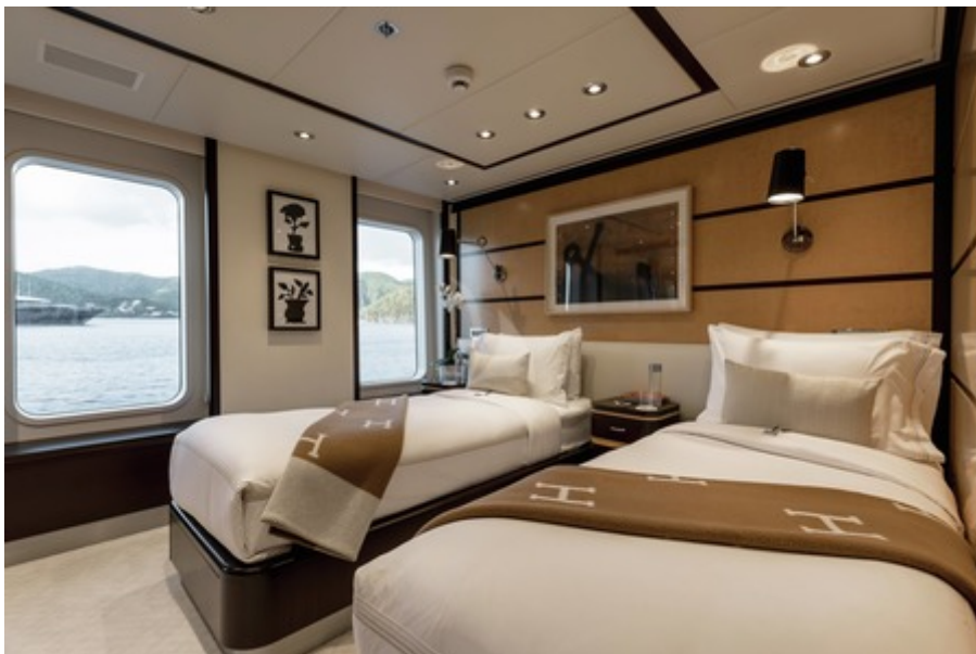
Four convertible double/twin cabins - main deck