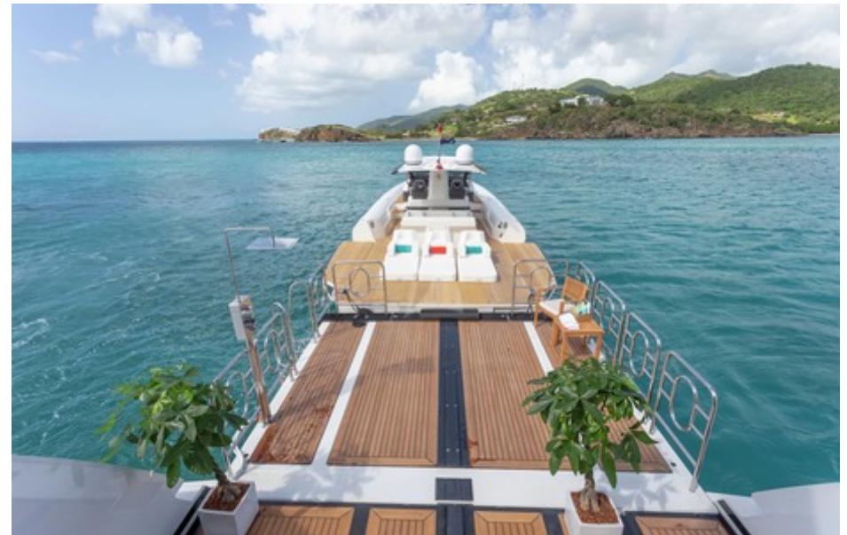
14.6m (46ft) Anvera chase tender