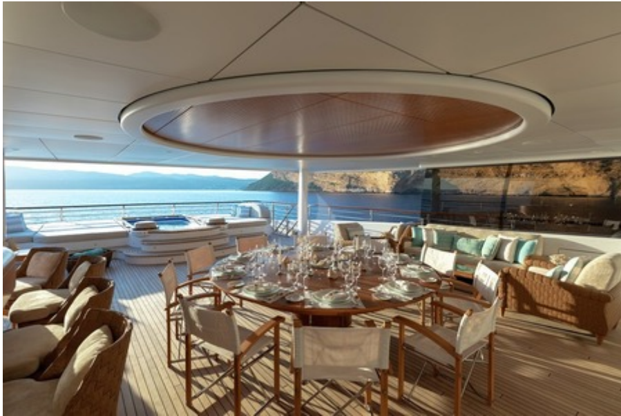
Bridge deck - Dining