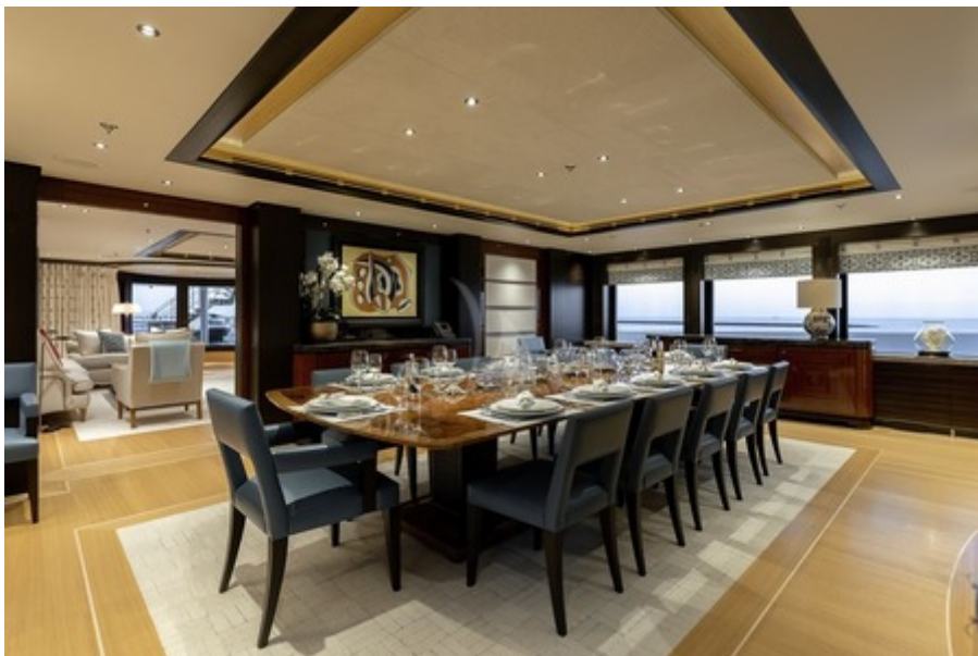
Main deck - Dining