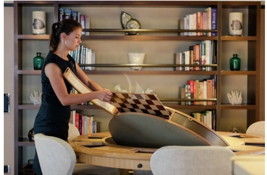
Upper deck - Saloon - Games table