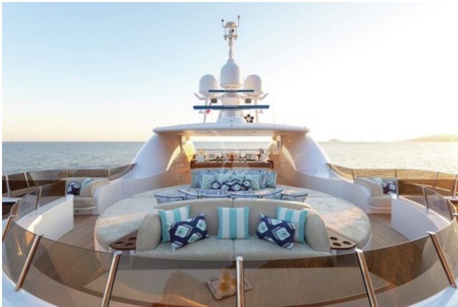
Sun deck - Lounging area