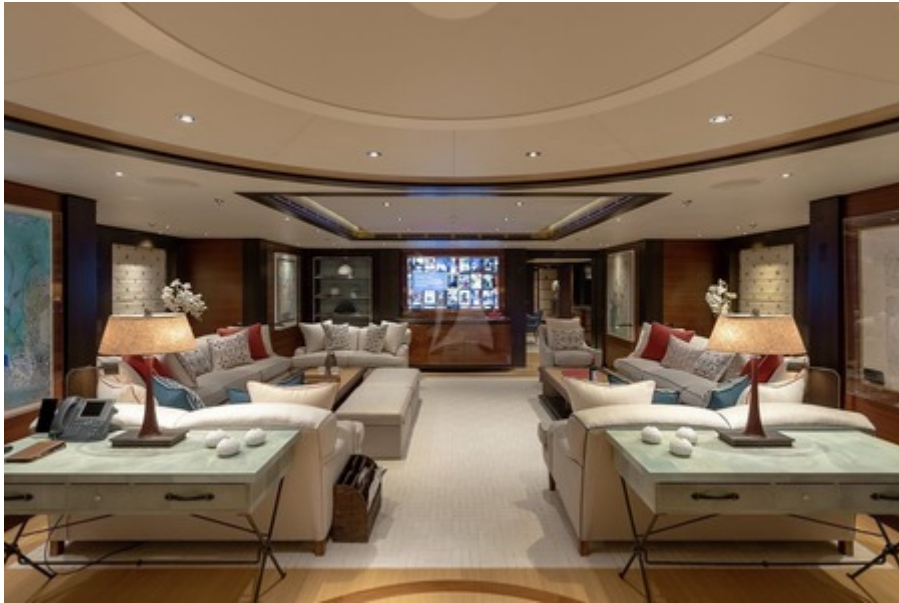
Main deck - Saloon