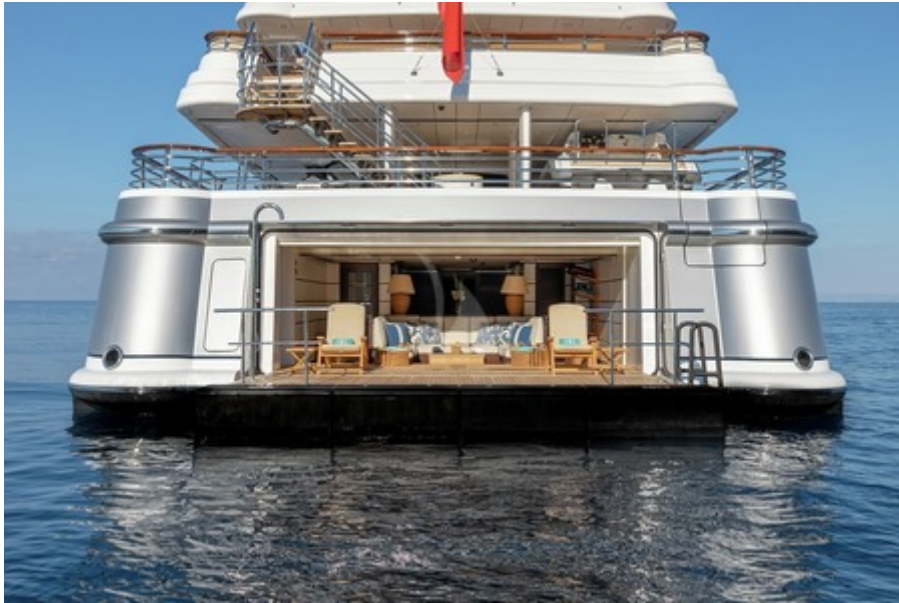
Lower deck - Beach club