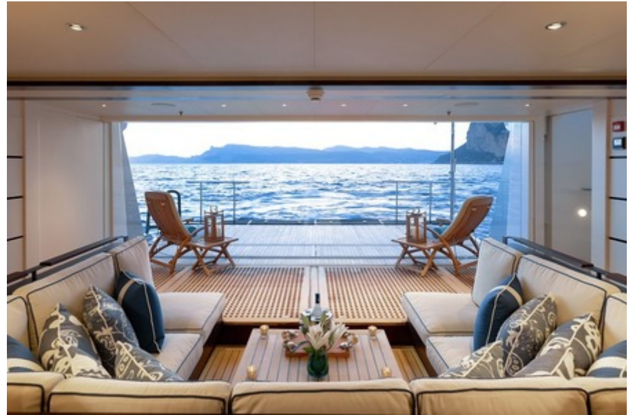
Lower deck - Beach club