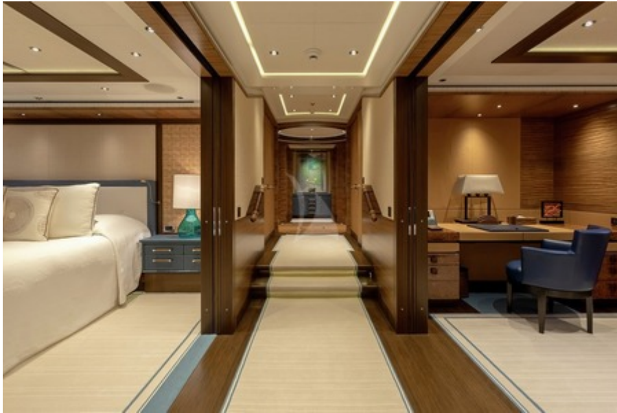
Main deck - Master suite