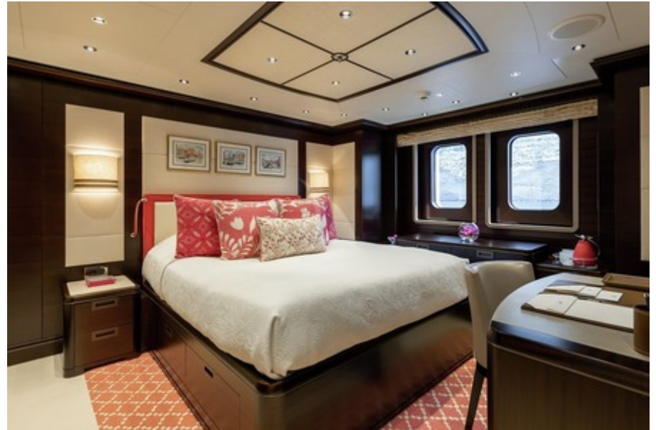
Lower deck - Double cabin