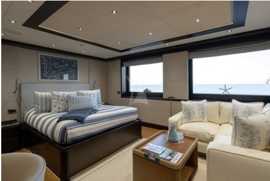
Upper deck - VIP suite 1