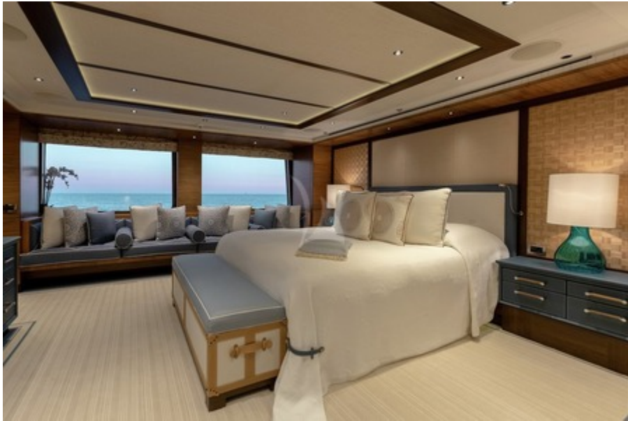
Main deck - Master suite