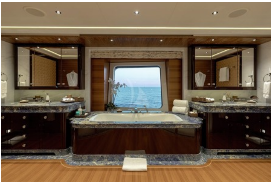
Master en suite