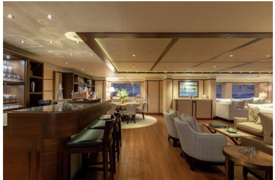
Upper deck - Saloon