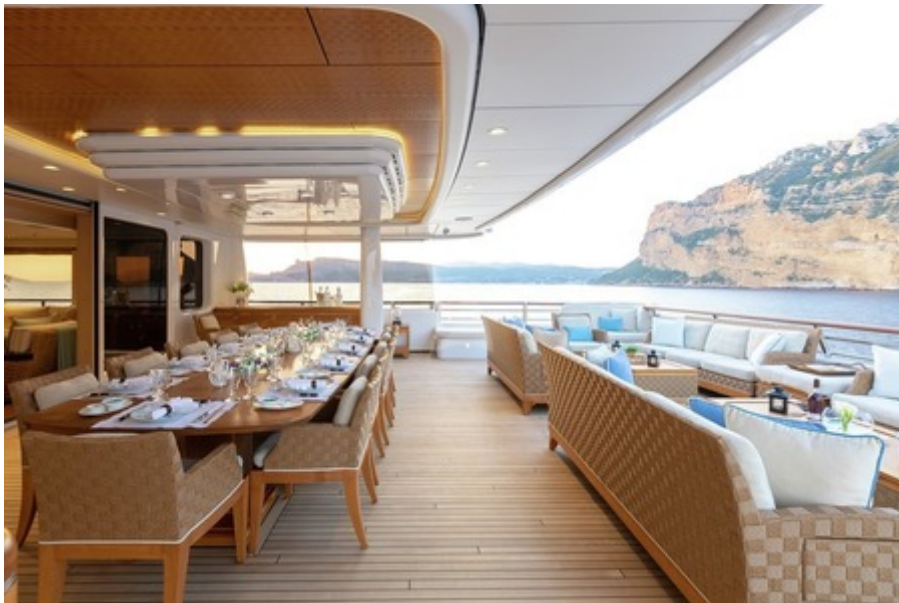
Upper deck - Dining