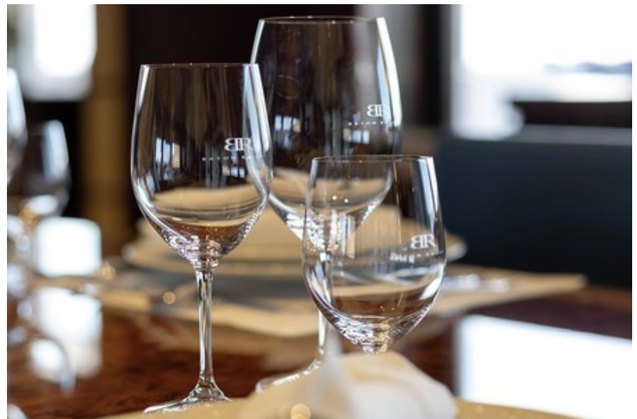
Main deck - Dining details