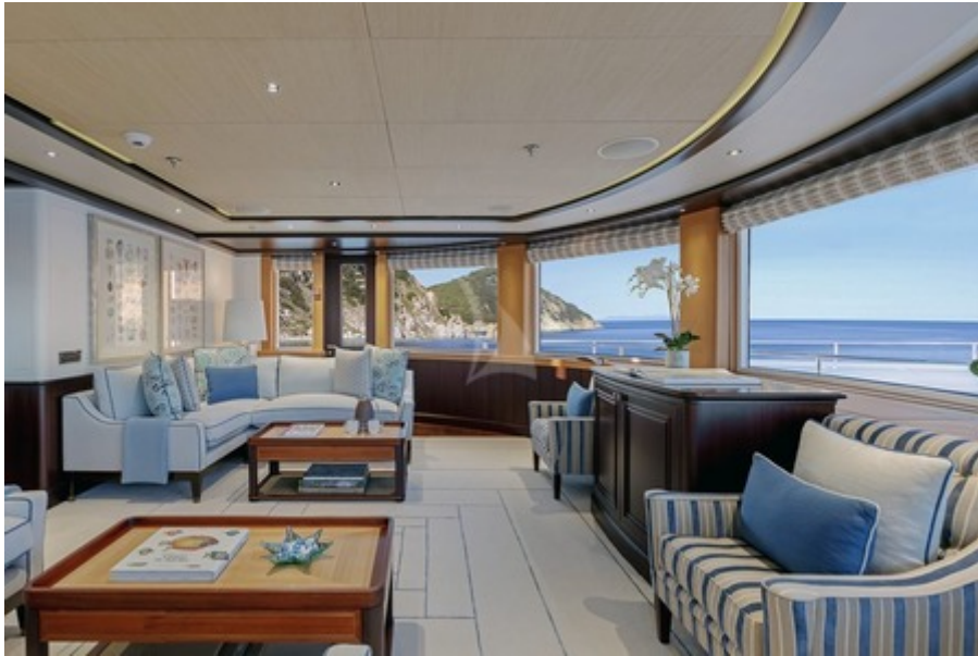
Upper deck - Observation lounge