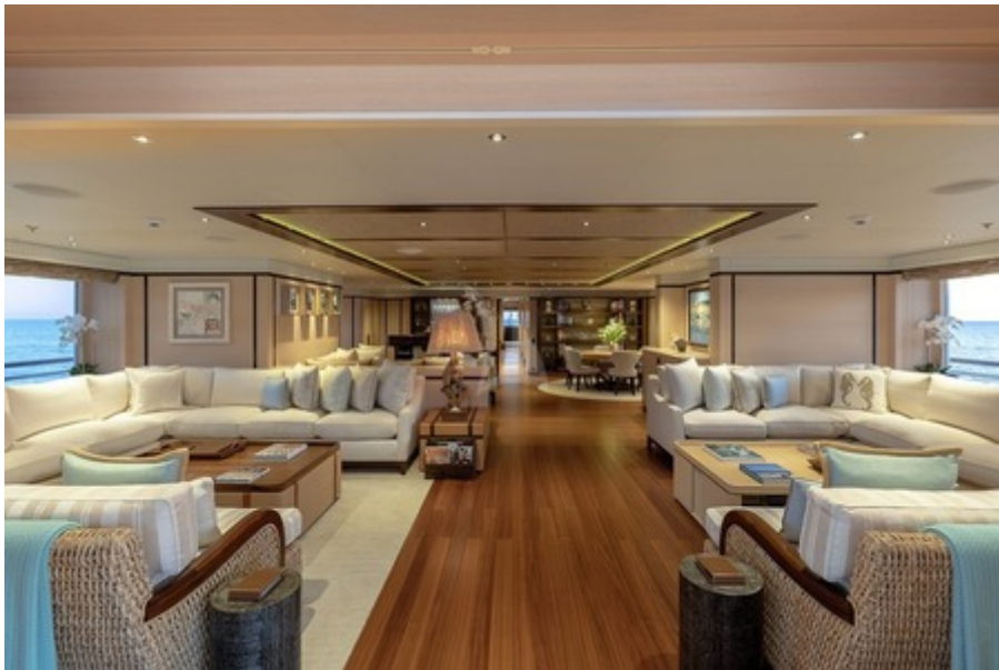
Upper deck - Saloon