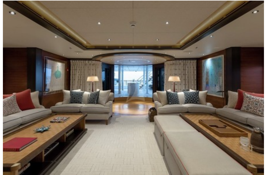
Main deck - Saloon