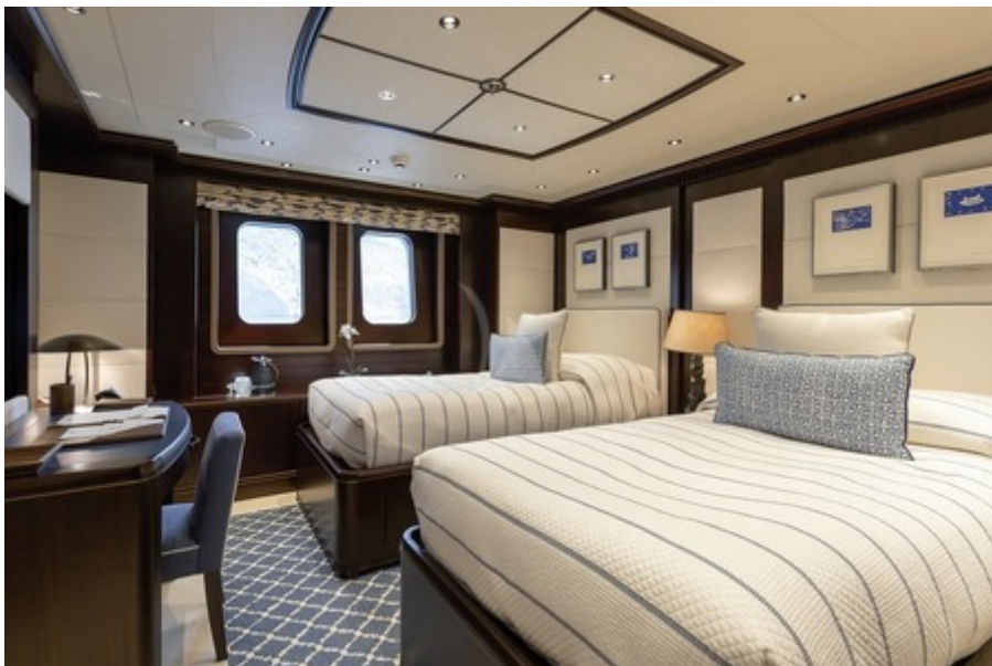
Lower deck - 2 x twin cabins convertible into double