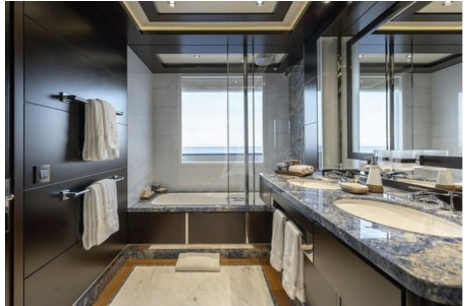
Upper deck - VIP suite bathroom