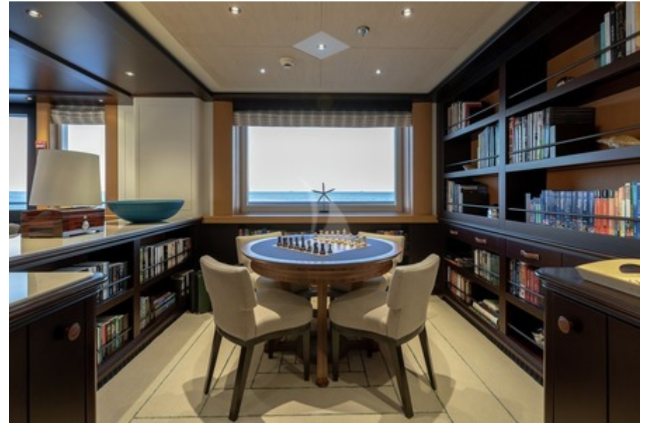
Upper deck - Observation lounge