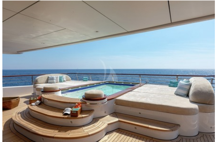
Bridge deck - Pool with jet stream