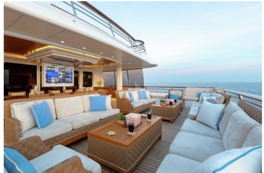
Upper deck - Outdoor cinema