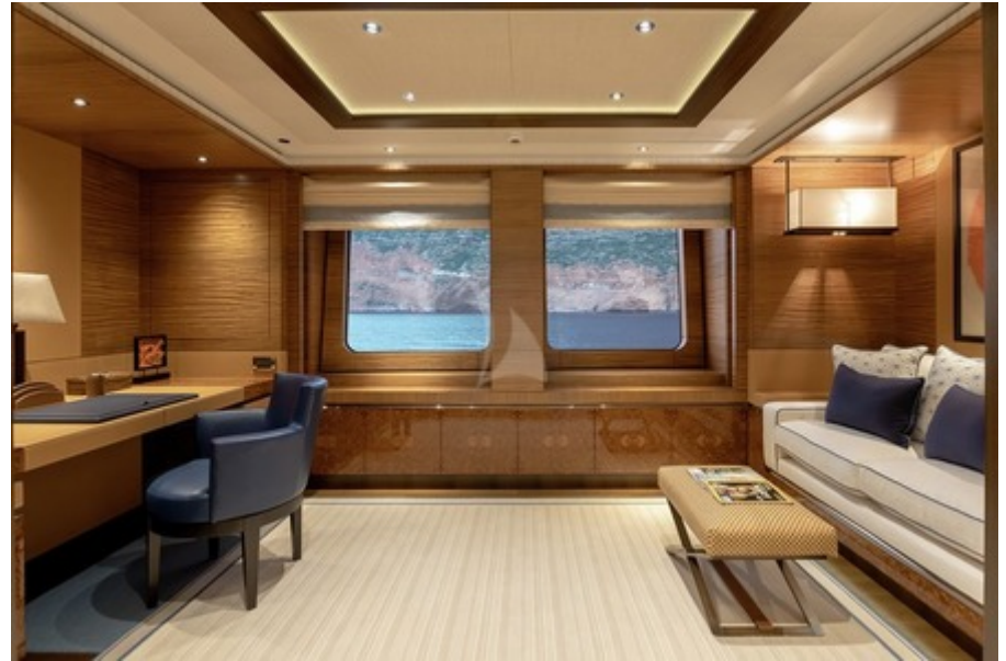
Main deck - Master private office