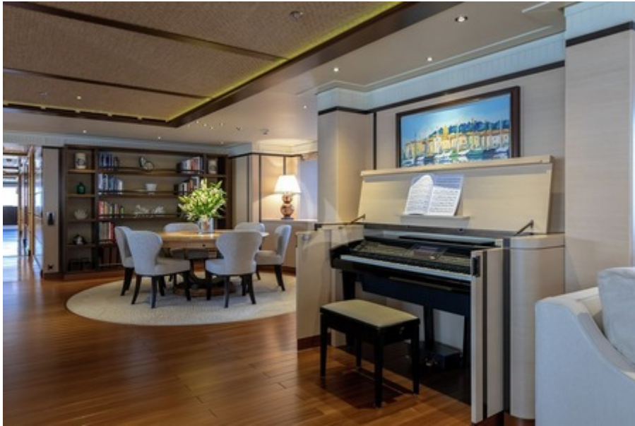
Upper deck - Saloon