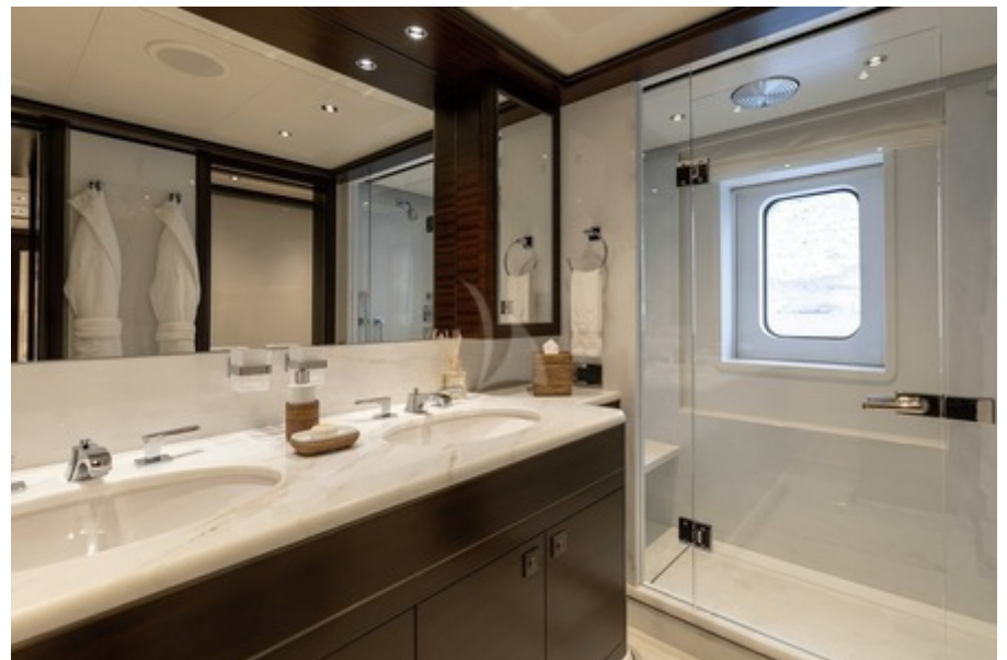
Guest cabins en suite