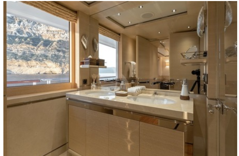
Upper deck - VIP suite bathroom