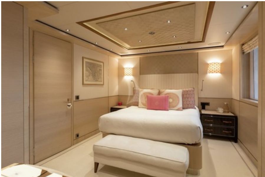
Upper deck - VIP suite 2