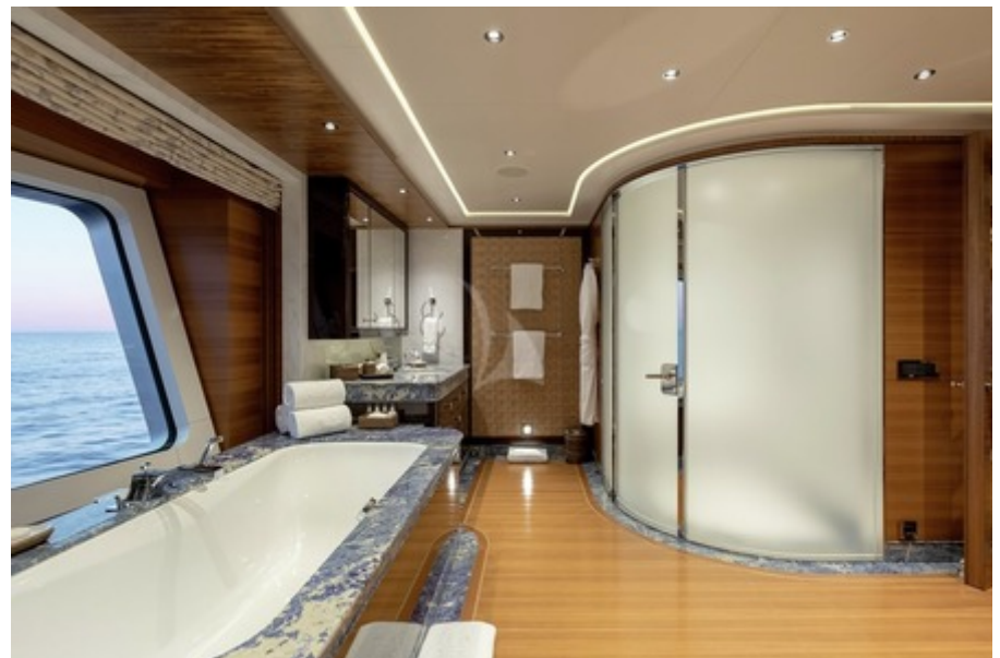
Master en suite