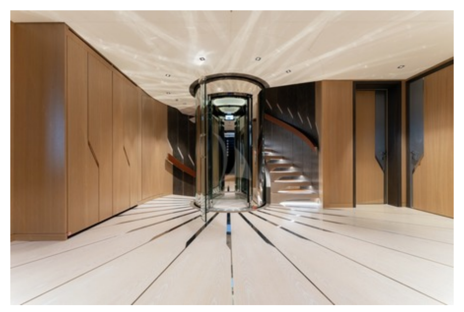
Main deck foyer