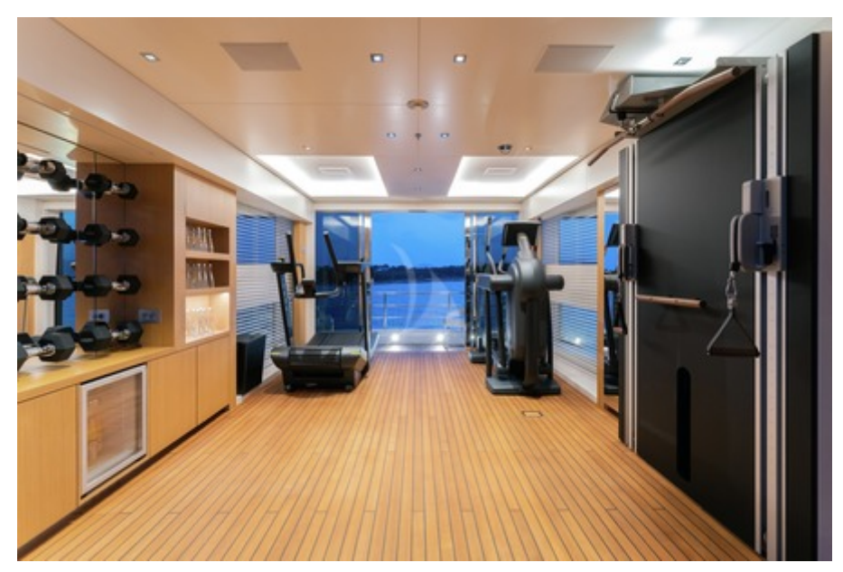
Fly deck gym and yoga studio