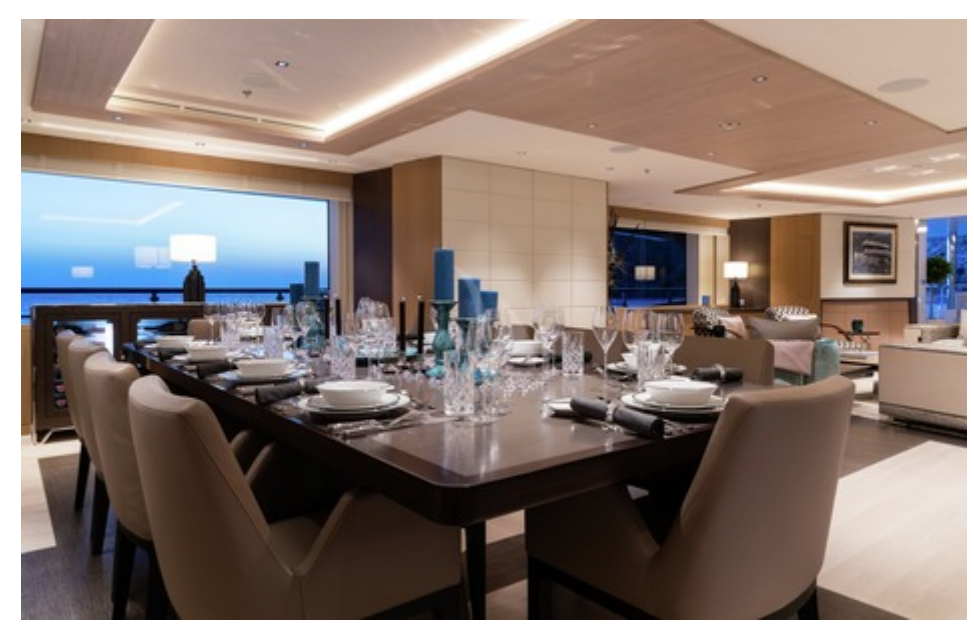
Main deck dining