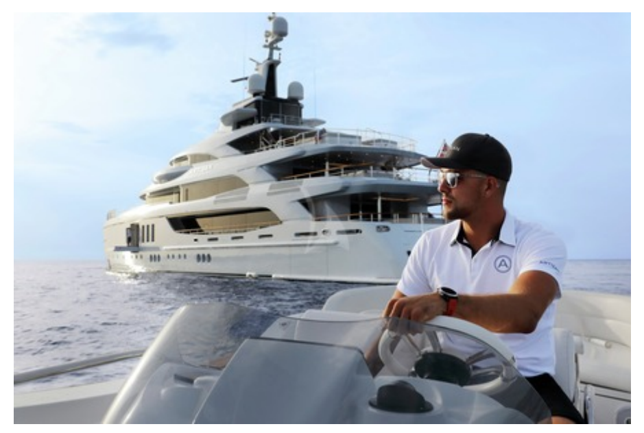
ARTISAN at sea