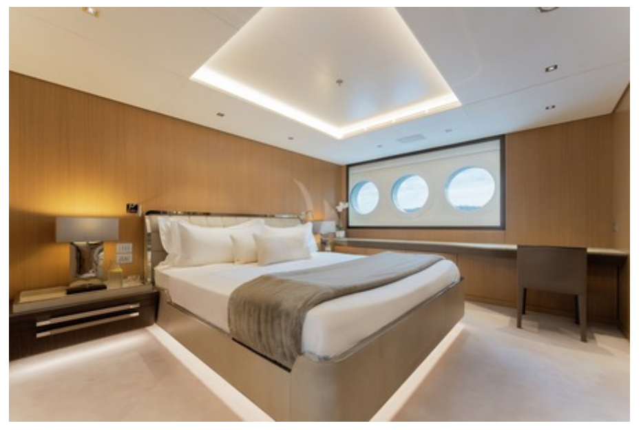
Double guest cabin