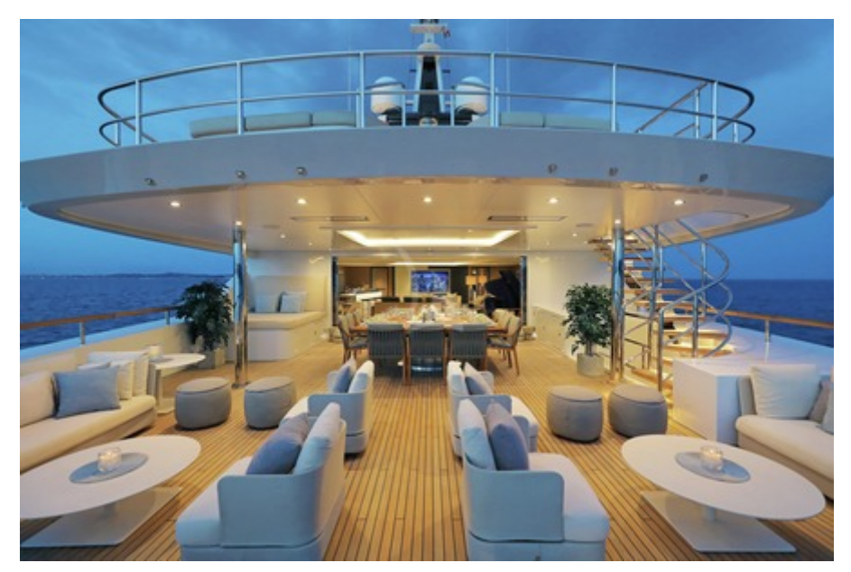
Upper deck aft