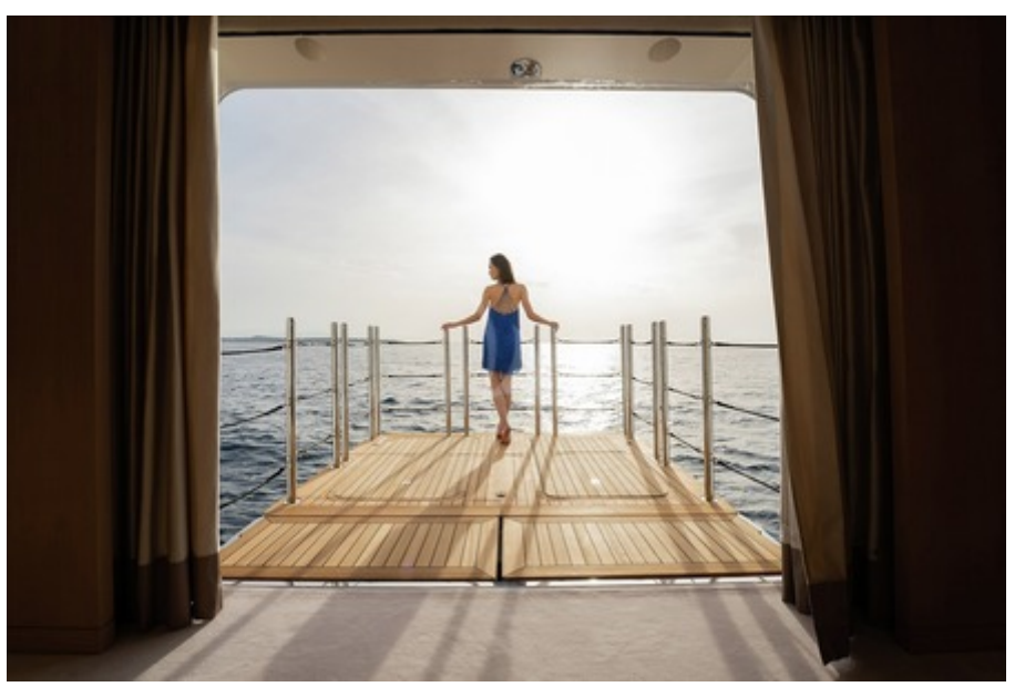
Adjoining seventh cabin fold out balcony