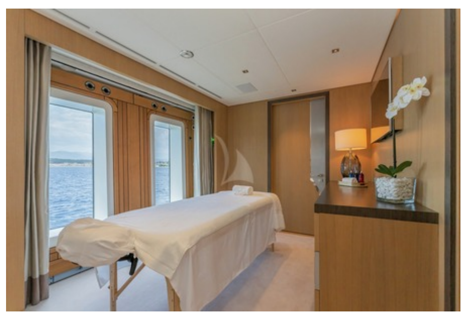
Adjoining seventh cabin with fold out balcony/massage room