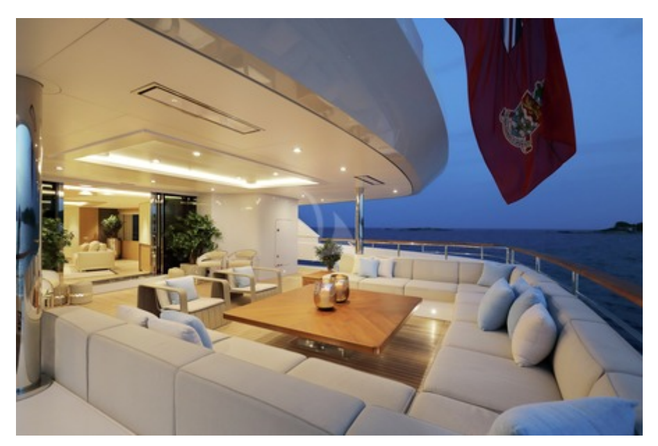
Main deck aft seating area