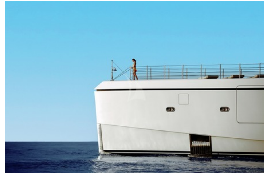
ARTISAN at sea