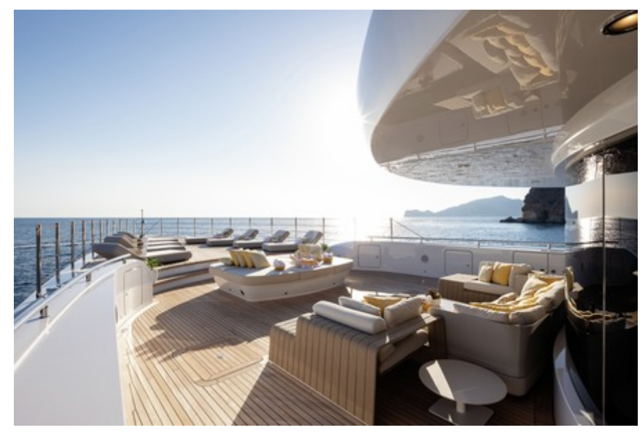
Upper deck forward seating area