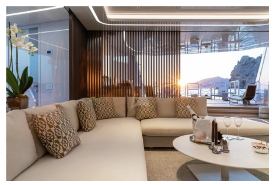
Beach club at sunset