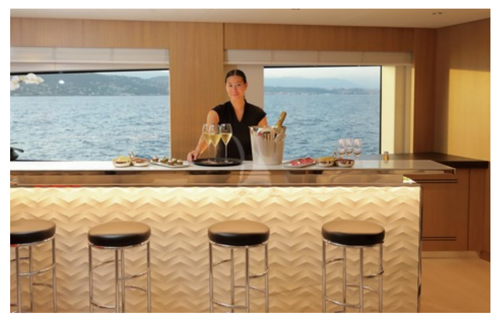
Sky lounge bar