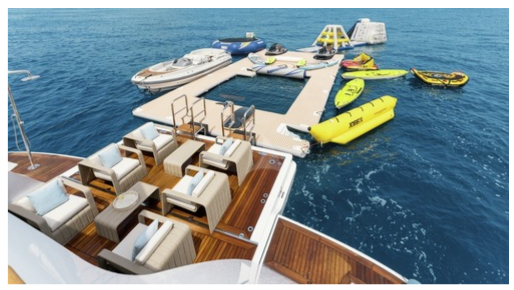
Sea pool and toys