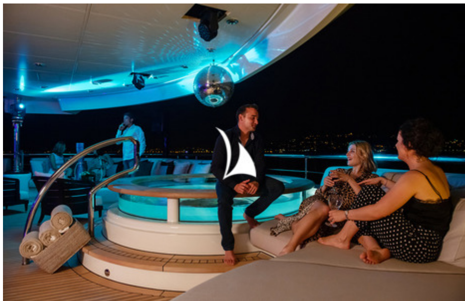
SUNRAYS party mode