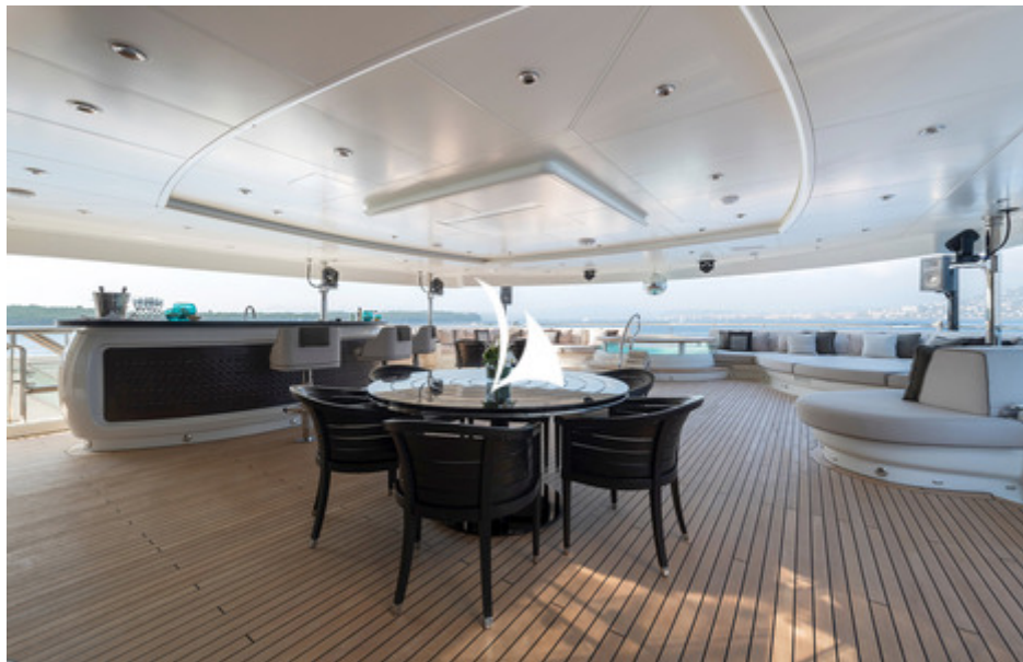
SUNRAYS bridge deck aft