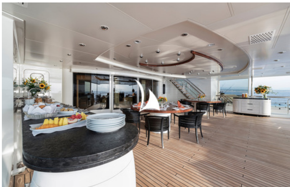
SUNRAYS Owners deck convertible dining tables