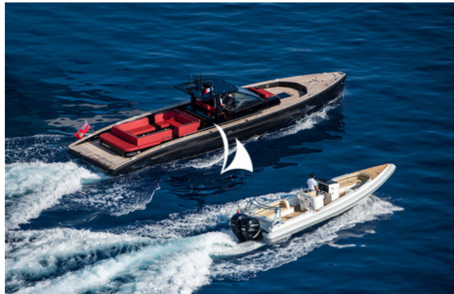
SUNRAYS Windy 52 and Wahoo LX RIB