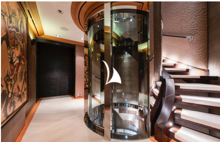
SUNRAYS elevator serving 4 decks