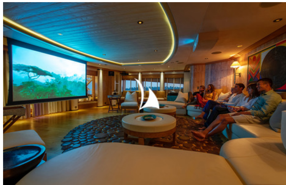
SUNRAYS bridge deck spa lounge cinema mode