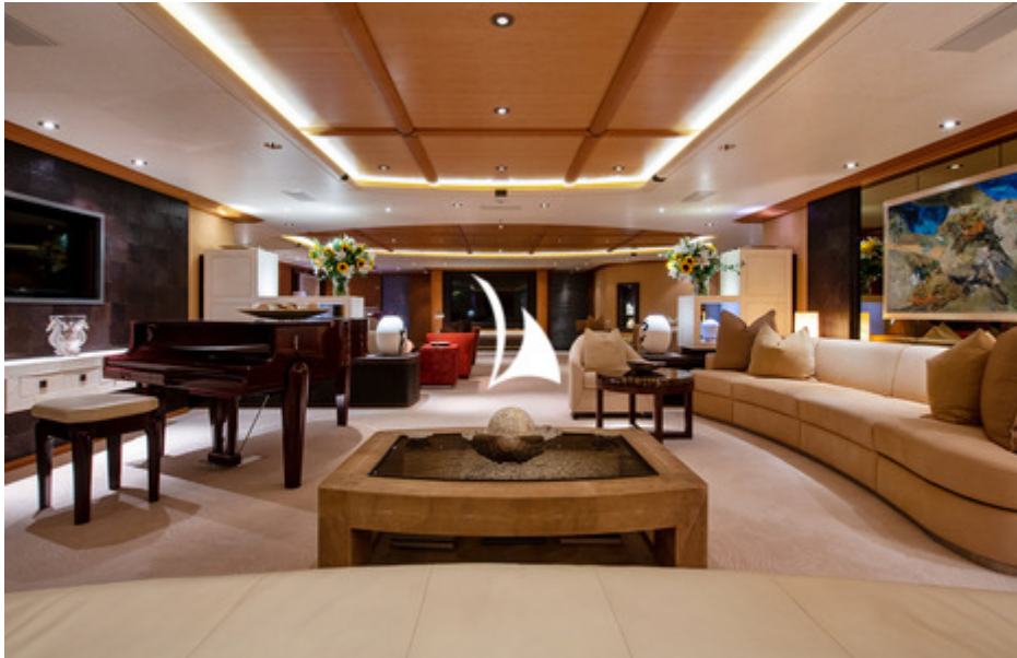
SUNRAYS Owners deck salon