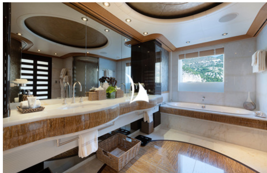
SUNRAYS mast cabin bathroom