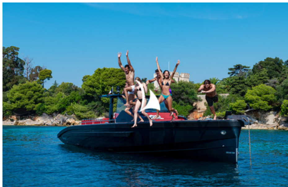
SUNRAYS Windy 52 Blackbird chase boat