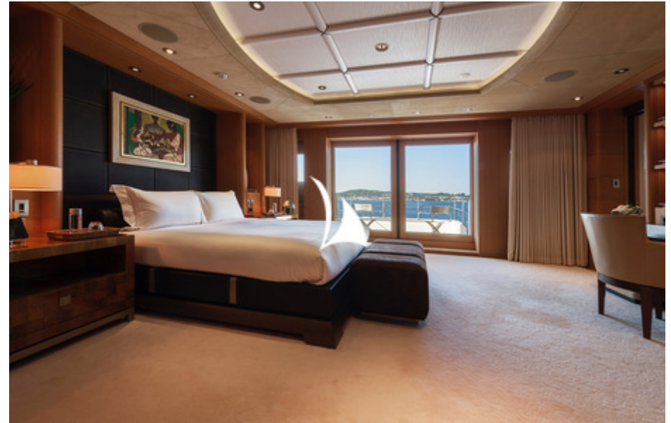
SUNRAYS Owners deck VIP