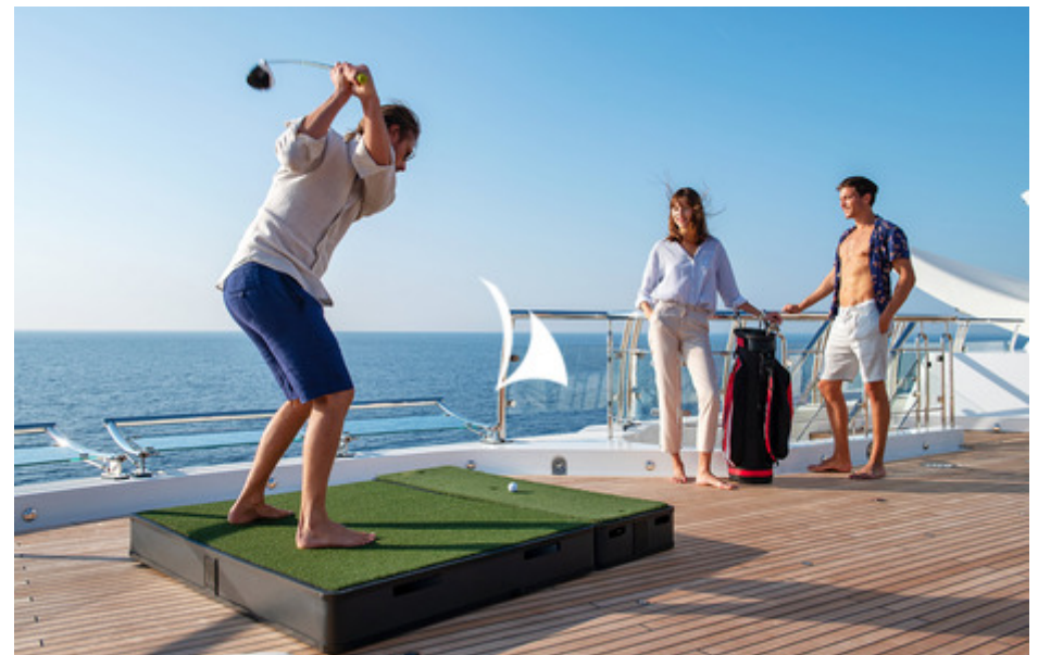
SUNRAYS sun deck heli deck