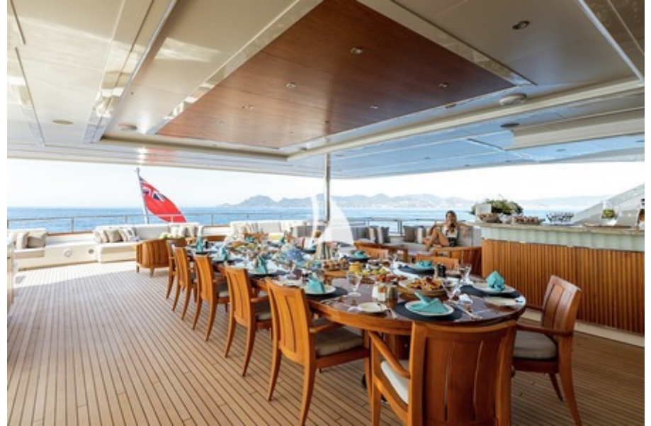
Upper deck dining