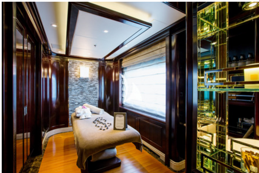
Fully equipped massage room with two massage tables