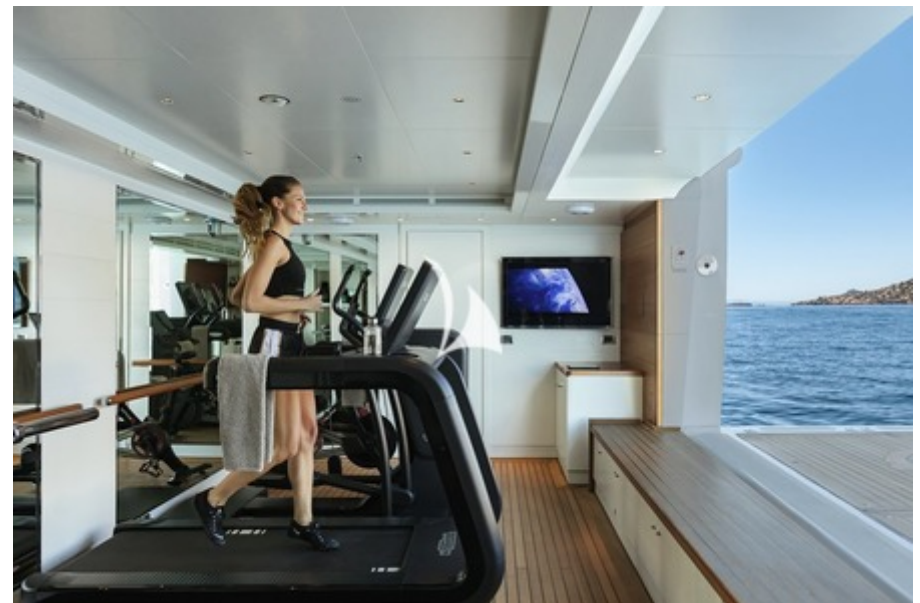
Fully equipped gym at sea level with personal trainer