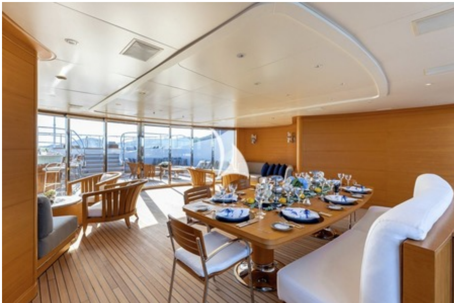
Sun deck veranda for dining and lounging