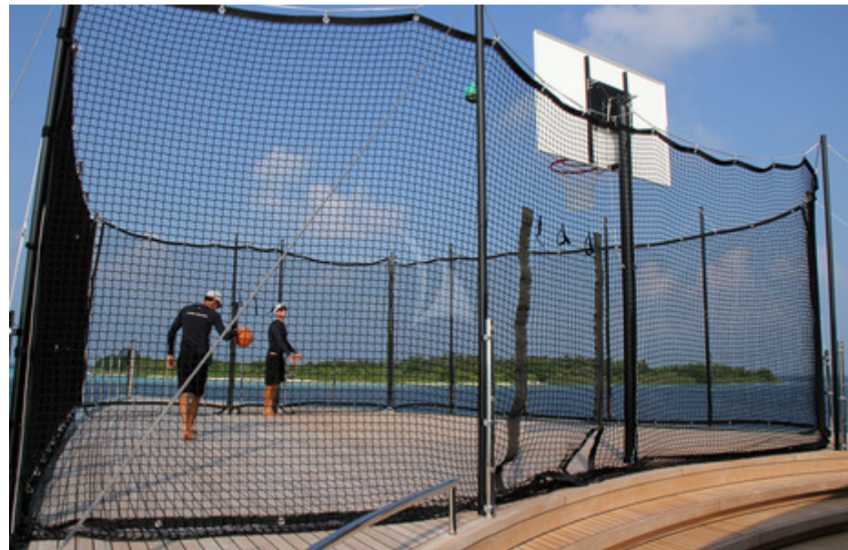
BASKETBALL COURT ON BOW