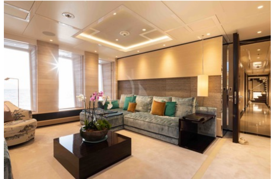
Main Deck Master Lounge Area