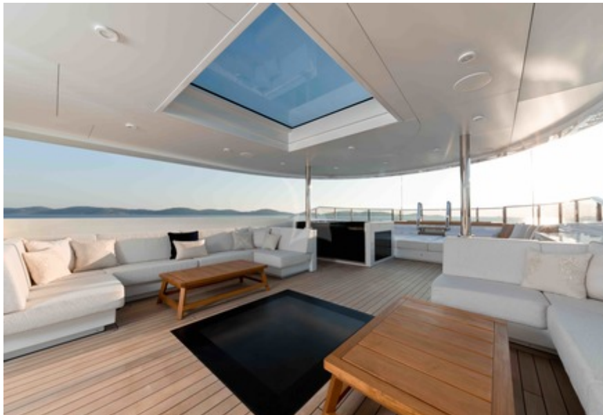
Sun Deck - View Fwd