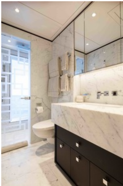
Main Deck Guest Cabin En Suite