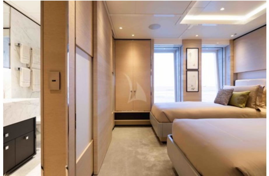
Main Deck Guest Cabin - convt to double