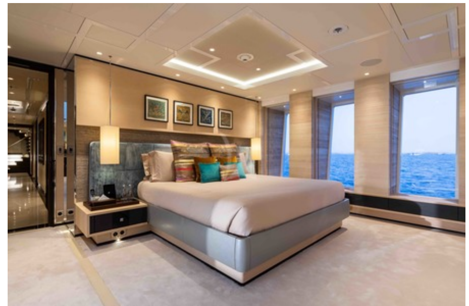
Main Deck Master Suite