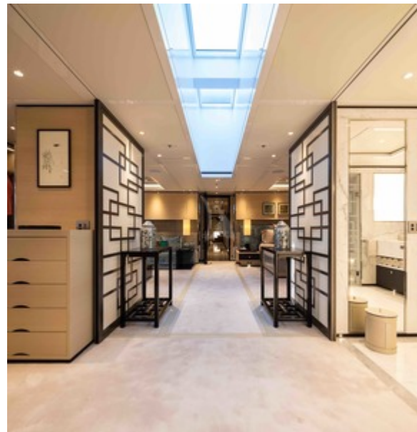
Main Deck Master Suite