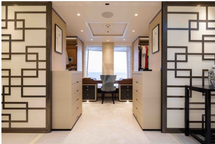
Main Deck Master Closet Entry