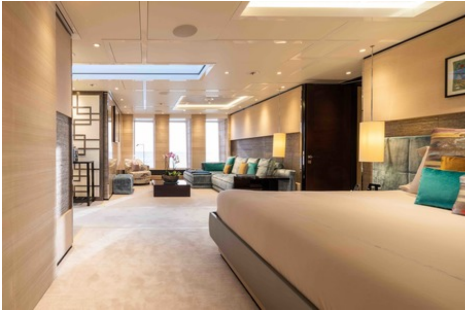
Main Deck Master Suite