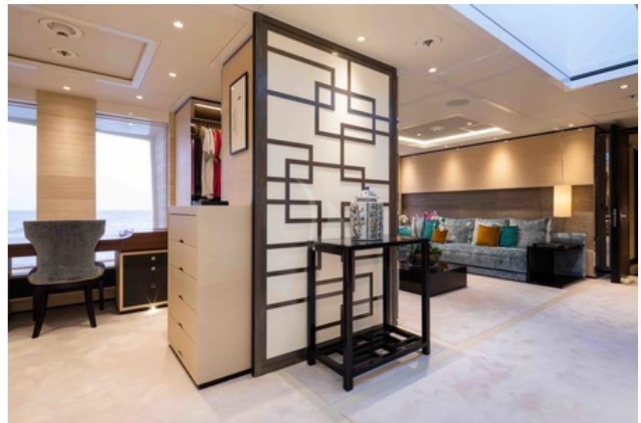
Main Deck Master Desk & Lounge Area