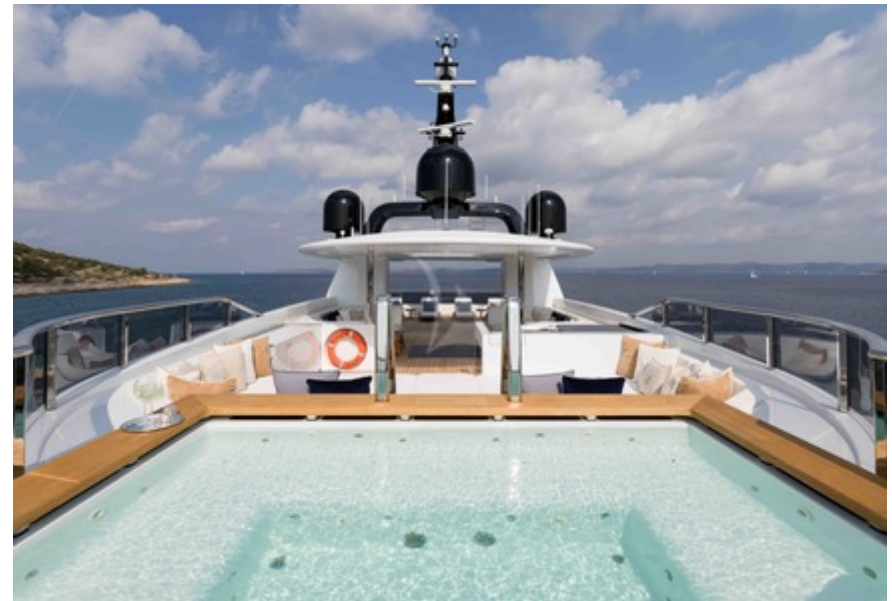
Sun Deck - View Aft