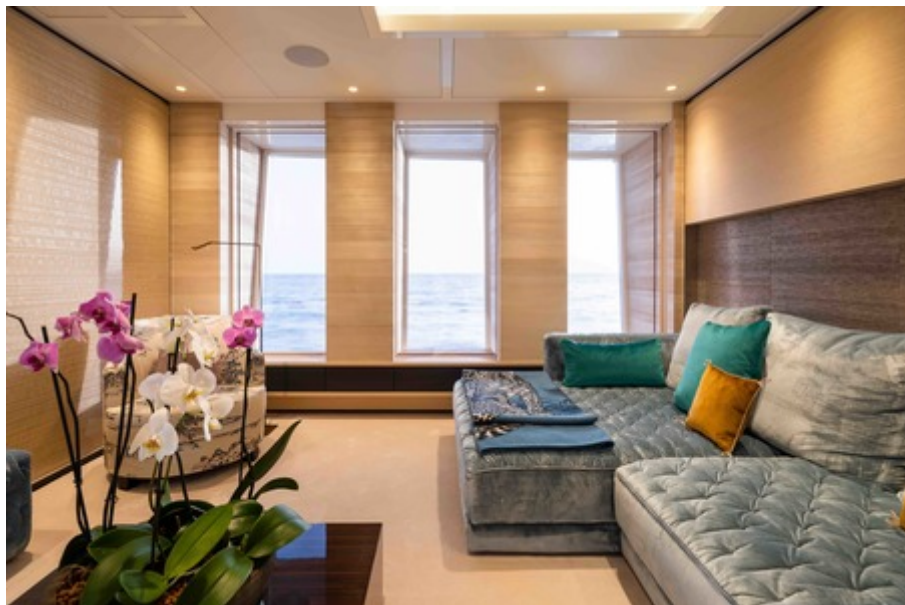
Main Deck Master Lounge Area