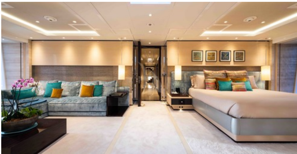
Main Deck Master Suite