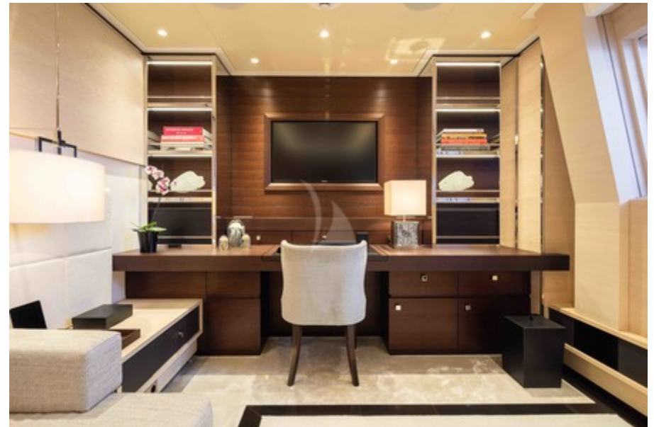
Bridge Deck Guest Cabin