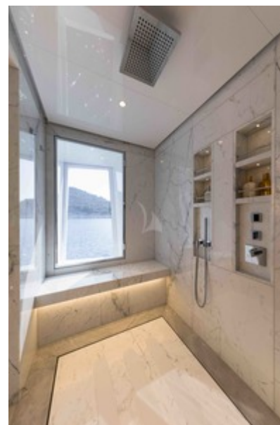
Main Deck Master Shower