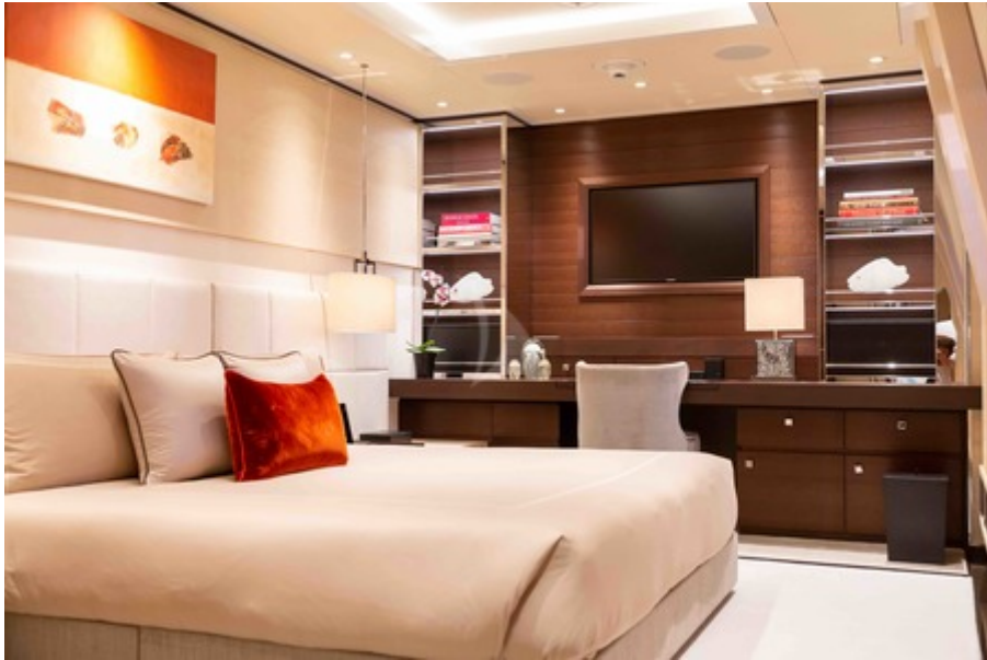
Bridge Deck Guest Cabin