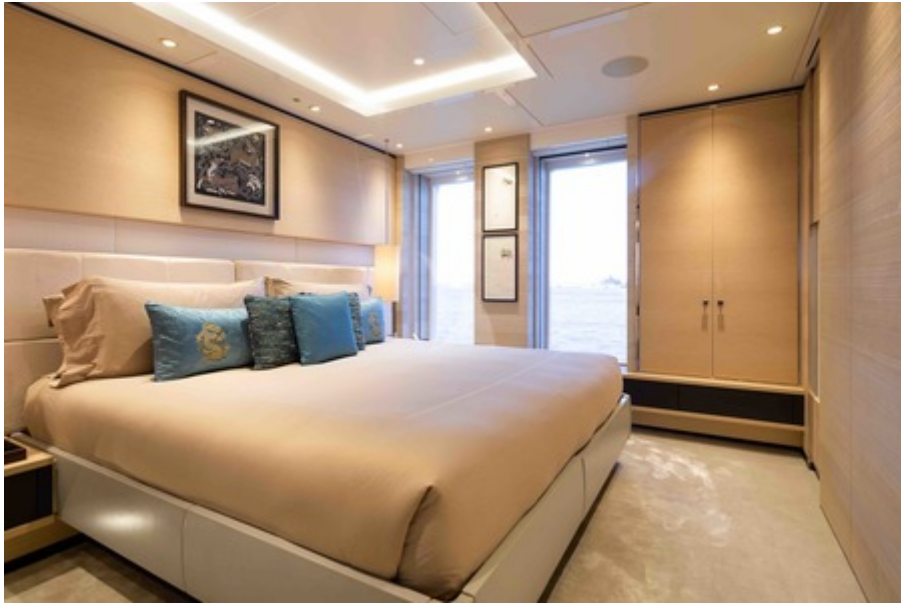
Main Deck Guest Cabin - convt to twin