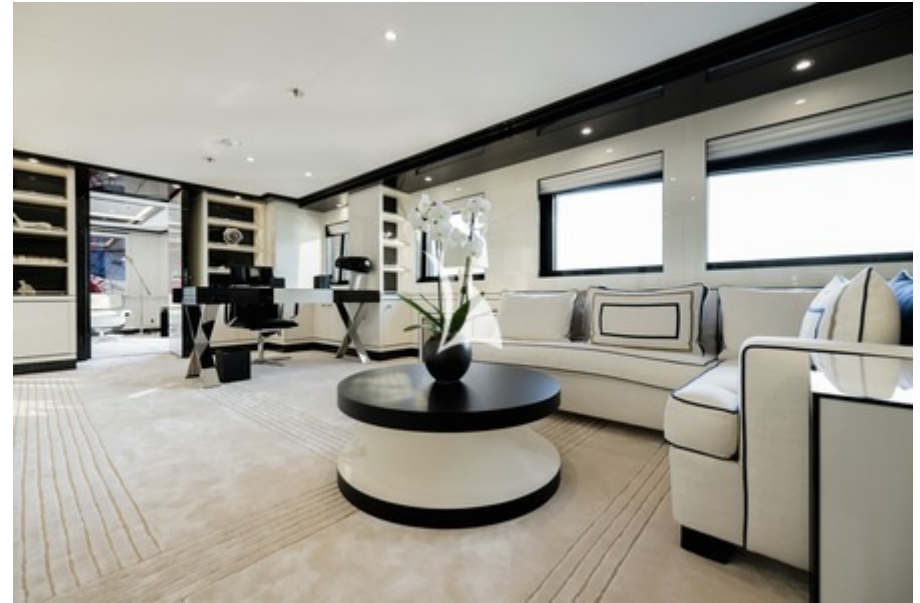
Master suite office