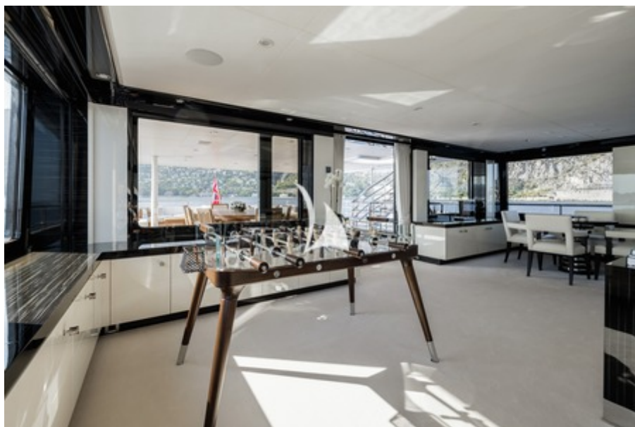
Custom-made football table