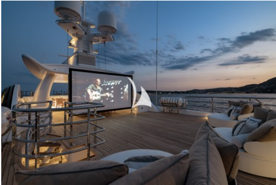
Outdoor cinema screen on sun deck