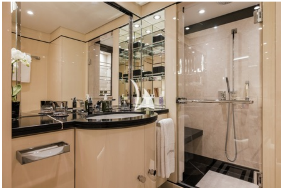
Guest shower room