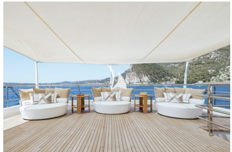
Sun deck lounging