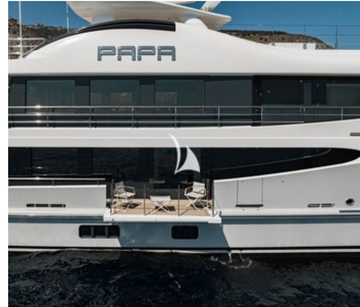
Folding balconies on main deck