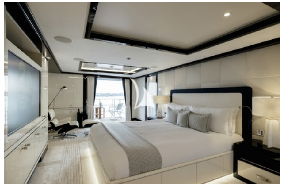
Master suite with private balcony