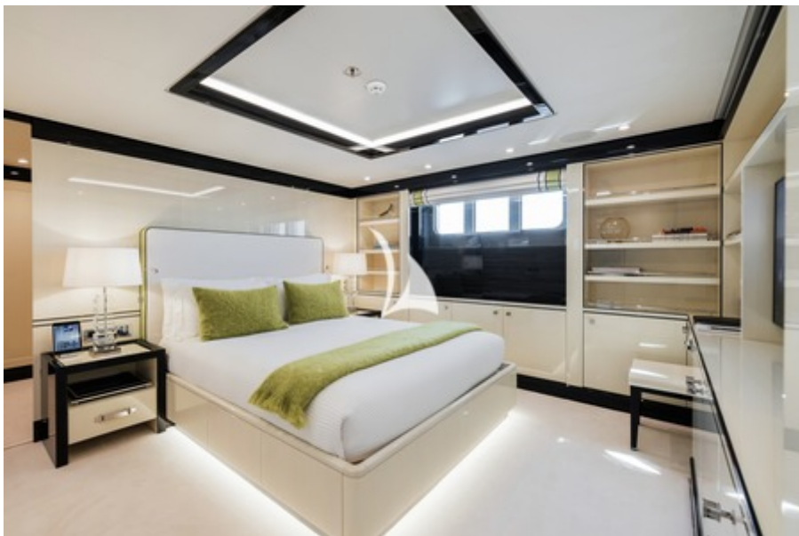
10 guests in 5 cabins