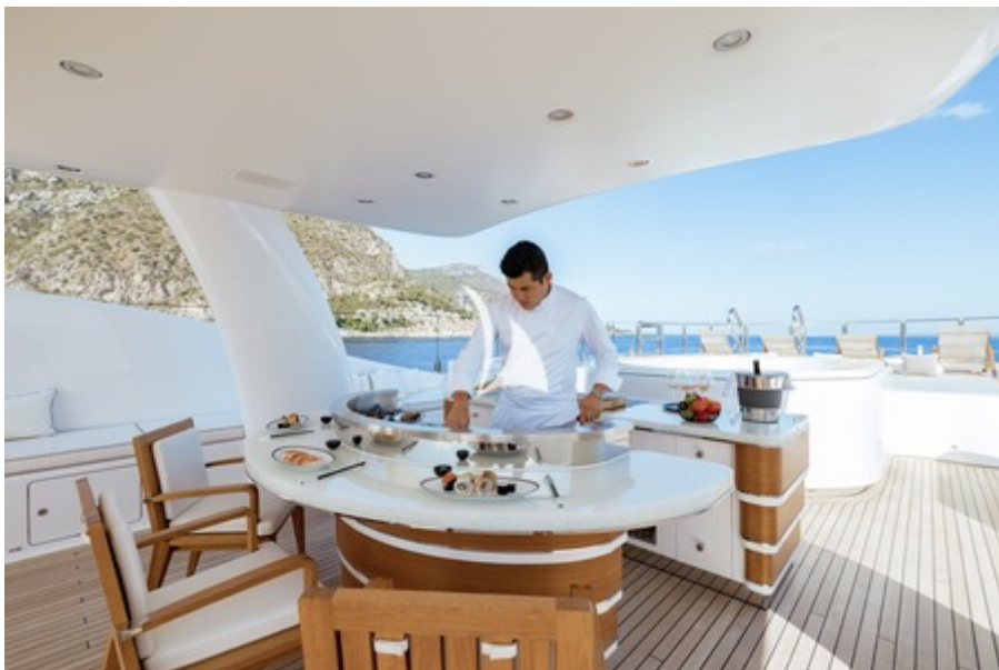
Teppanyaki bar on sun deck