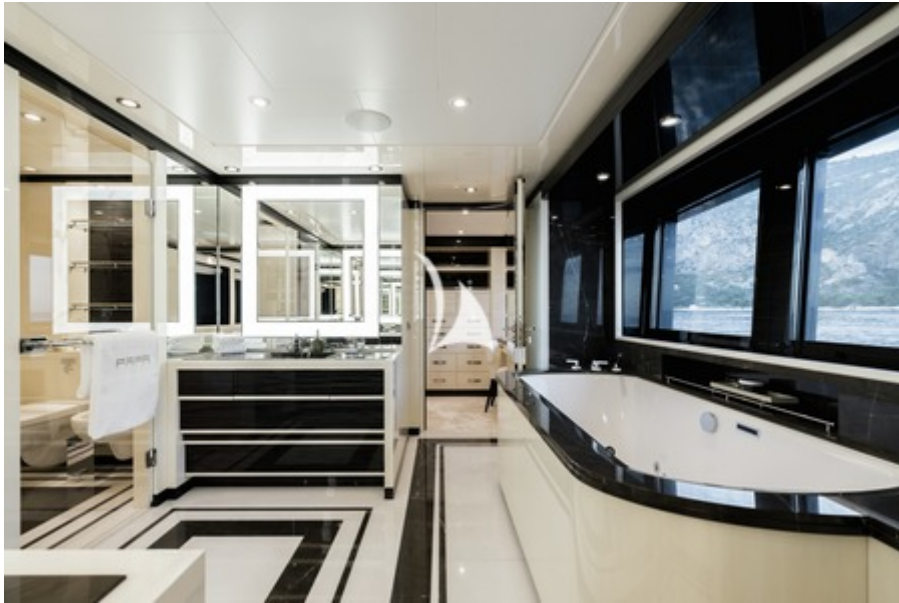
Master bathroom en suite and walk in wardrobe