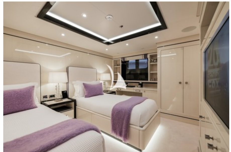
10 guests in 5 cabins