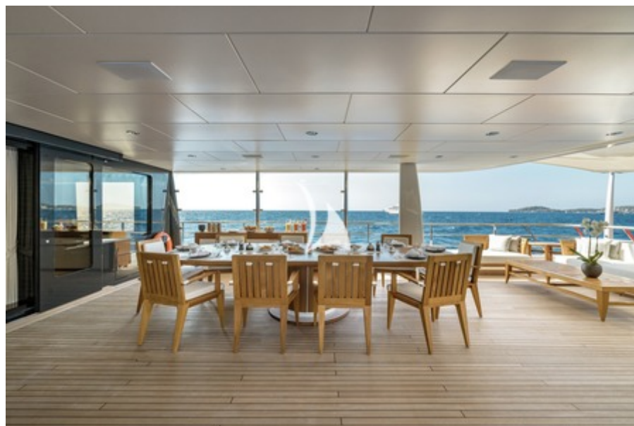
Bridge deck dining