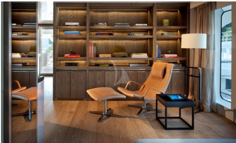
Bridge Deck - Library