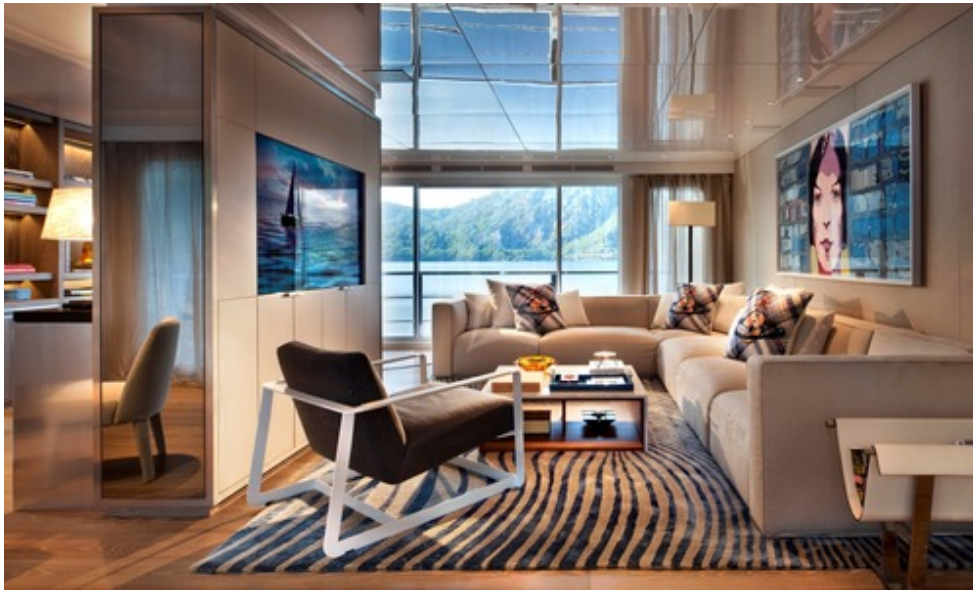
Bridge Deck - Saloon