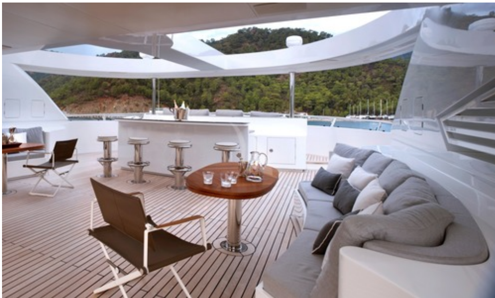
Sundeck Lounging 2