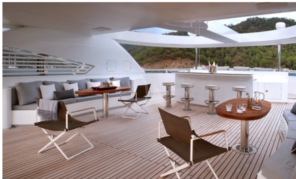
Sundeck Lounging 1