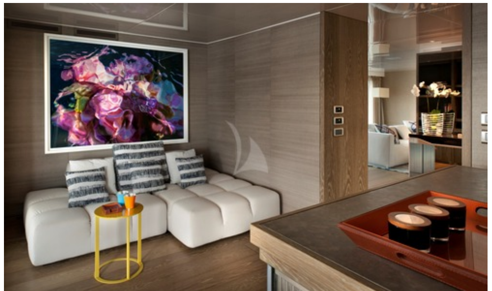
Bridge Deck - Bar Area