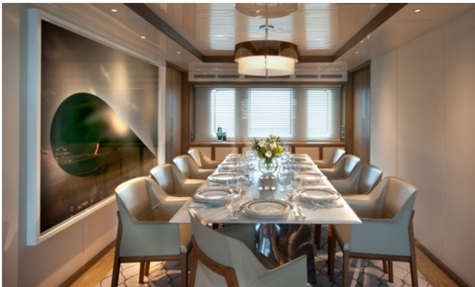
Main Deck - Dining