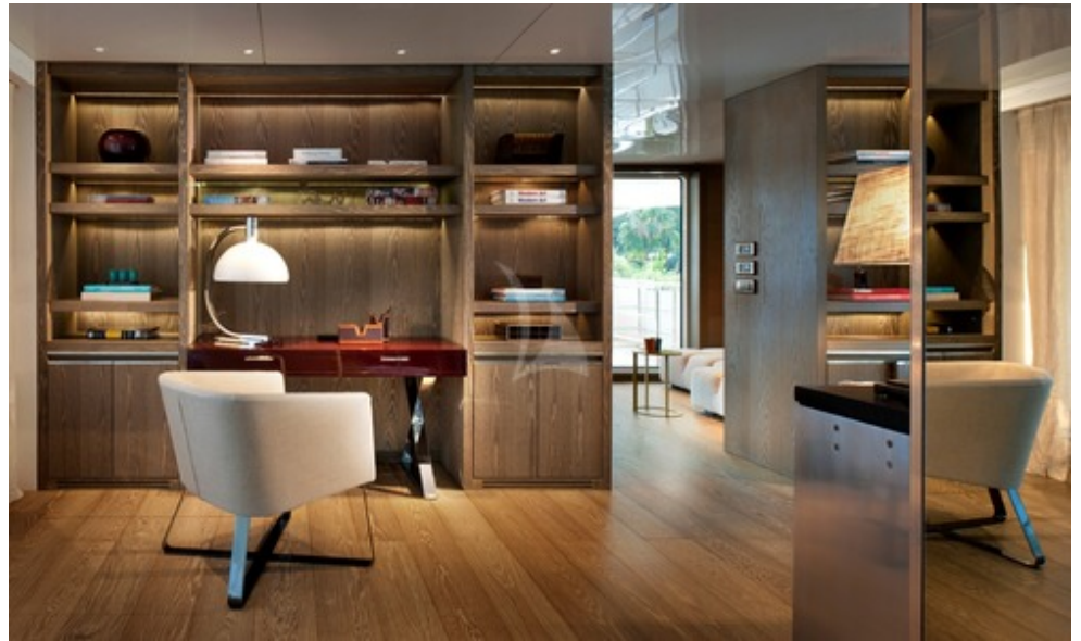
Bridge Deck - Office