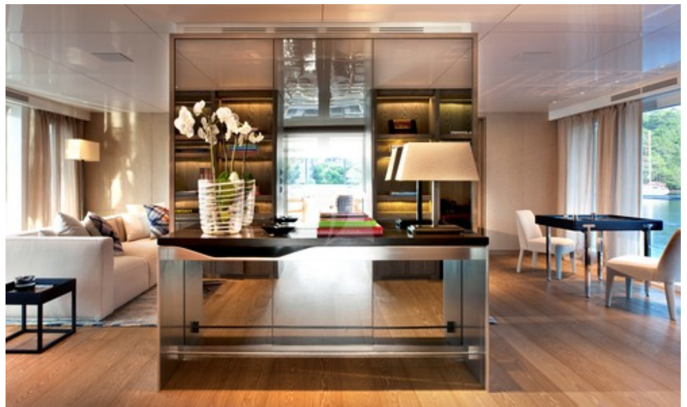
Bridge Deck - Saloon