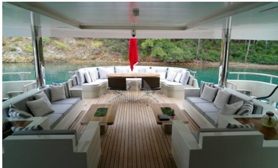
Main Deck - Aft Lounging Area