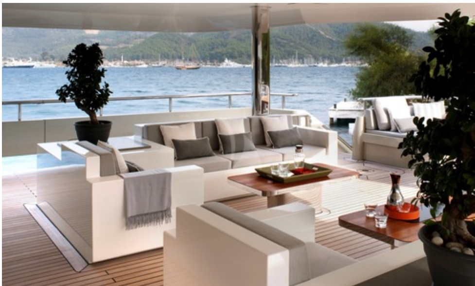
Main Deck - Aft Lounging Area