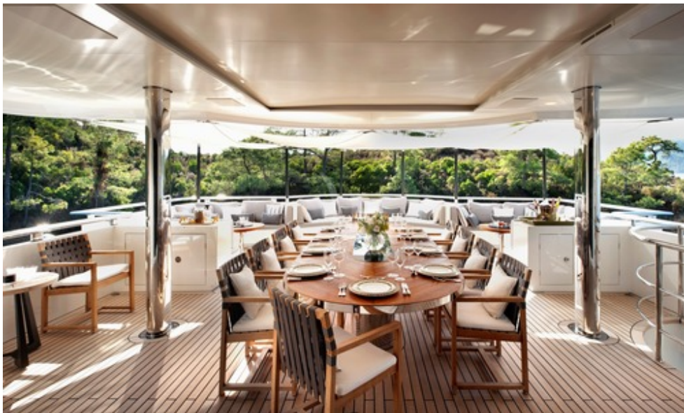
Bridge Deck - Al Fresco Dining