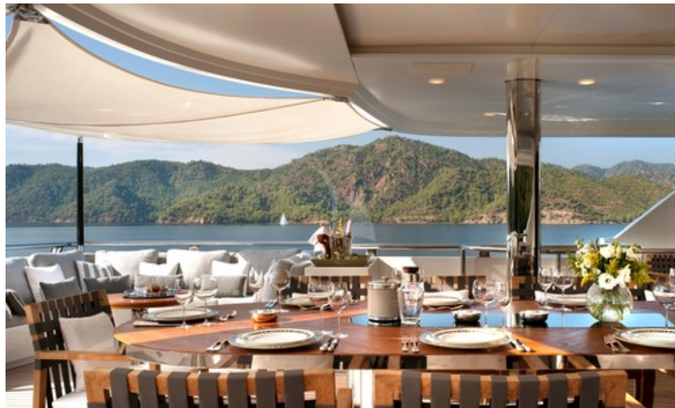
Bridge Deck - Al Fresco Dining