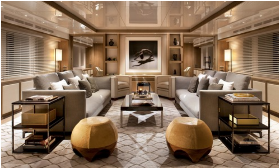
Main Deck - Saloon