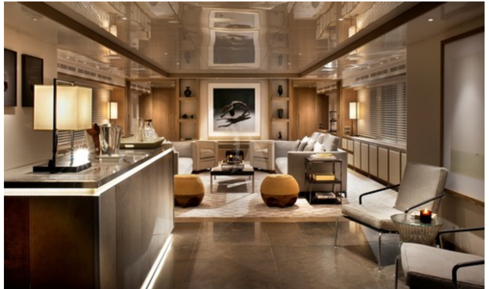
Main Deck - Saloon