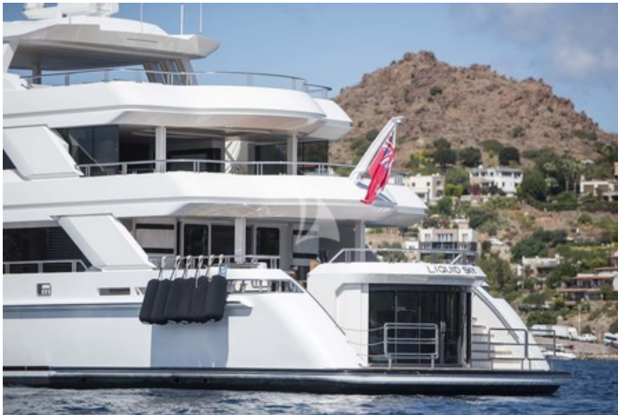
External Aft View