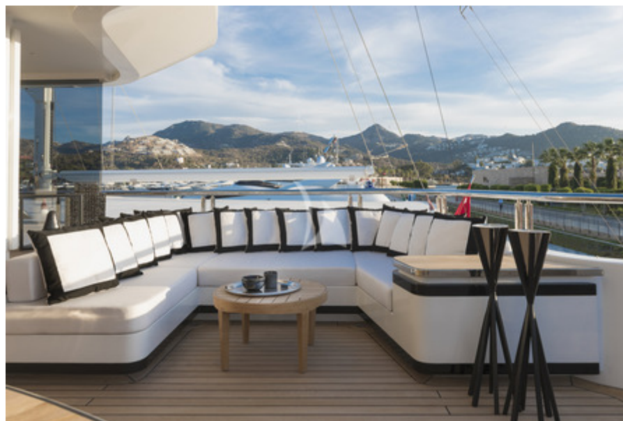
Aft Deck Soft Seating