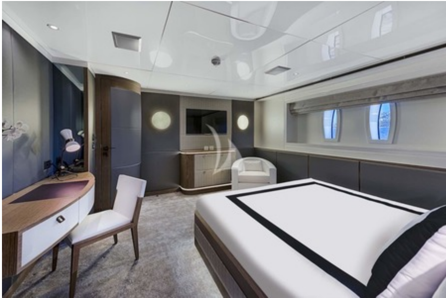
VIP Cabin 2