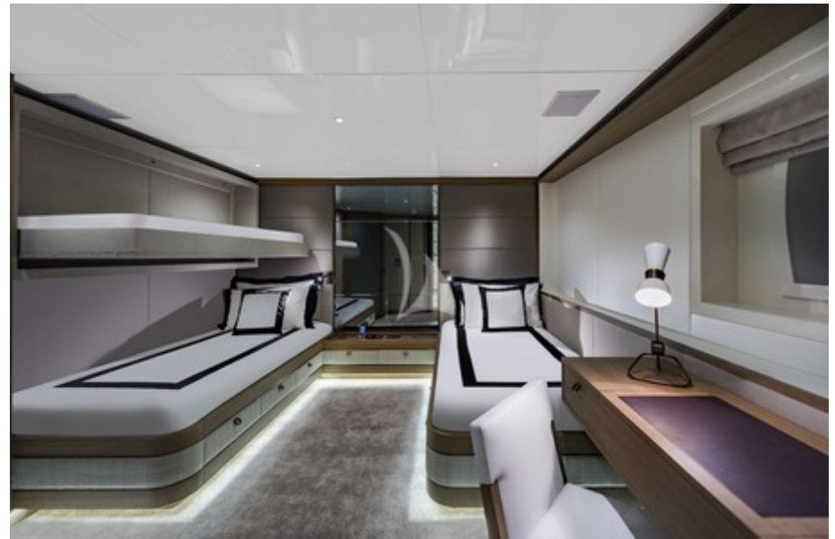
Twin Cabin 2