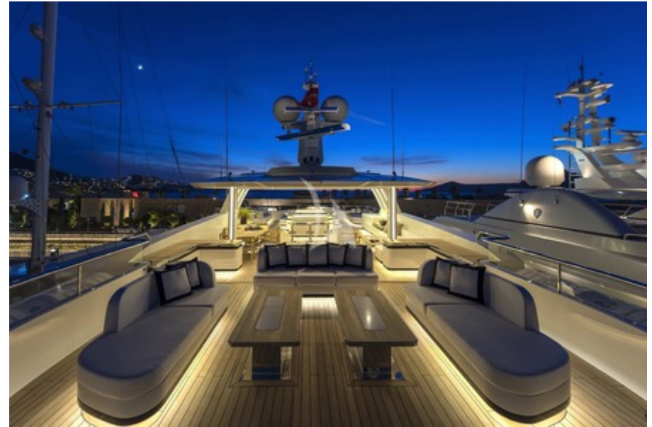
Sun Deck Lounge Night