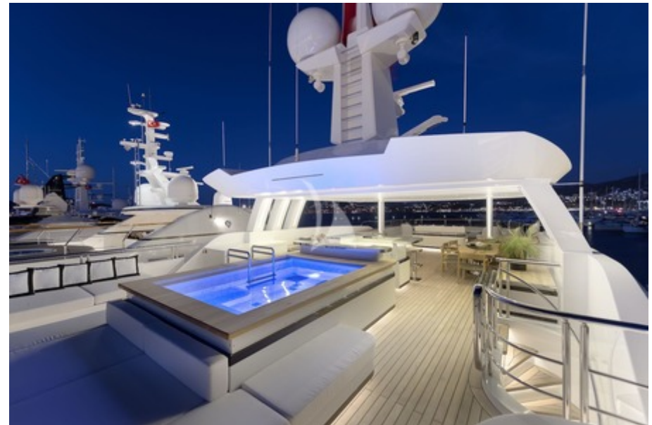
Sun Deck Pool View