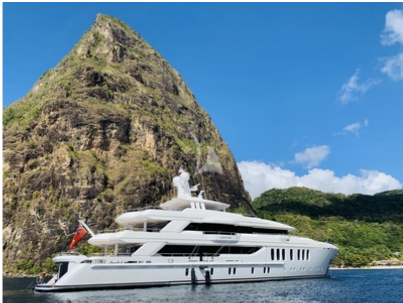
Sbd Side View