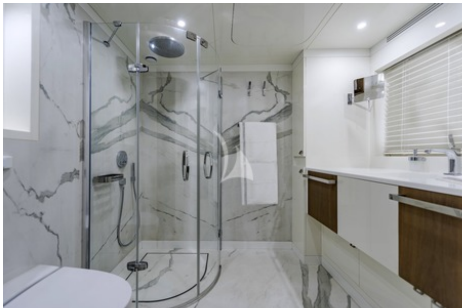
Twin Cabin Bathroom