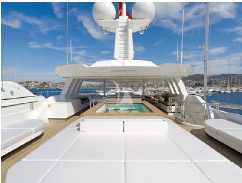
Sun Deck Loungers