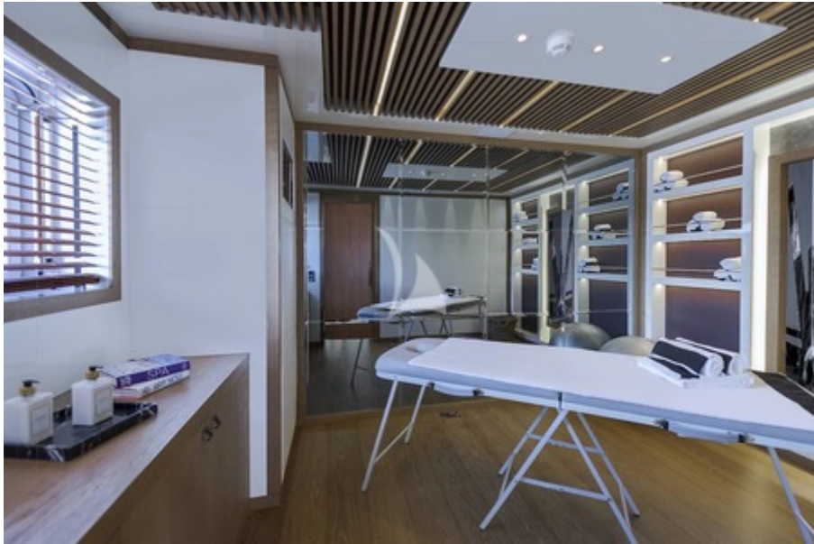
Gym - Massage Room