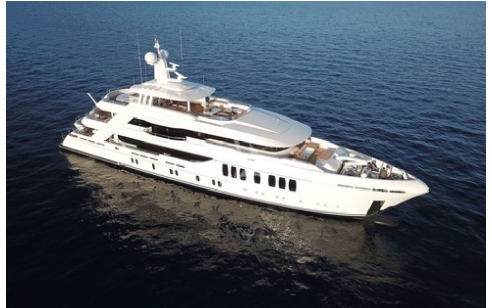
Aerial Stbd View