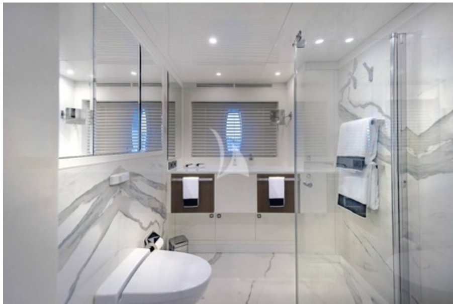
VIP Cabin Bathroom