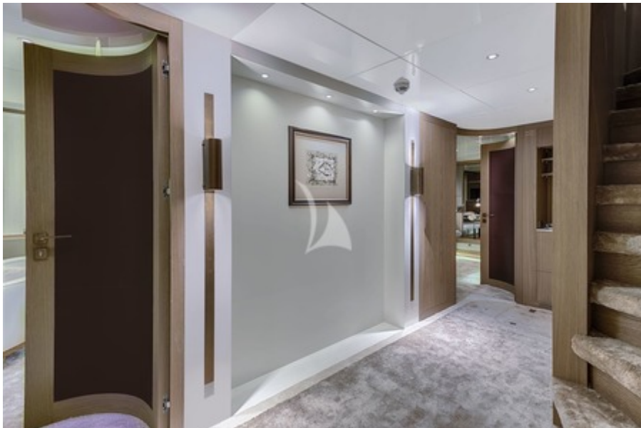
Lower Deck Cabins