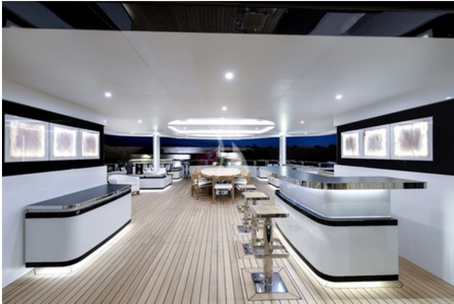
Sky Lounge Deck