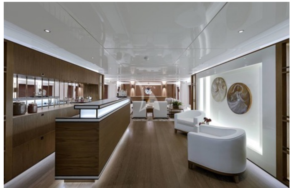
Main Salon Bar