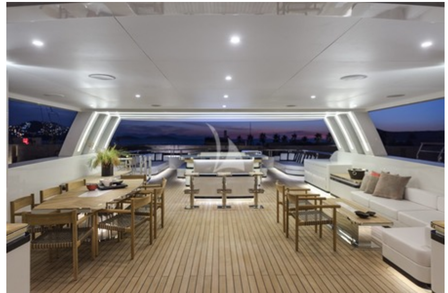
Sun Deck Seating