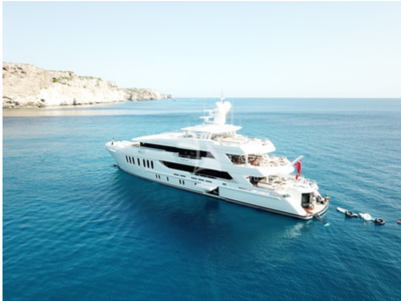
Aerial Port View