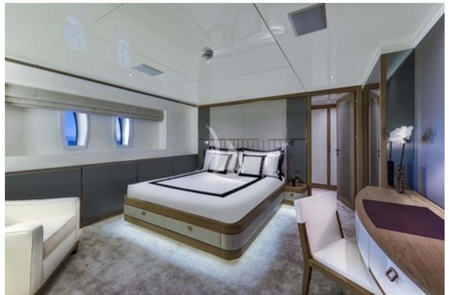
VIP Cabin 2