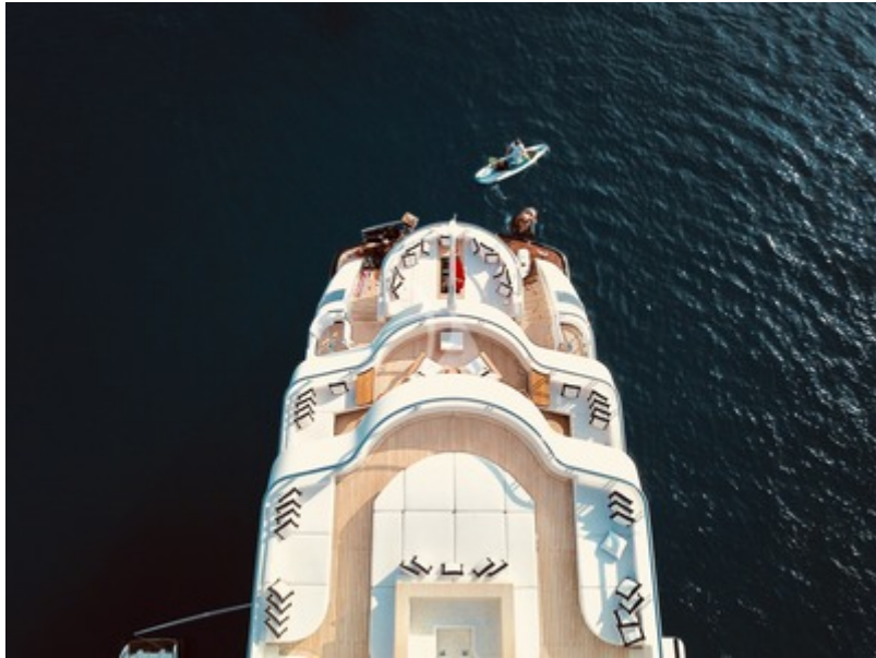
Aerial Aft Decks View