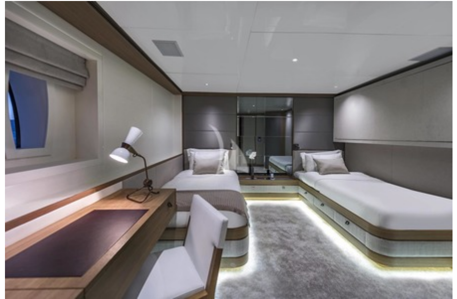
Twin Cabin 1