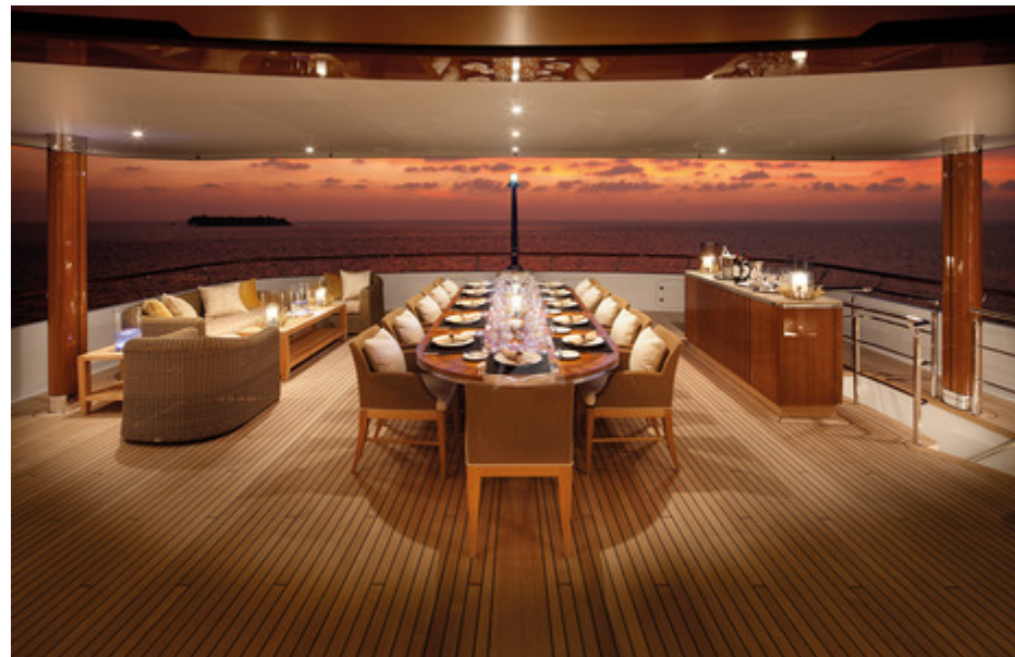
Upper Deck Dining