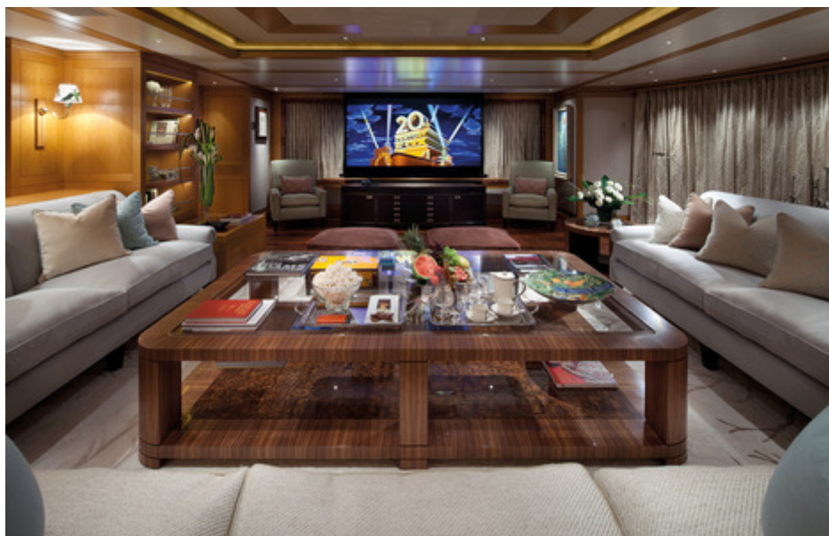
Main Deck Cinema