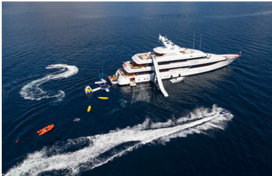
LADY BRITT Profile