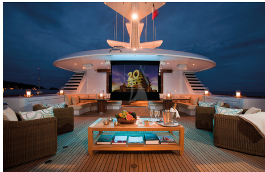
Sun Deck Cinema