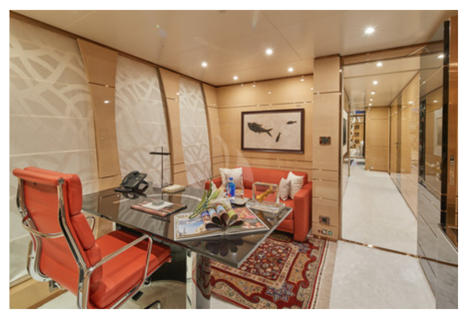
Owner cabin office