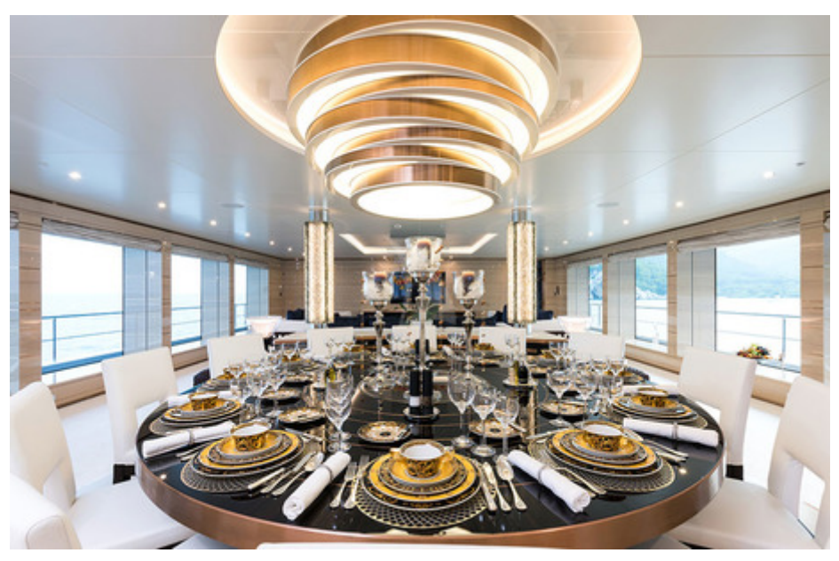
Main salon dining