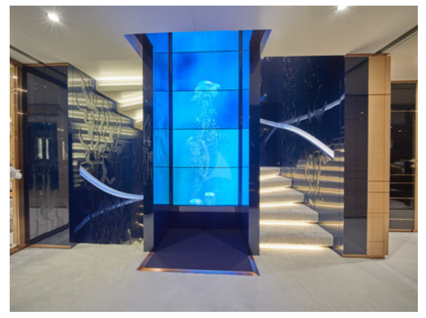
Main foyer atrium