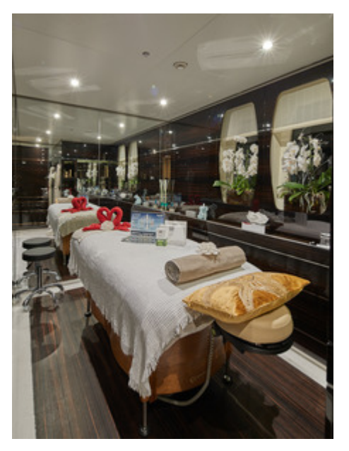
Massage spa room