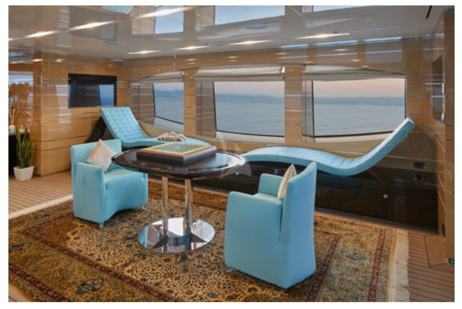
Sun deck salon Port