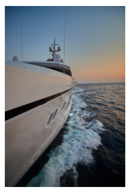
Underway from fwd