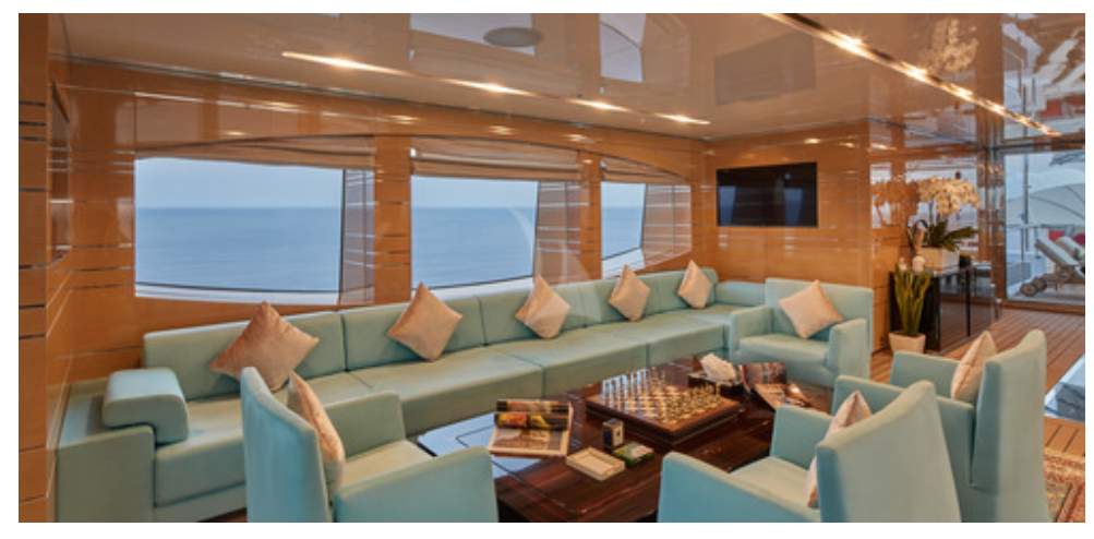
Sun deck salon Stb.