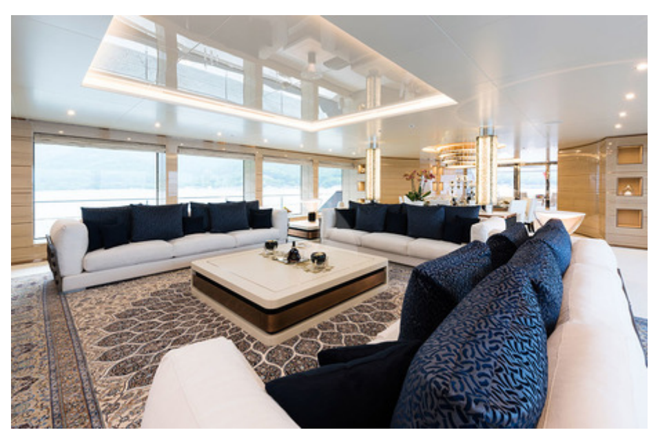
Main deck salon