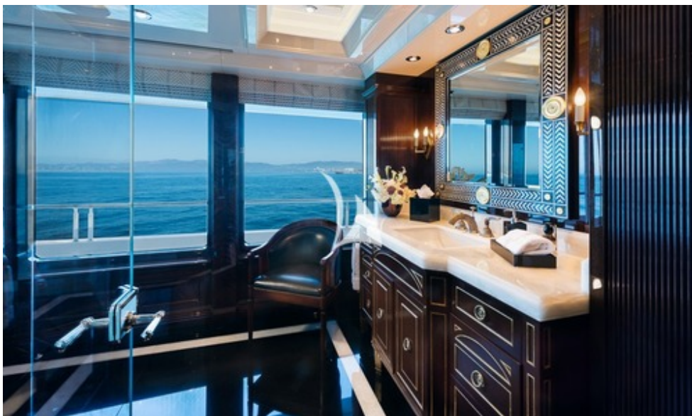
Master en suite - His