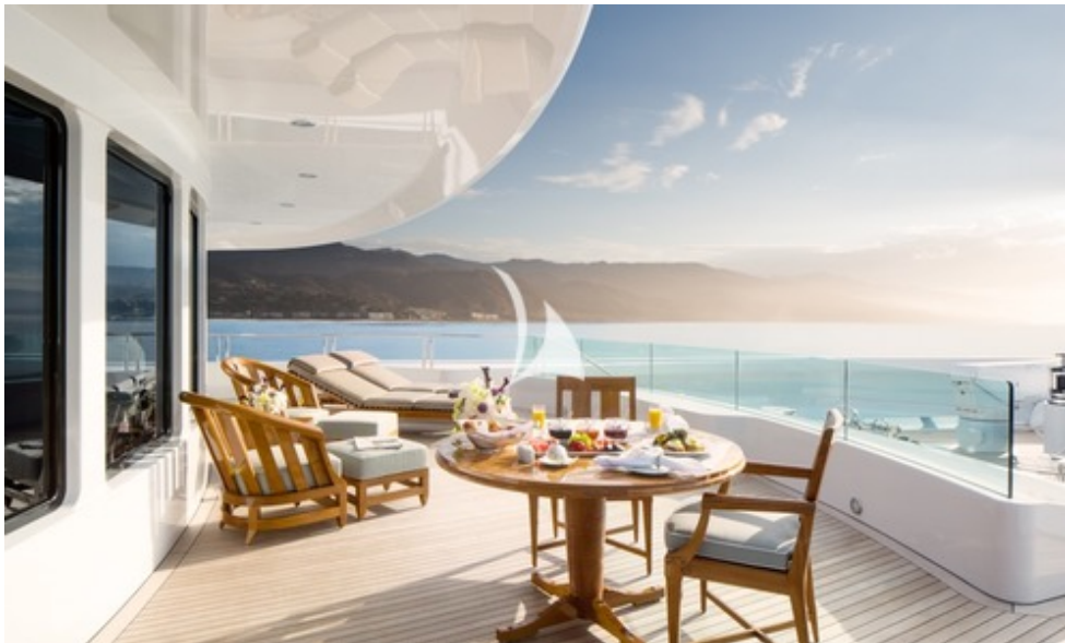
Owner's private deck