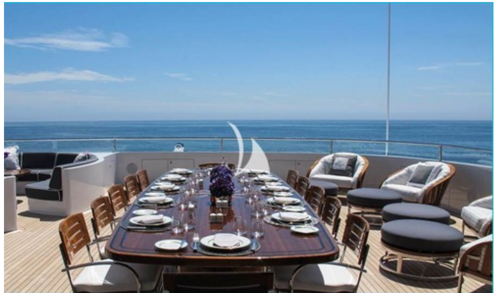
Sun deck dining