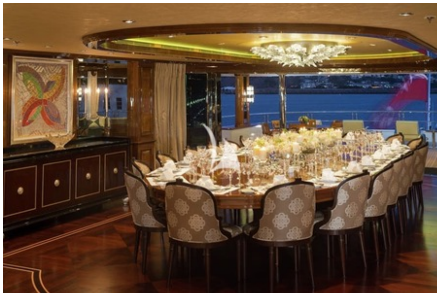
Owner's deck dining