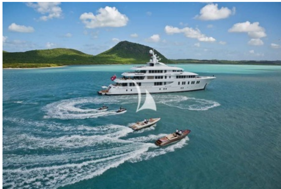
Tenders & Toys