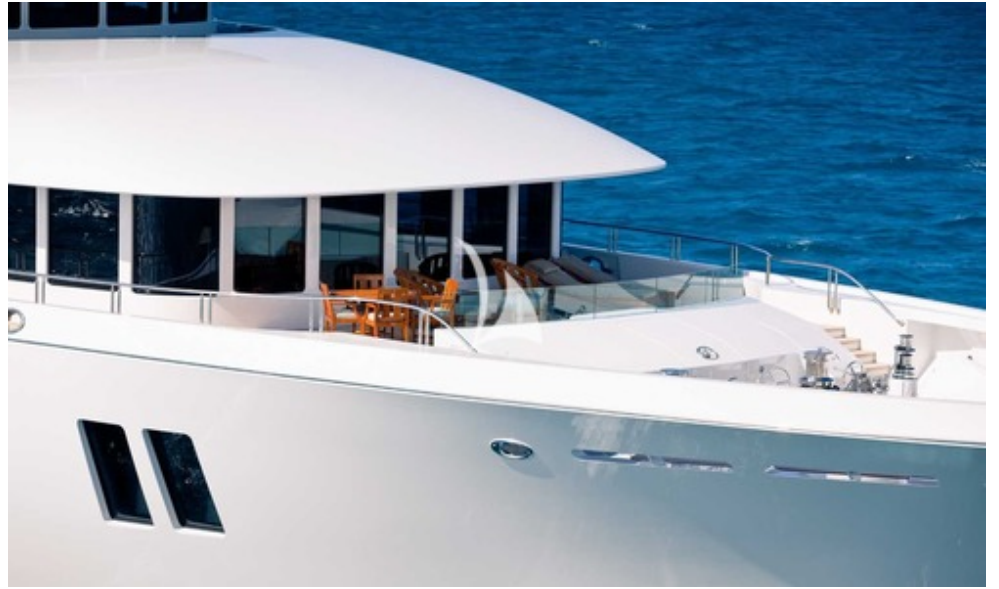
Owner's private deck