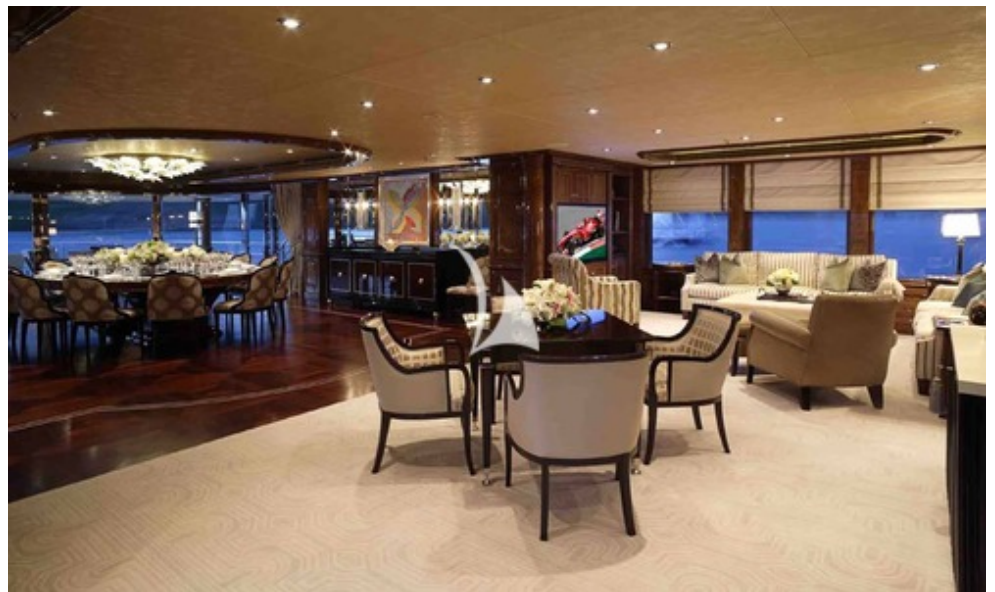
Owner's deck lounge and dining