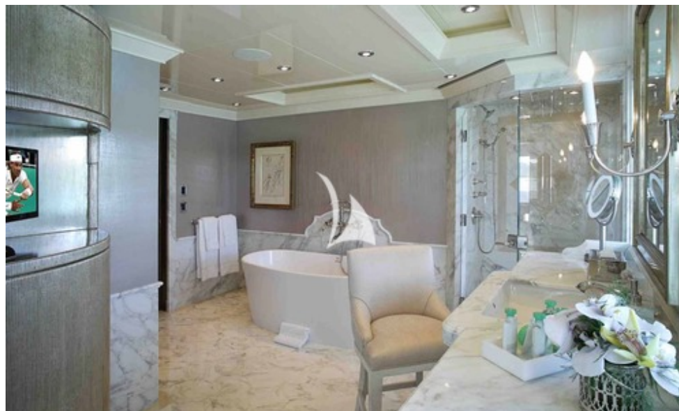
Master en suite - Hers