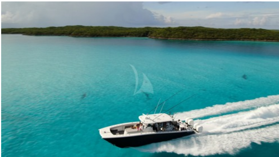
2020 Freeman 42LR