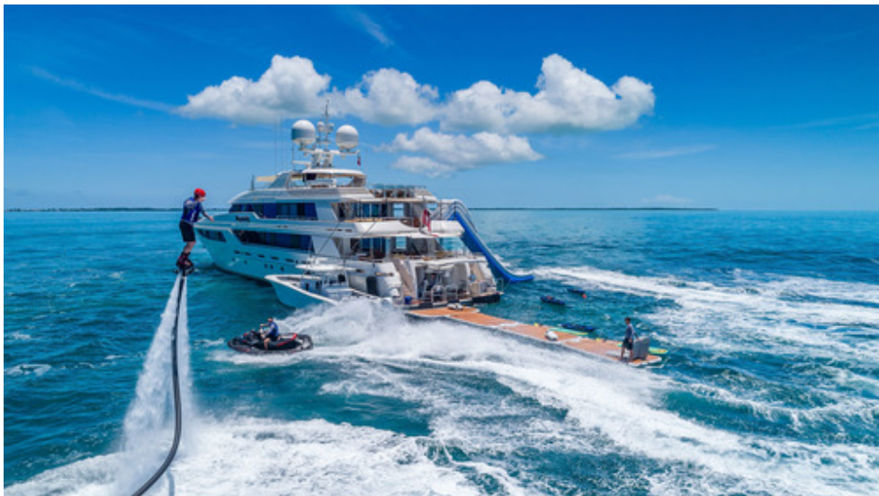
Exterior with all the toys