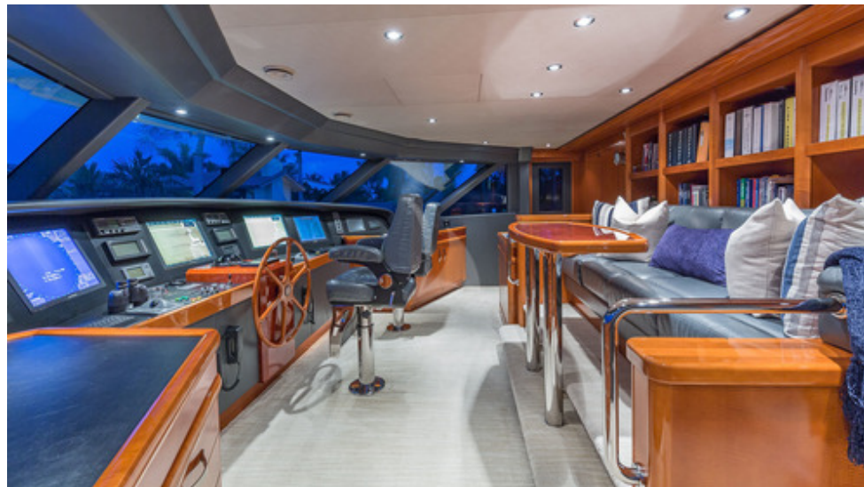
Bridge / Pilot House