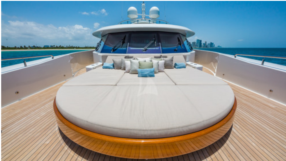
Bridge deck fwd sun pad