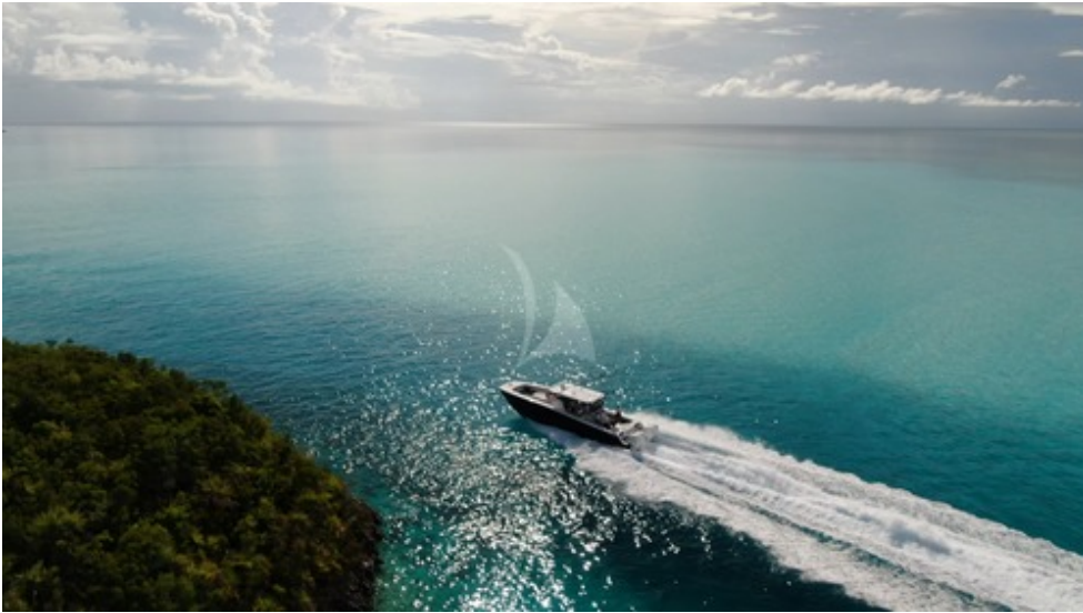
2020 Freeman 42LR