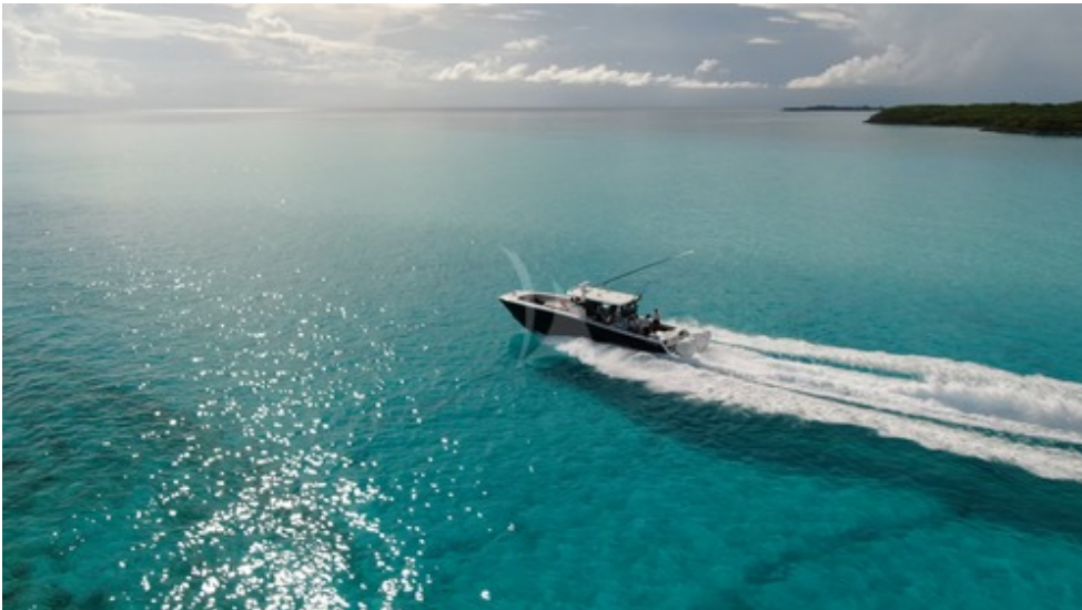
2020 Freeman 42LR