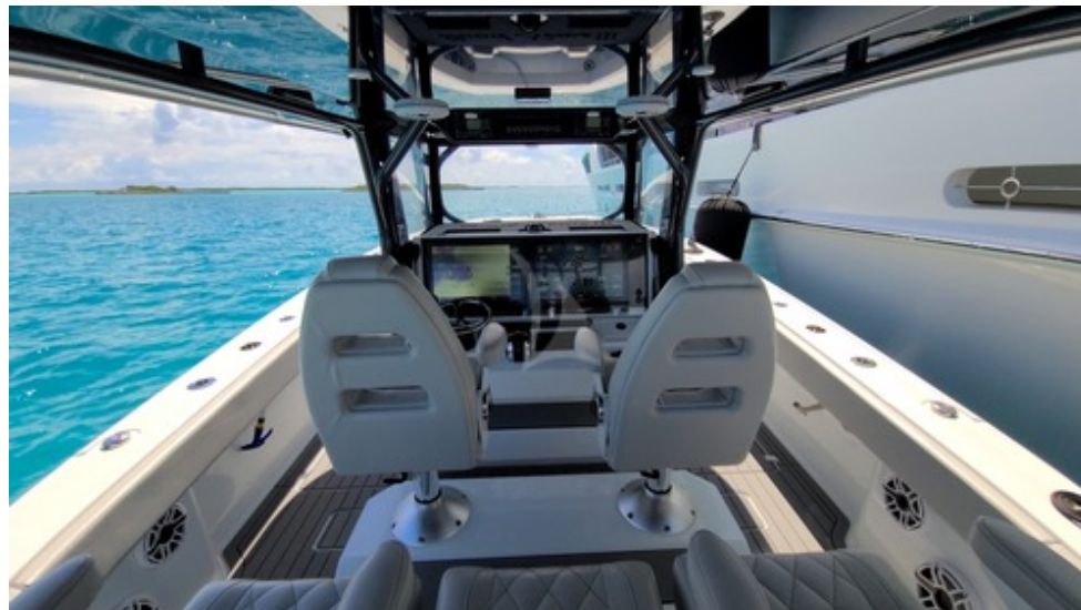
2020 Freeman 42LR