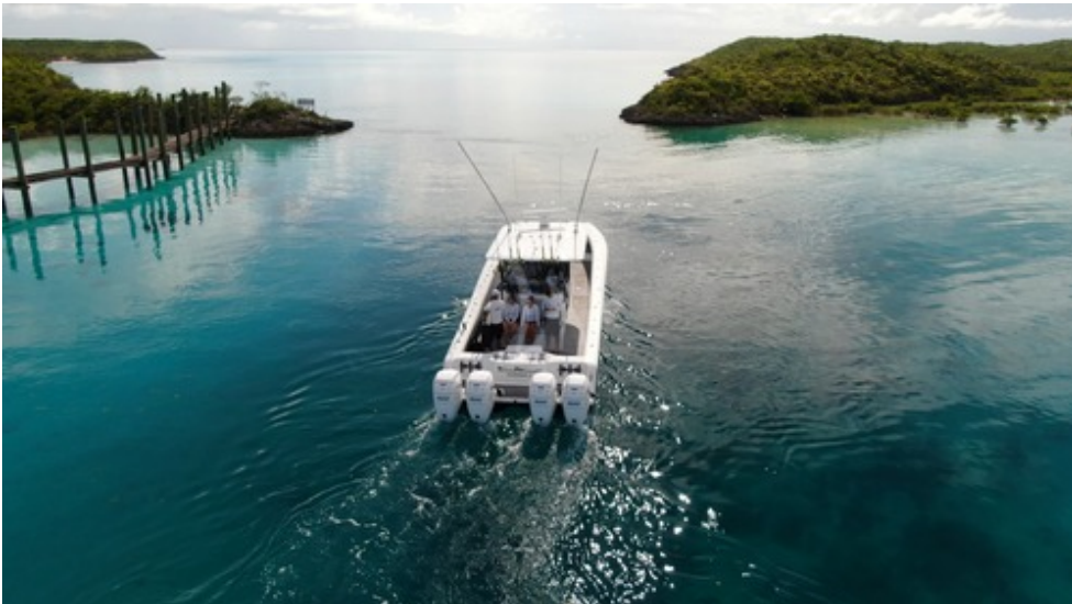
2020 Freeman 42LR