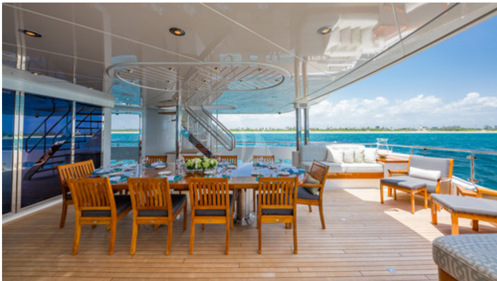
Main deck aft dining