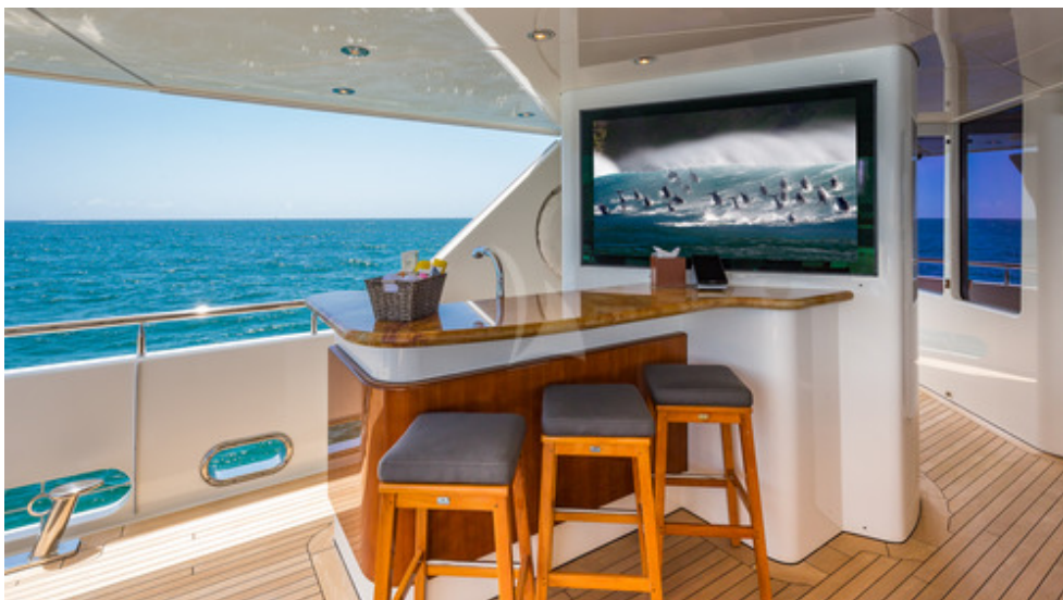
Main deck aft bar