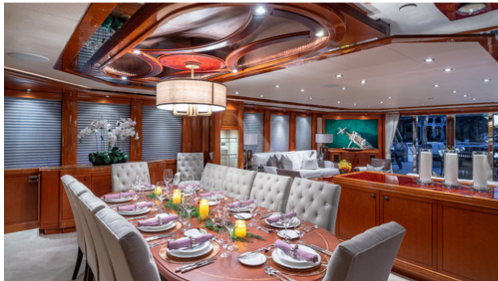
Main salon dining