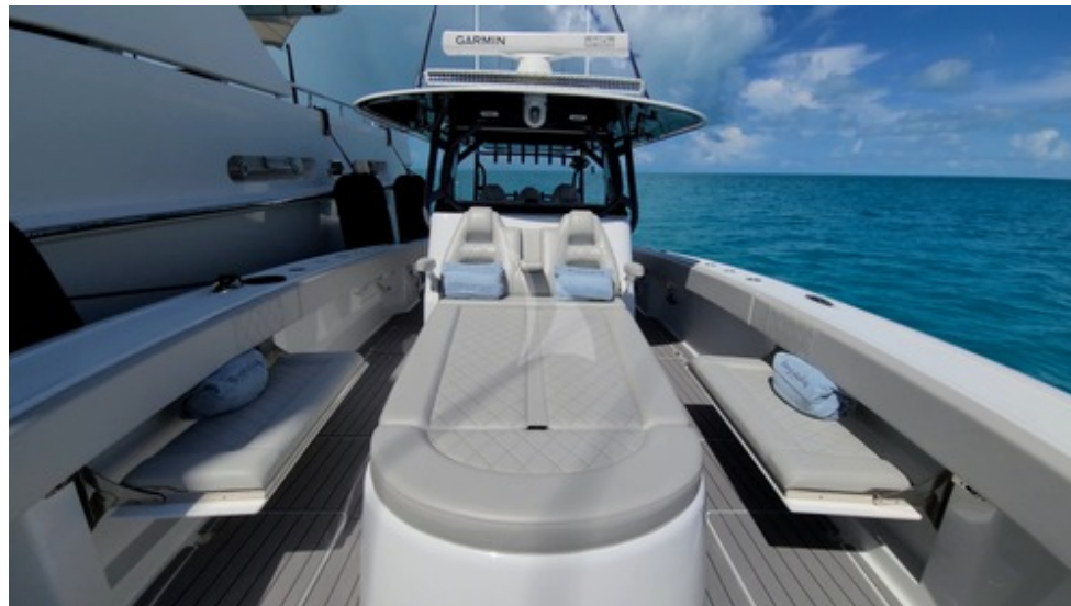
2020 Freeman 42LR