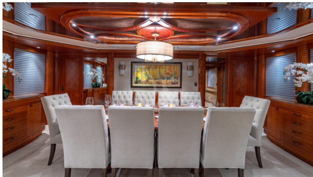
Main salon dining