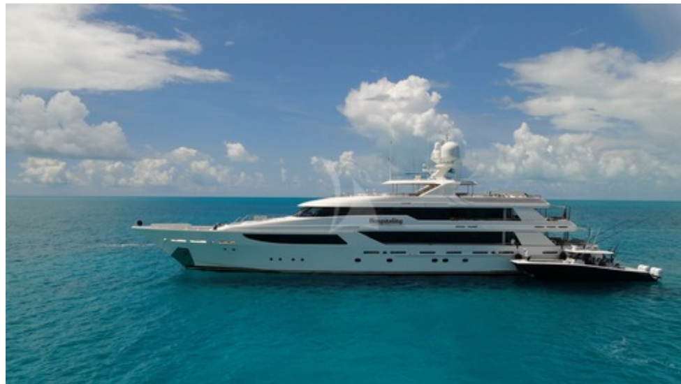
With New Tender - 2020 Freeman 42LR