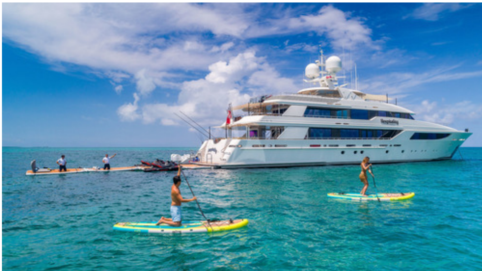
Exterior with SUPs