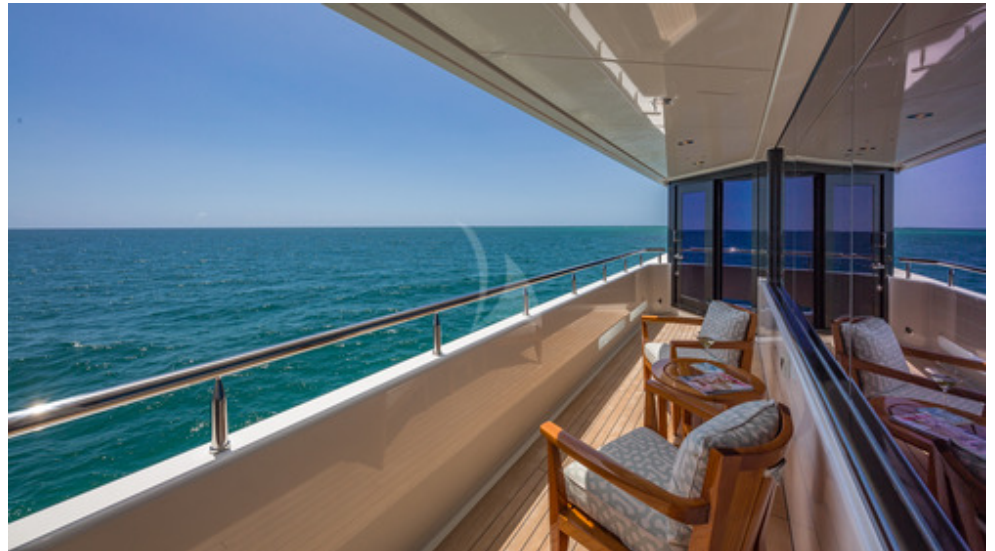
Private balcony off of Master stateroom