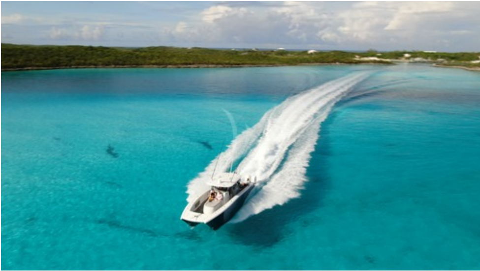
2020 Freeman 42LR