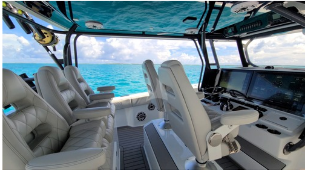
2020 Freeman 42LR