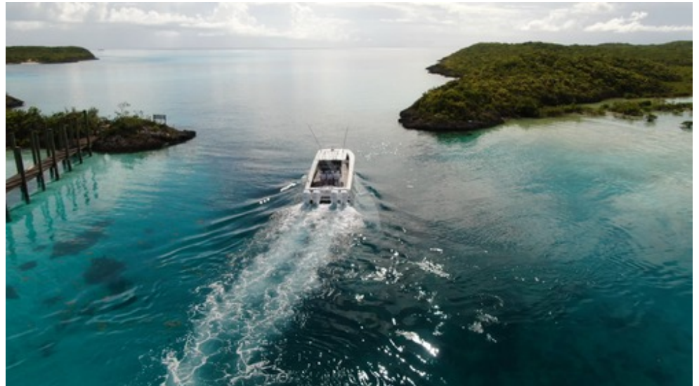
2020 Freeman 42LR