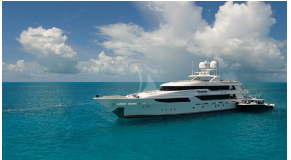
2020 Freeman 42LR