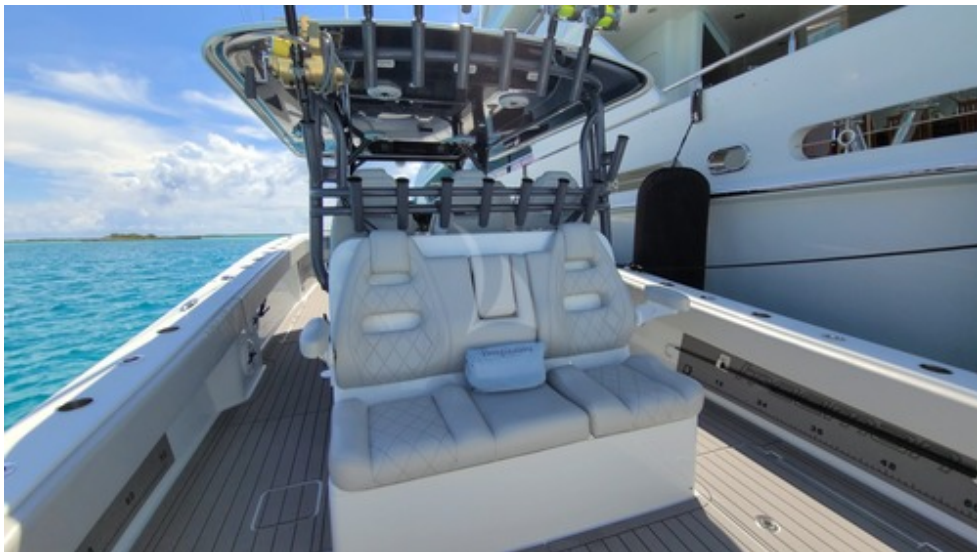
2020 Freeman 42LR