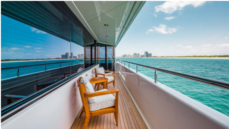
Private balcony off of Master stateroom