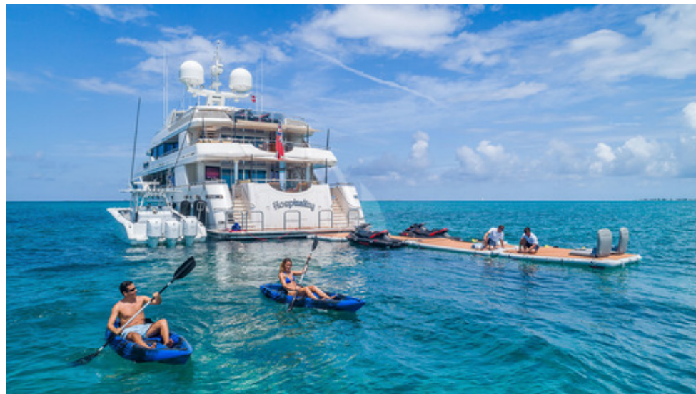
Exterior with kayaks