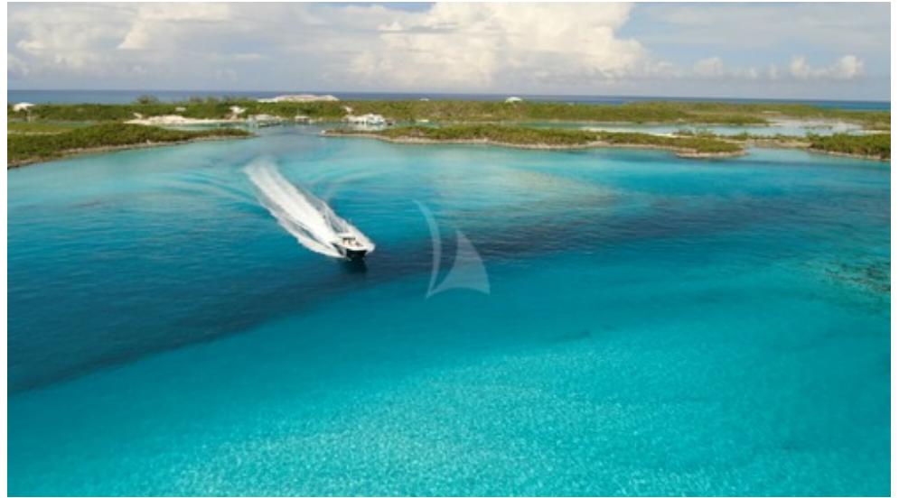
2020 Freeman 42LR