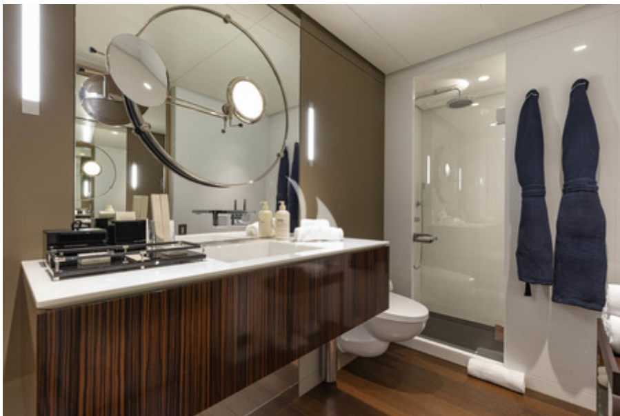
GUEST CABIN BATH