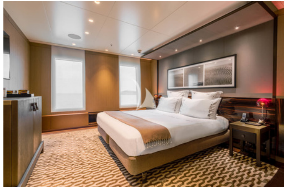
GUEST CABIN 3