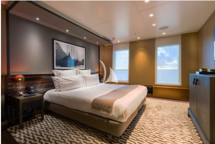
GUEST CABIN 2