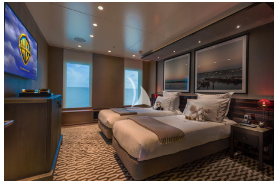
GUEST CABIN 4