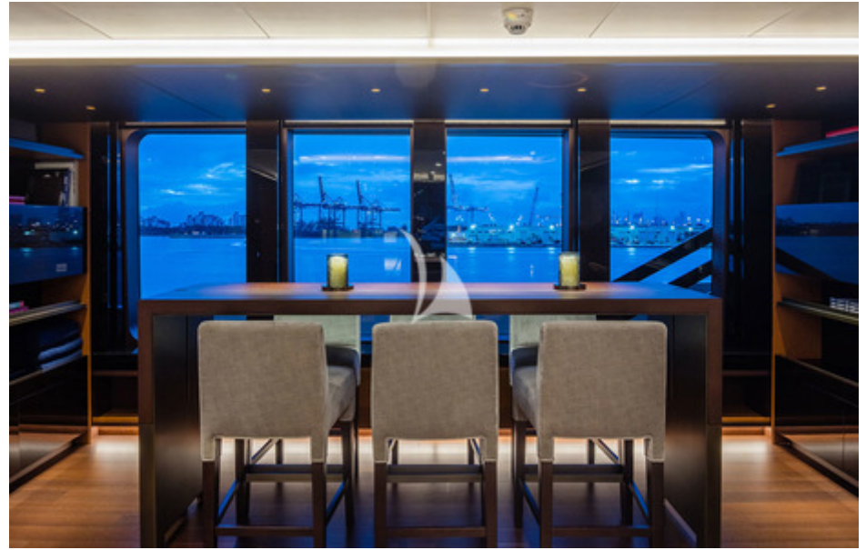
BRIDGE DECK LOUNGE