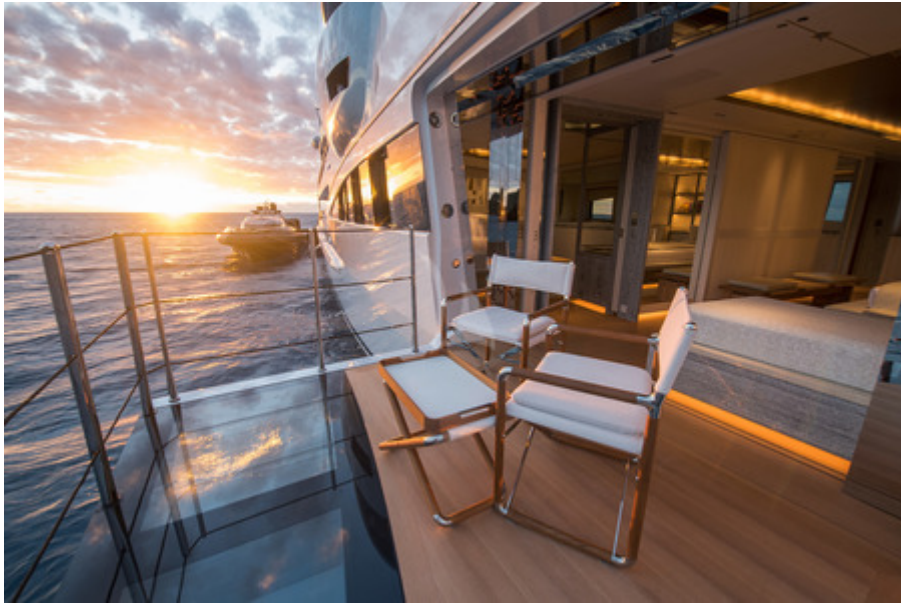
Master Balcony 2