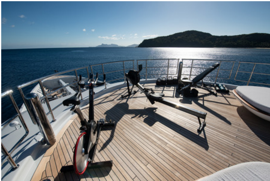
Sun Deck Gym Equipment