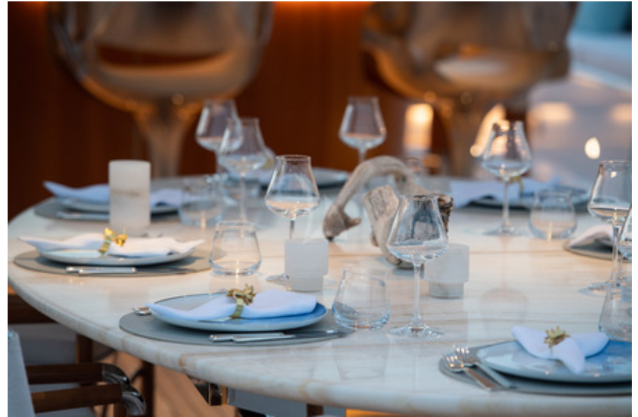
Sun Deck Dining Detail