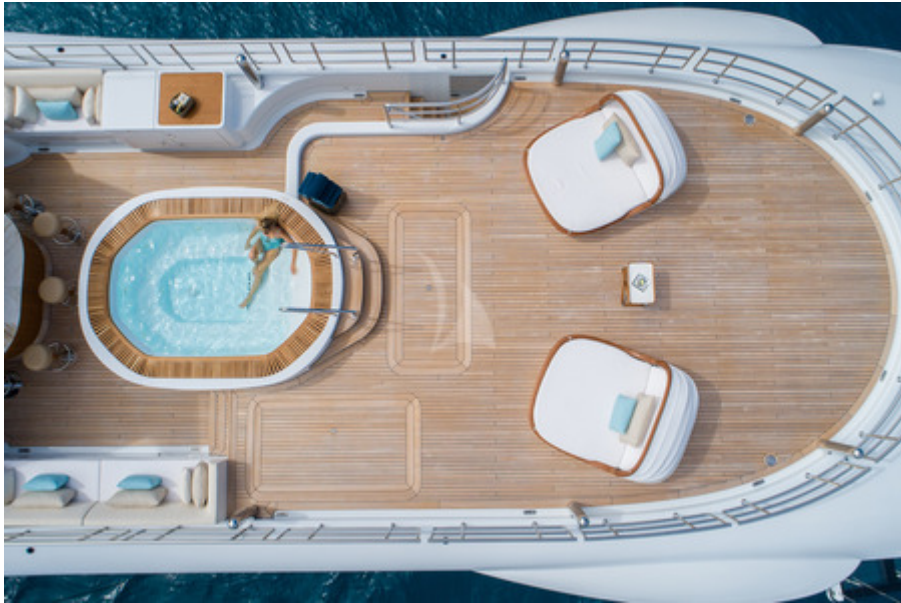
Sun Deck Aerial