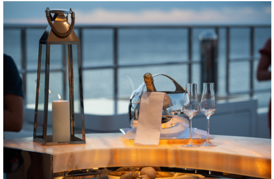
Sun Deck Bar Detail