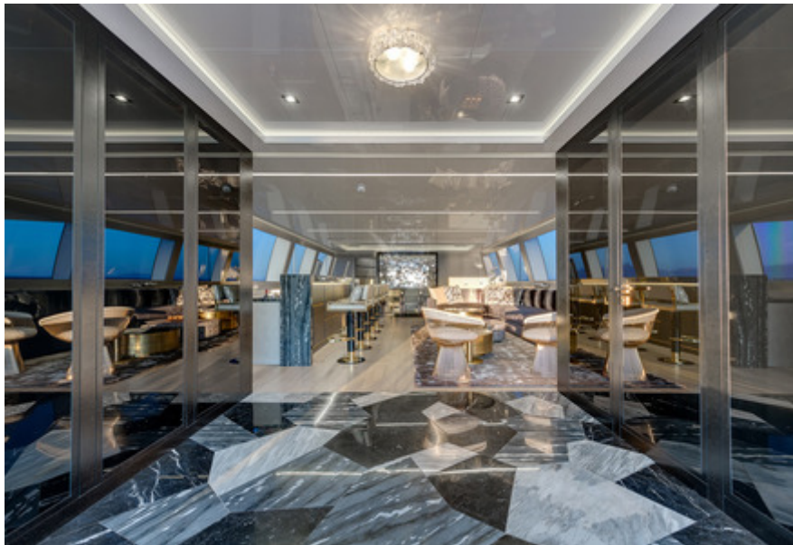
Main salon entrance