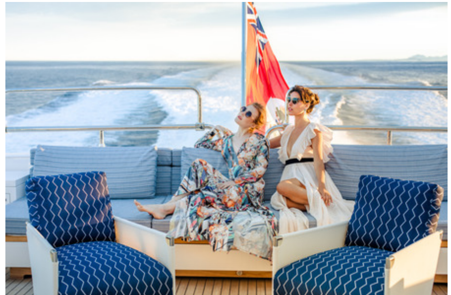
Enjoying the cruise