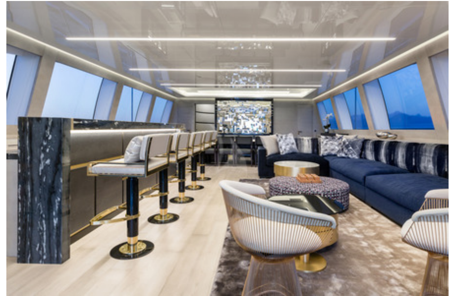
Bar & lounge area