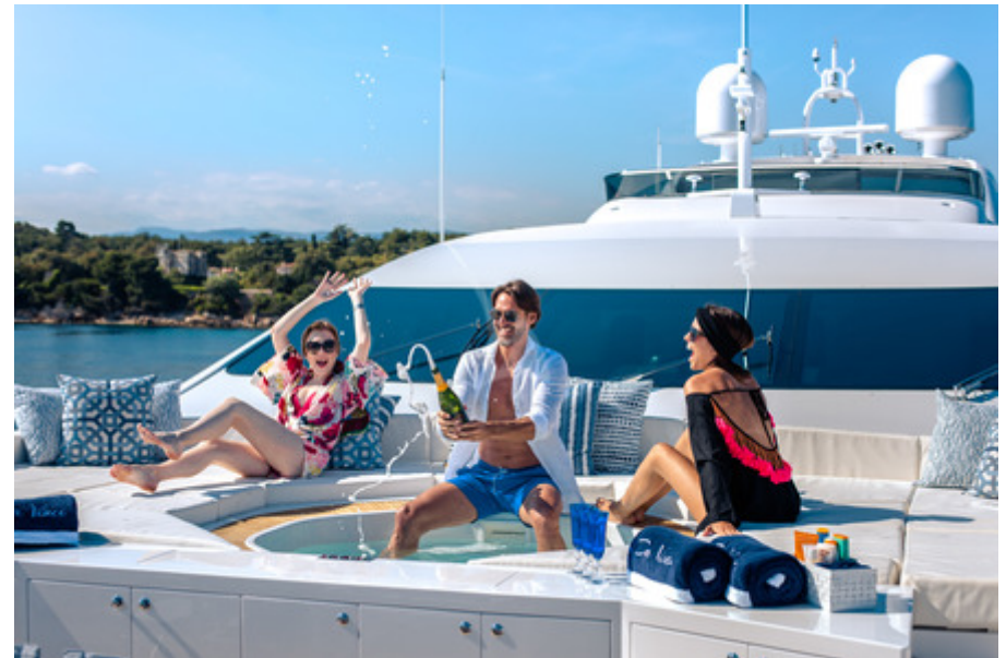
Enjoying the jacuzzi on the foredeck