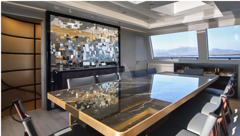
Table in the main salon