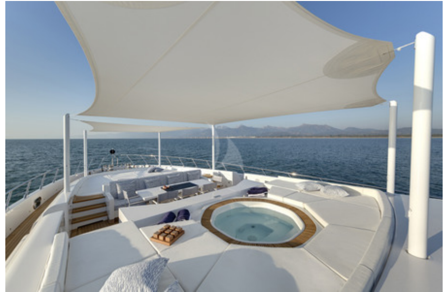
Jacuzzi on the foredeck