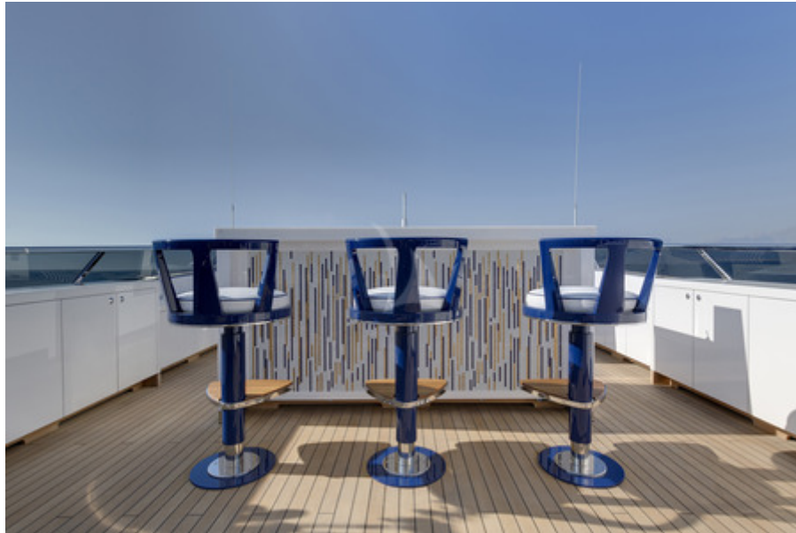
Bar on the sun deck