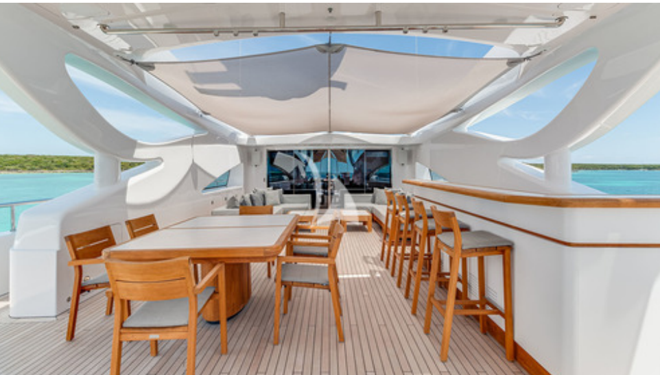
Upper Aft Deck Upper Aft Deck