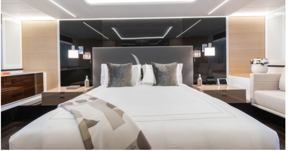
Double Cabin Double Cabin