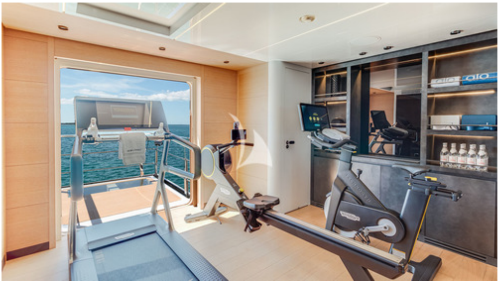
Balcony - Gym