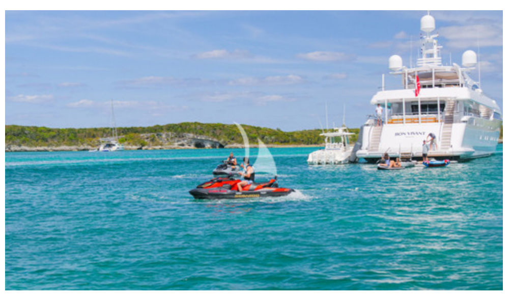
Water Sports Water Sports