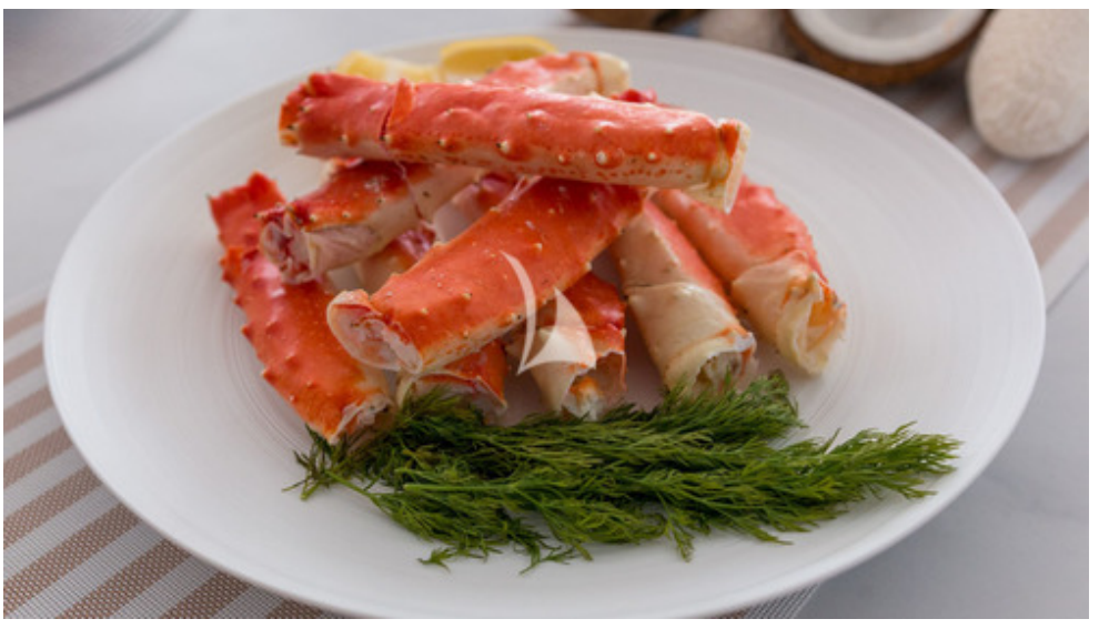
Chef's Specials Fresh Catch