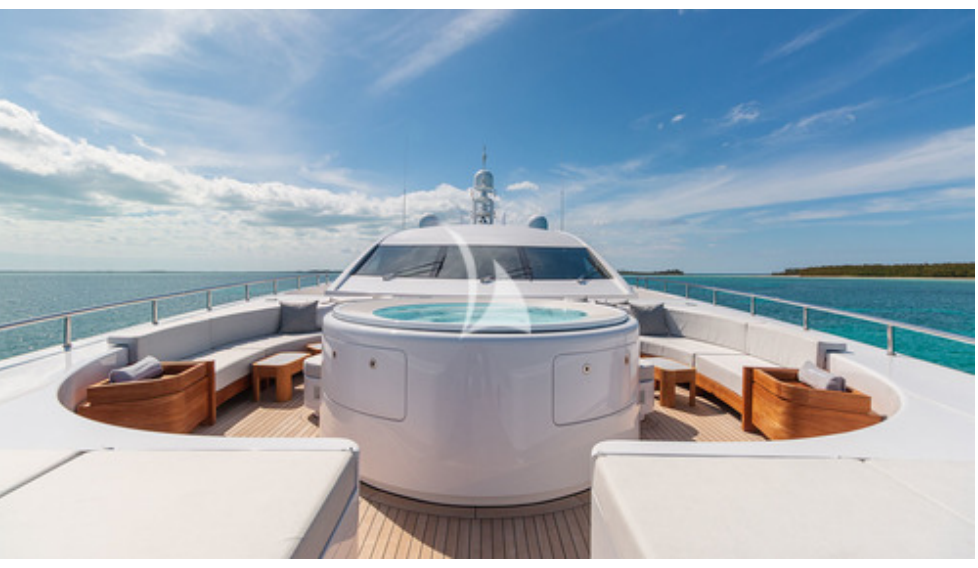
Upper Aft Deck Bow Seating