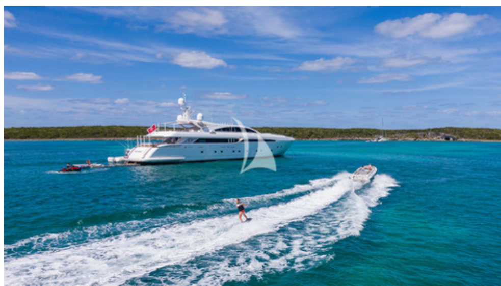
Water Sports Water Sports