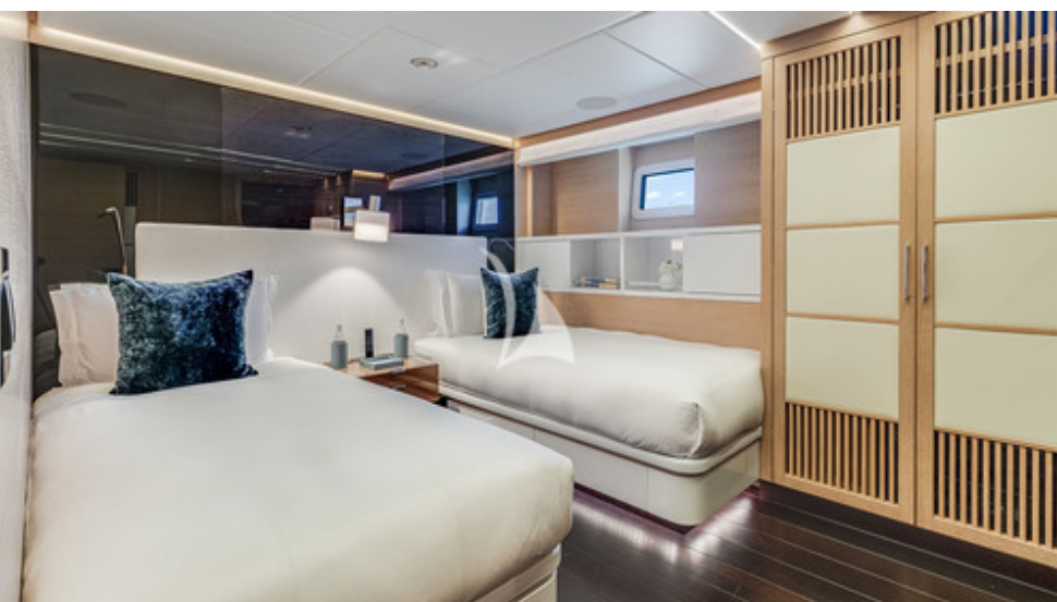
Double Cabin Twin Cabin