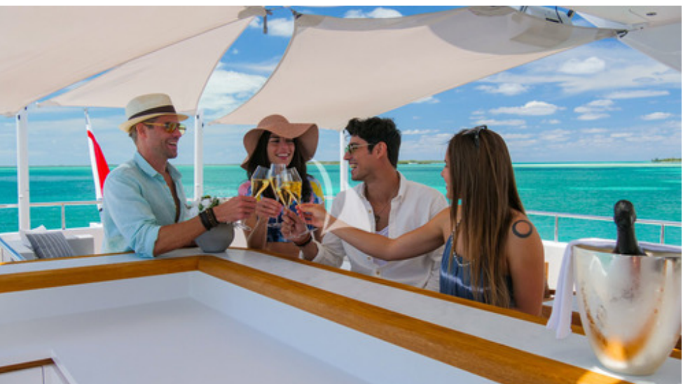
Upper Aft Deck Upper Aft Deck