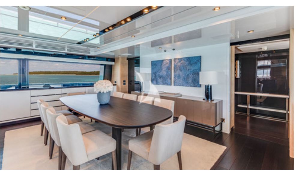
Salon Bar Dining