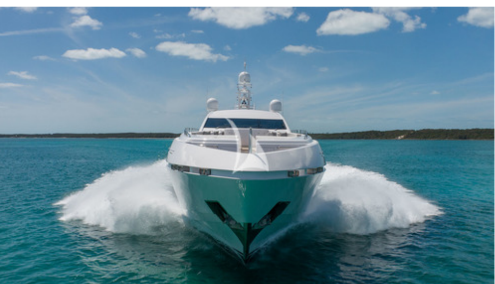
Water Sports Running