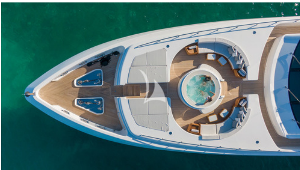
Jacuzzi Aerial Jacuzzi Aerial