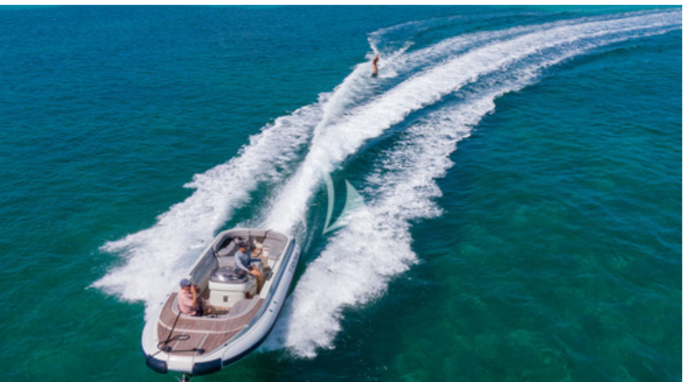
Water Sports Tender