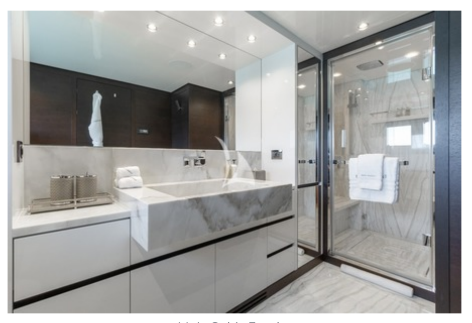
Main Cabin Ensuite