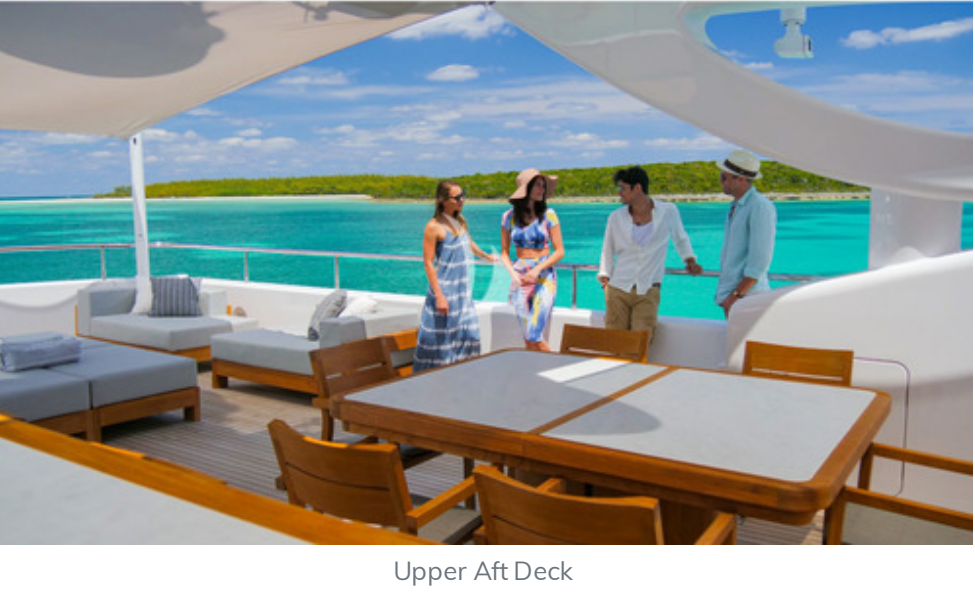
Upper Aft Deck Bar Uppe